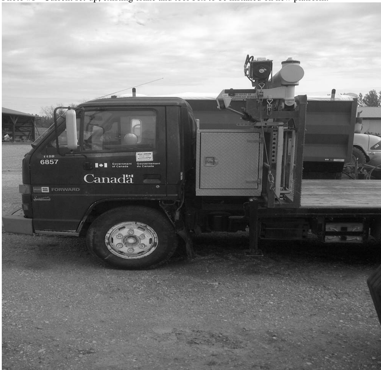
Photo #1 - Current set-up, existing crane and tool box to be installed on new platform.