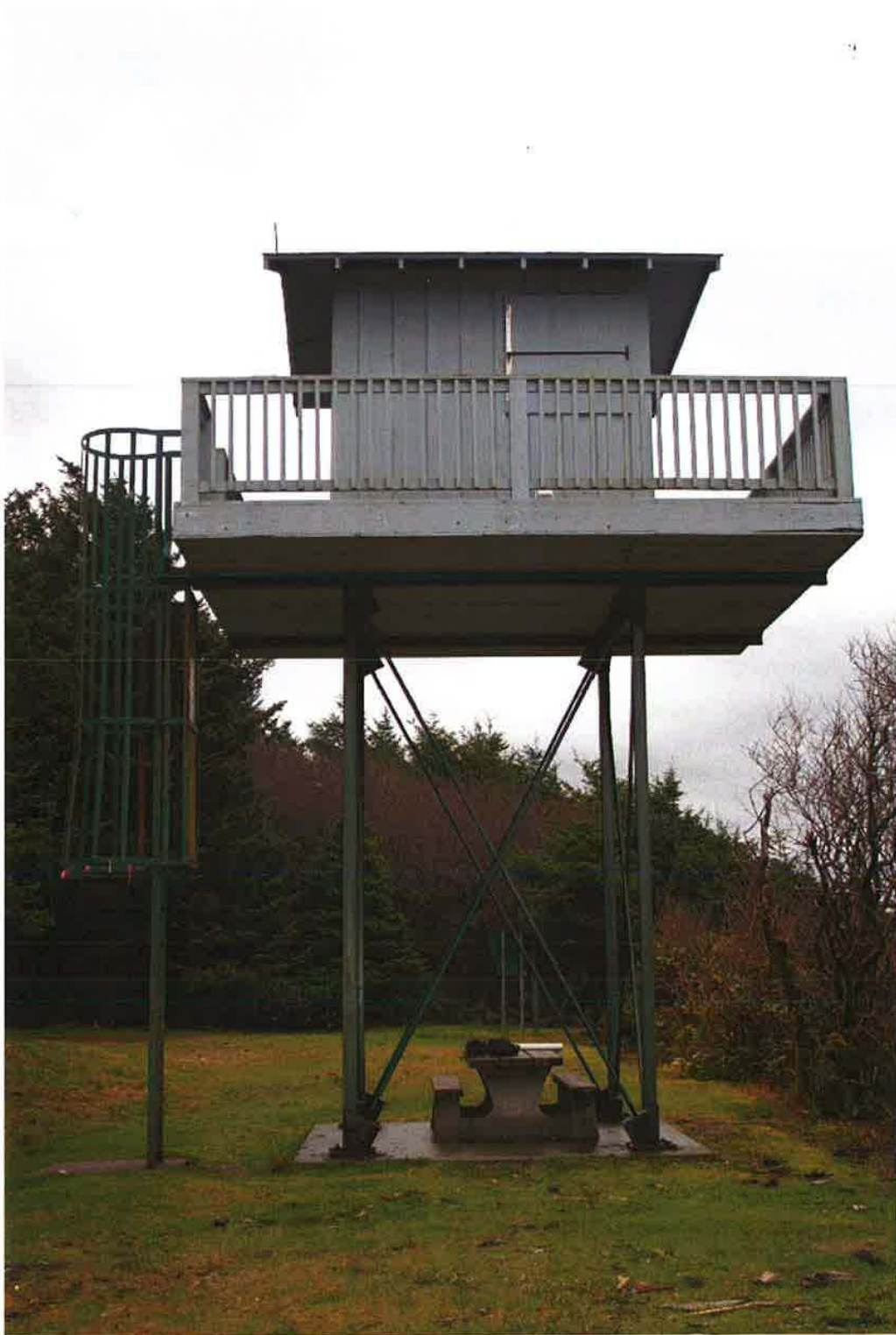
Photo 1: Full view of the Sun Surf Watch Tower at Long Beach, Tofino, BC.