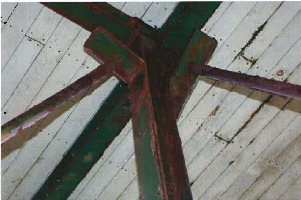
Photo 3: Top Connection 2 of the steel platform showing rusting issues