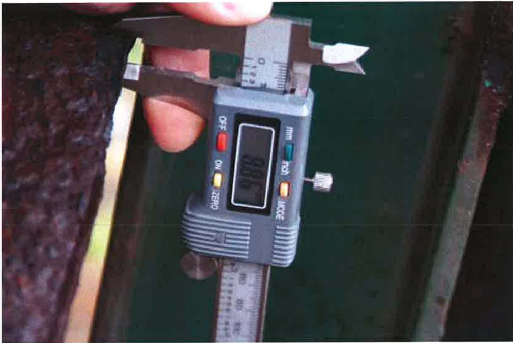
Photo 12: Site measurement showing reduction of steel material thickness. (Original at 10mm thick)