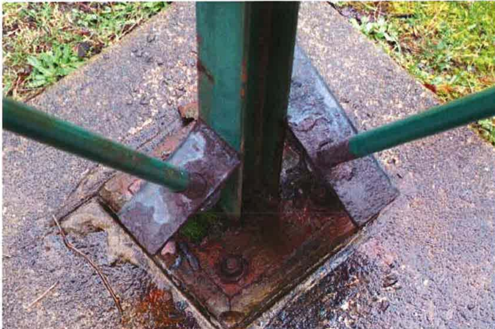
Photo 6: Base Connection 1 of the steel platform showing rusting issues