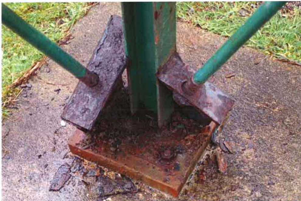
Photo 9: Base Connection 4 of the steel platform showing rusting issues