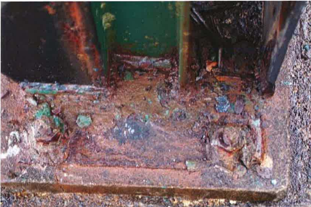
Photo 11: Close up of the base anchor bolts showing the complete rusting of the washers