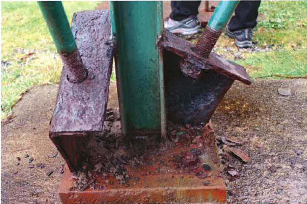
Photo 10: Close up of the base connection showing advanced stage of rusting.