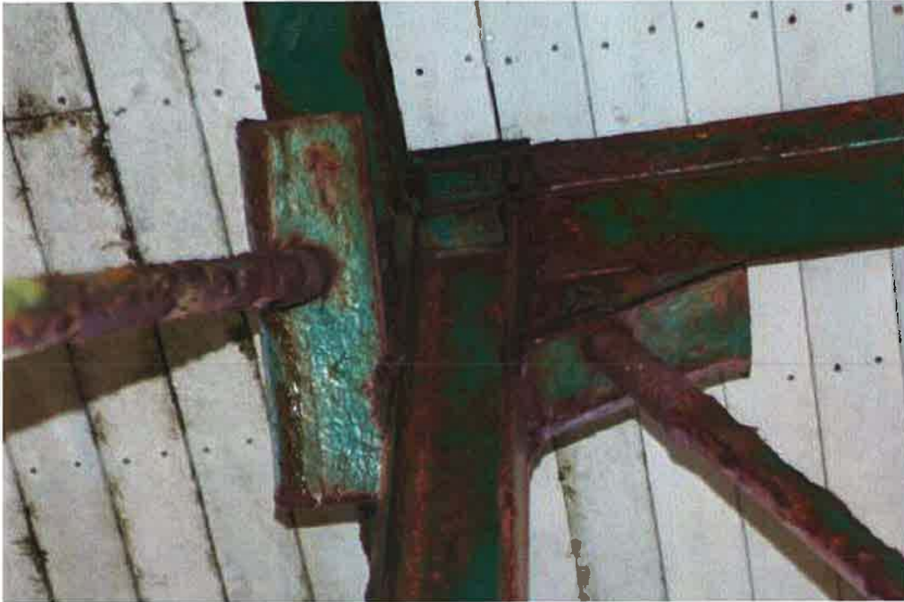
Photo 2: Top Connection 1 of the steel platform showing rusting issues