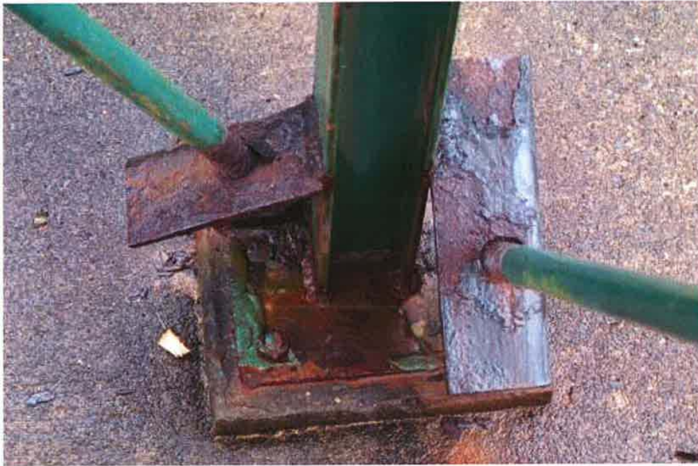
Photo 8: Base Connection 3 of the steel platform showing rusting issues