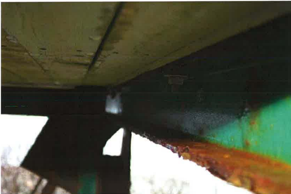
Photo 13: Rusting of the steel beam along the length of the member.