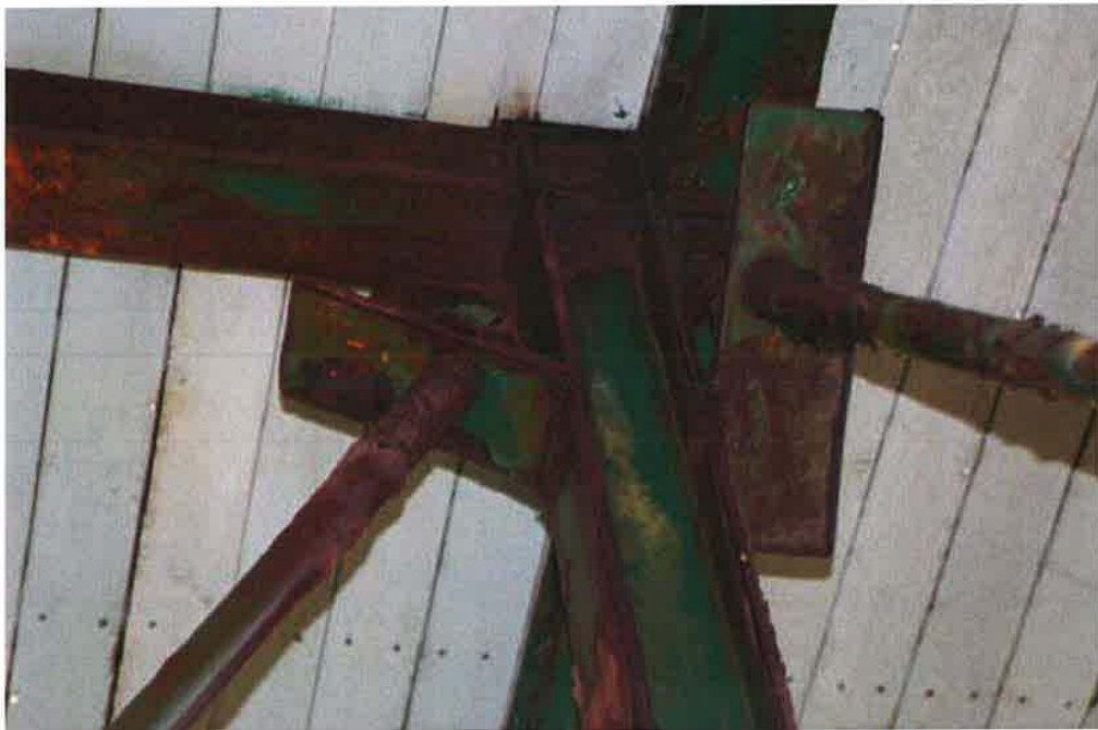
Photo 5: Top Connection 4 of the steel platform showing rusting issues