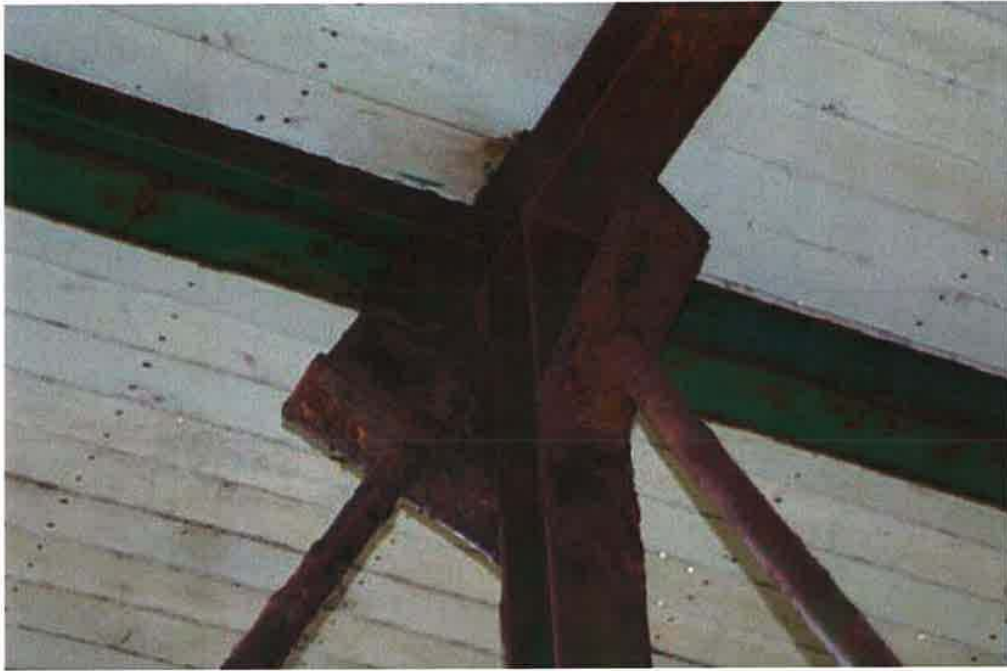
Photo 4: Top Connection 3 of the steel platform showing rusting issues