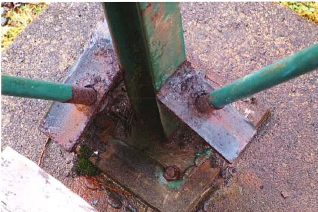
Photo 7: Base Connection 2 of the steel platform showing rusting issues