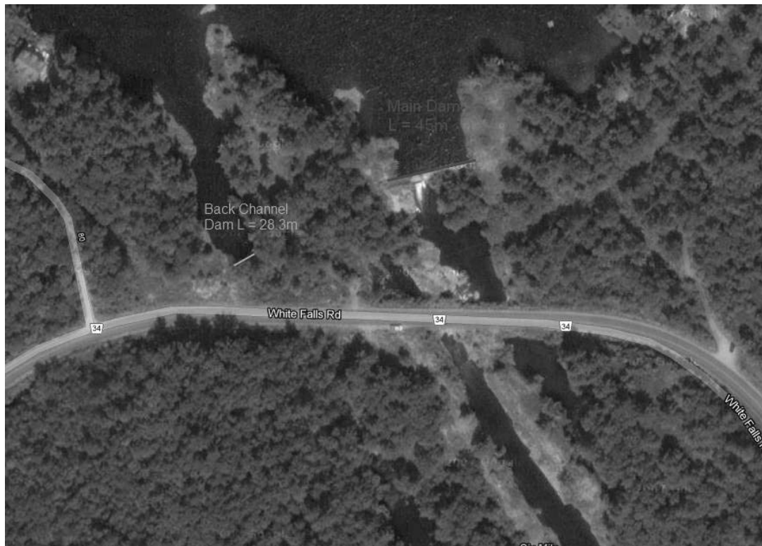
Six Mile Lake Dams.jpg