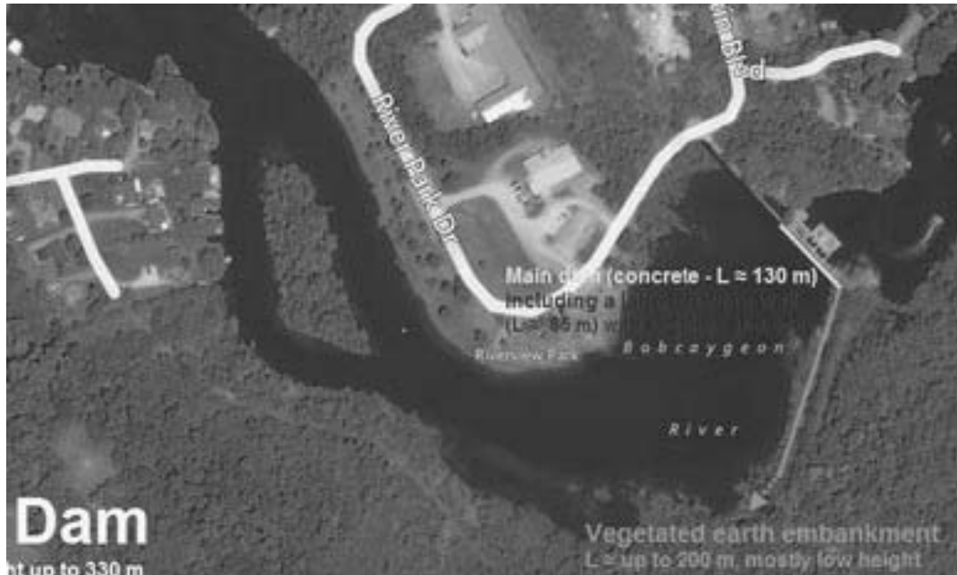
Little Bob River Dam Map.jpg