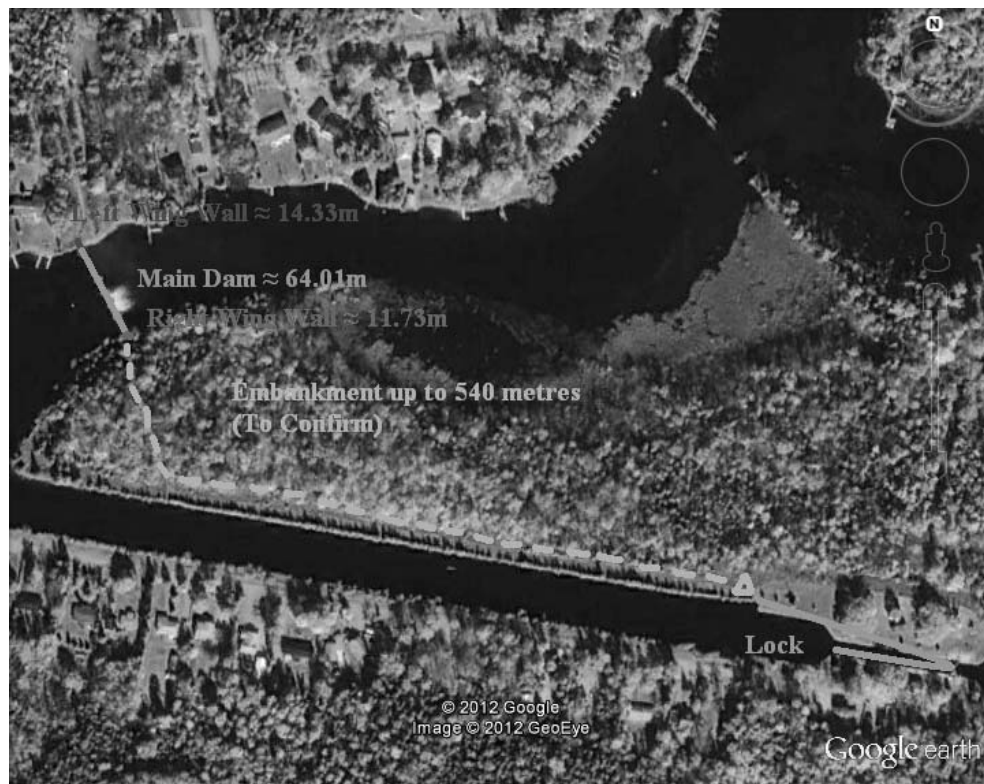
Rosedale Dam and Lock Map.bmp