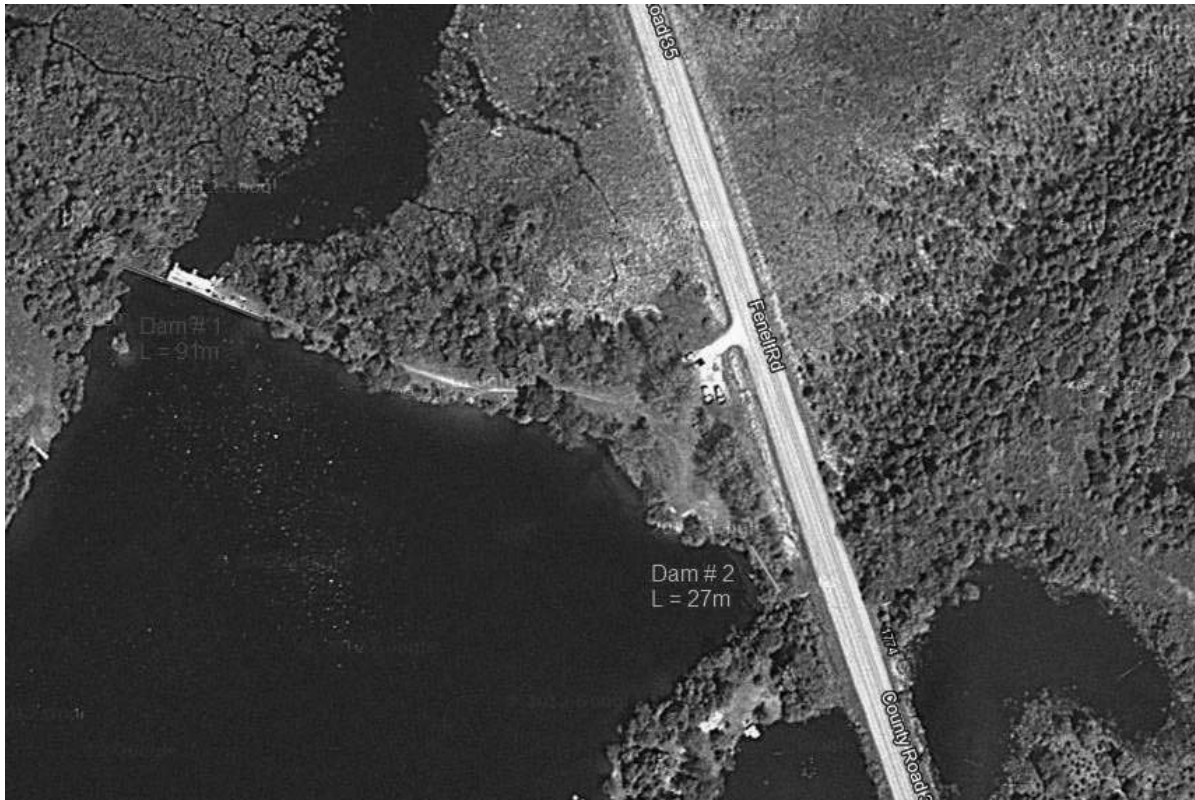
Victoria Road Dams.jpg