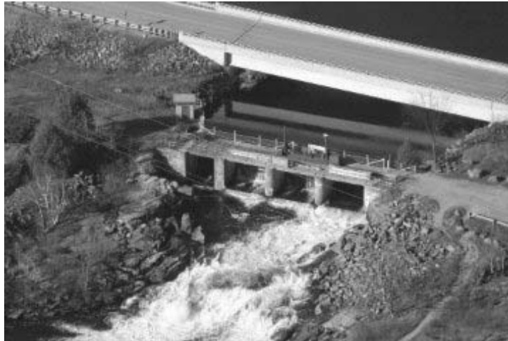
Whites Portage Dam 2006.jpg