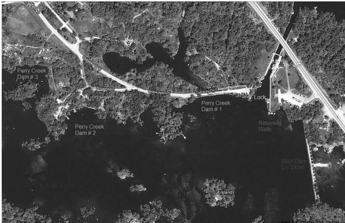
Burleigh Falls Dam.jpg