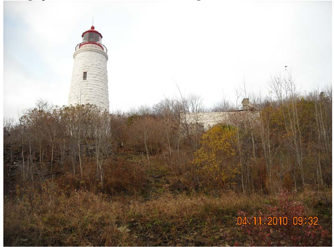
Photograph No.4 – View of light tower and former light keeper dwelling facing west from base of slope.

Photograph No.3 – View of flat area south of light tower.