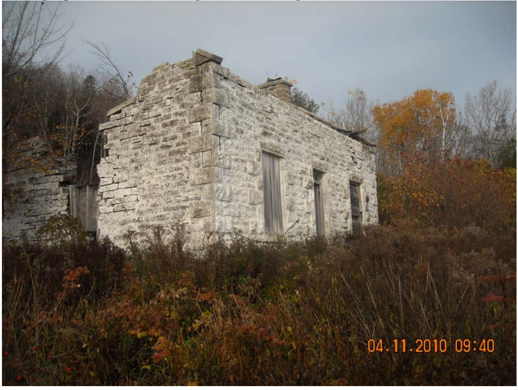
Photograph No.2 – View of former light keepers dwelling facing northwest.