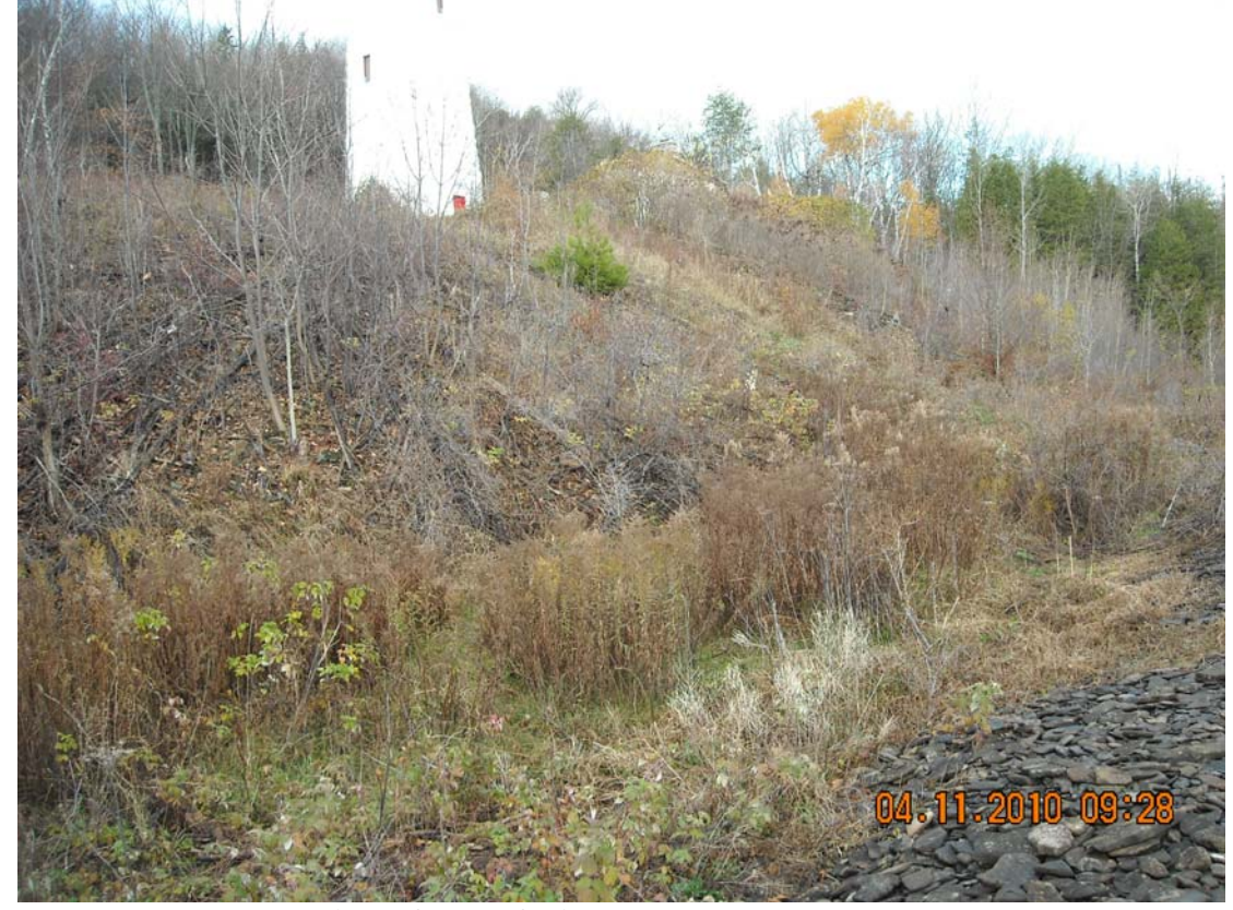
Photograph No.8 – View of slope facing north-northwest