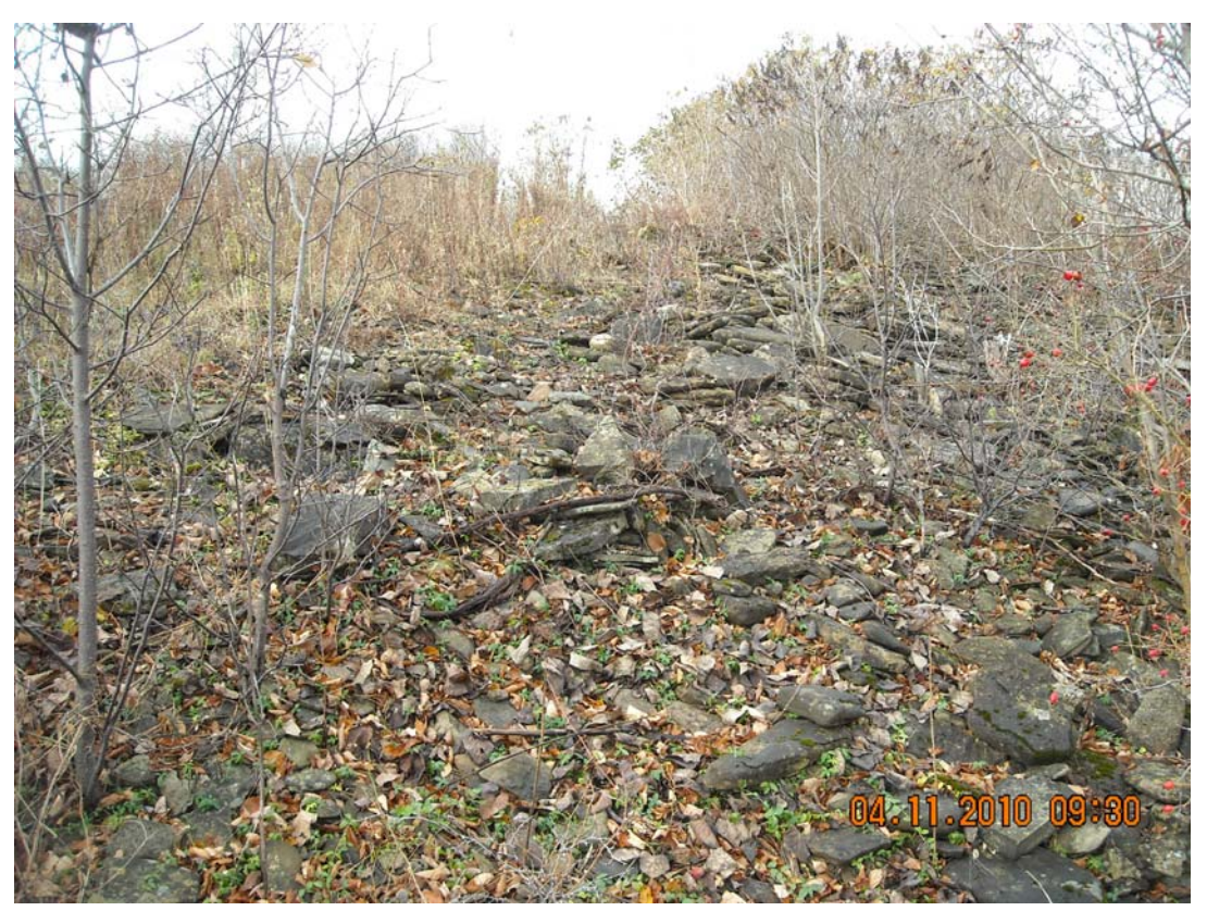
Photograph No.5 – View of shale and vegetation half-way down slope facing west.