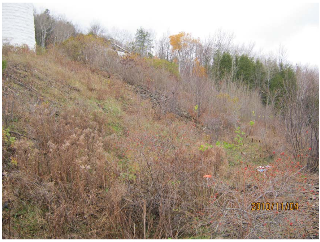
Photograph No.7 – View of slope facing north-northwest