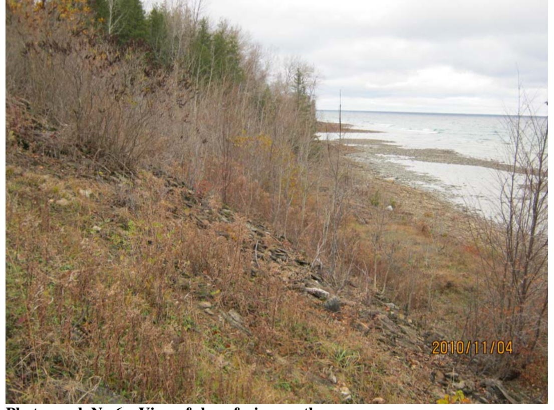
Photograph No.6 – View of slope facing north.