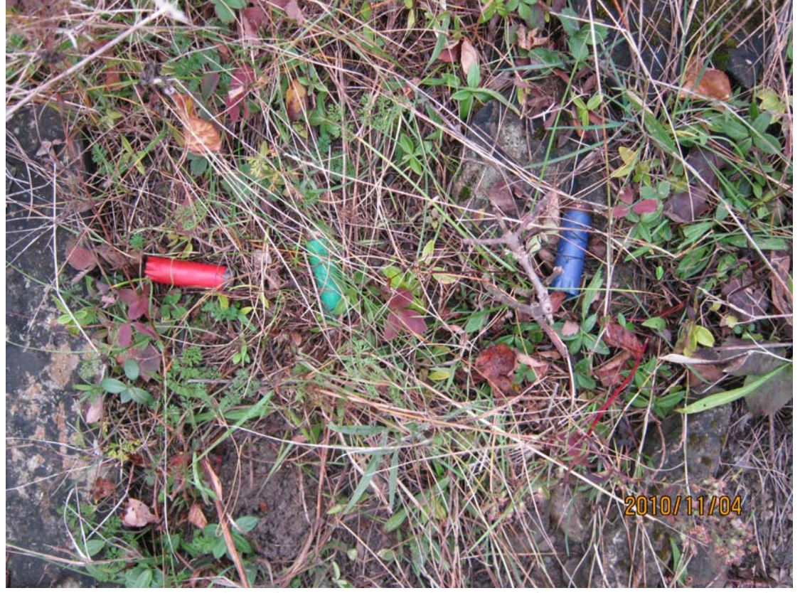
Photograph No.12 – View of spend shell casings along footpath towards shoreline.