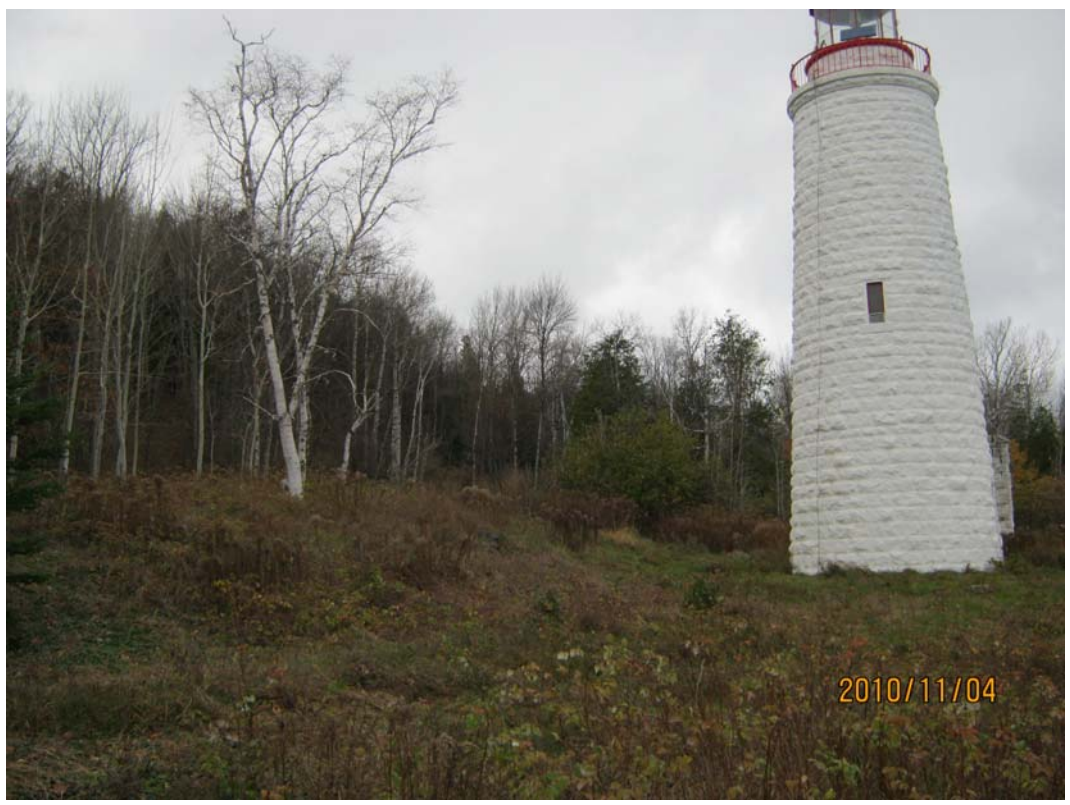
Photograph No.1 – View of light tower facing northwest.