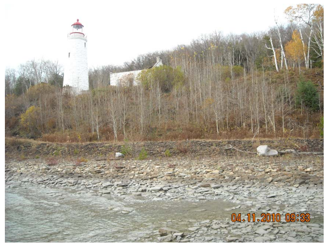
Photograph No. 11 – View of site facing southwest.