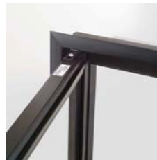
Heavy Duty Hinging System