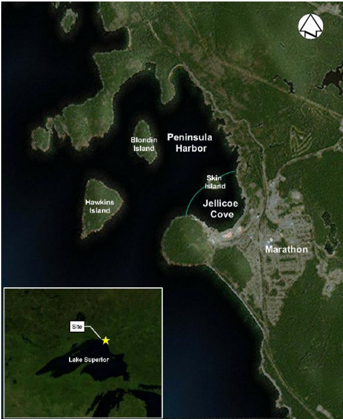
Figure 1: Location of Project Site – Jellicoe Cove, Peninsula Harbour