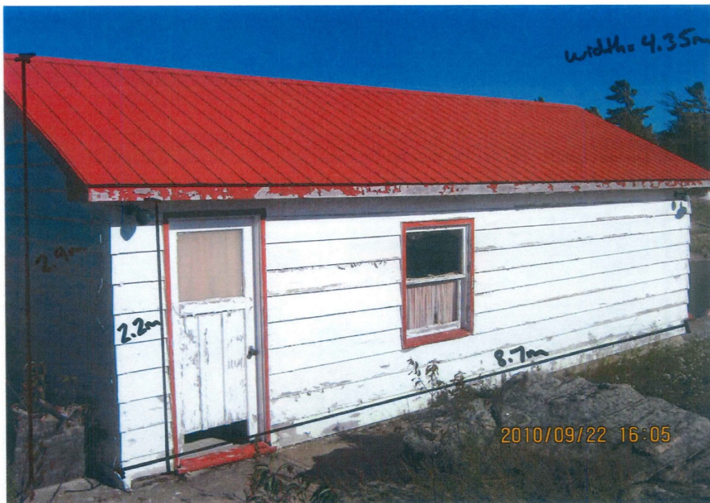
Photograph 20 – View of Boathouse with dimensions.