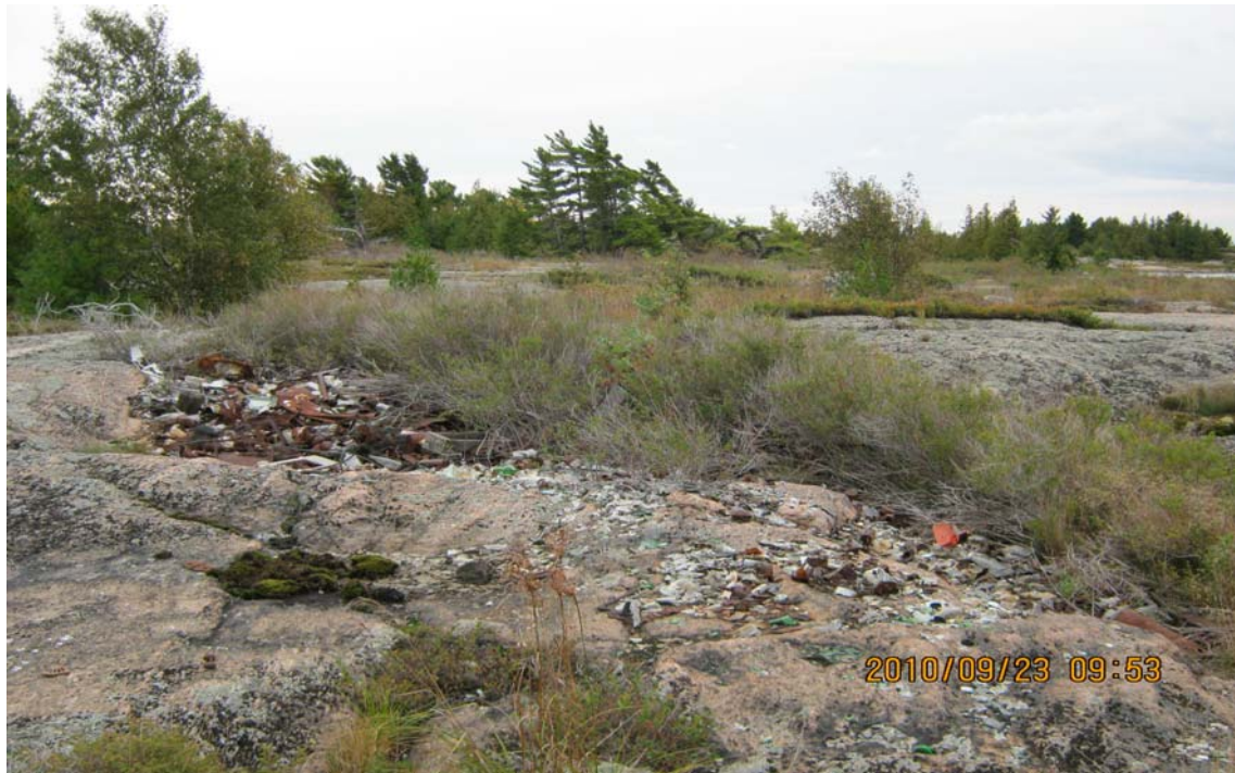
Photo 9: View of Dump Area 1 (CS-005-00024547) facing south.