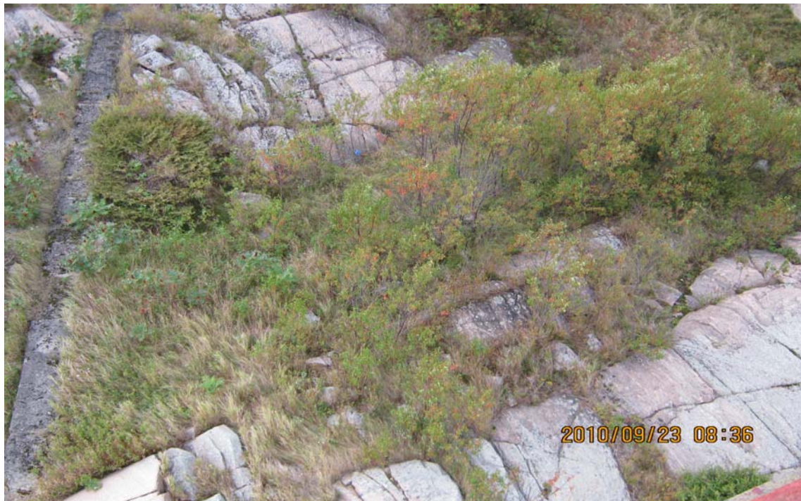
Photo 14: View facing southwest looking down from top of lighthouse tower.