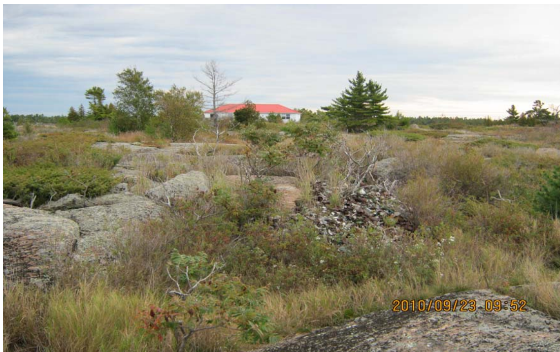
Photo 10: View of Dump Area 2 (CS-004-00013240) facing east.