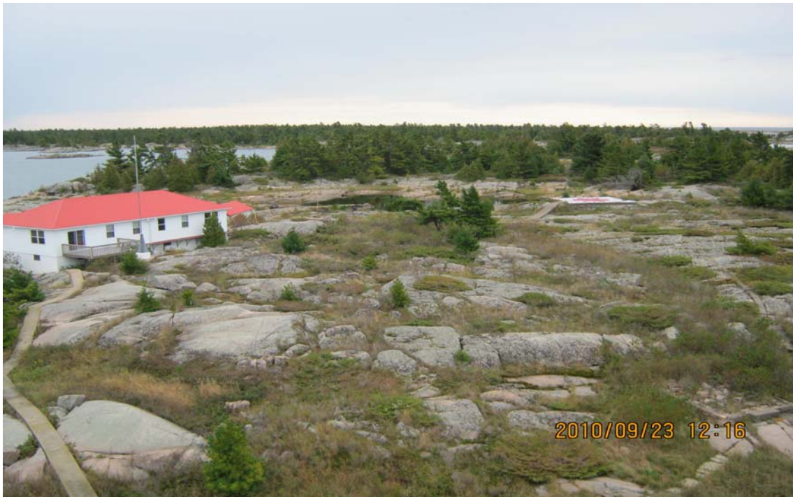
Photo 3: View from top of lighthouse facing south, residence building, helicopter pad, and boathouse visible.