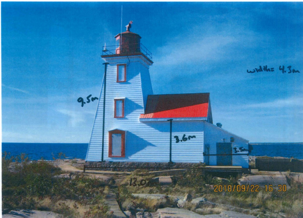
Photograph 19 – View of Lighthouse with dimensions.