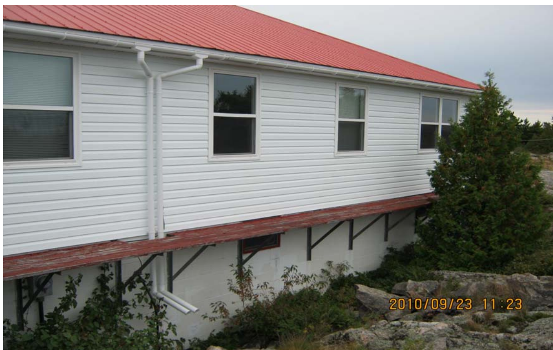
Photo 18: View of exterior walkway on west side of residence building, sample R.B LS-9 was found to be above criteria and is considered lead based.