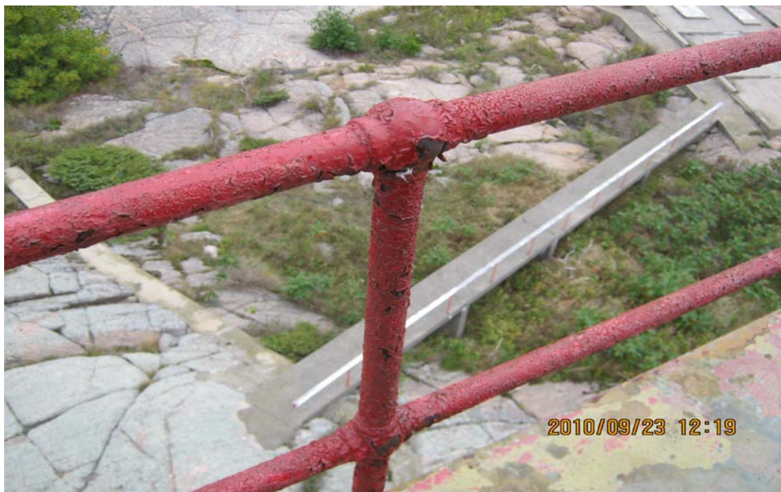
Photo 16: View of L.H LS-7 sample location on top of lighthouse. Sample was found to be above criteria and is considered lead based.