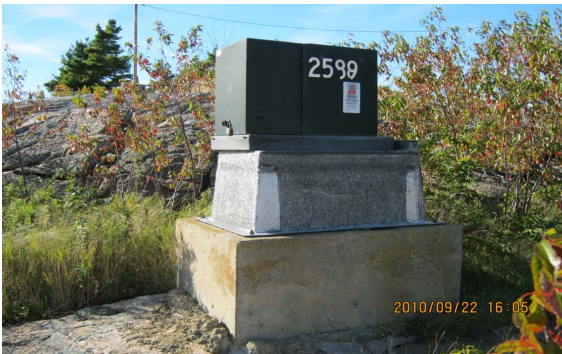
Photo 8: View of electrical transformer northwest of the boathouse.