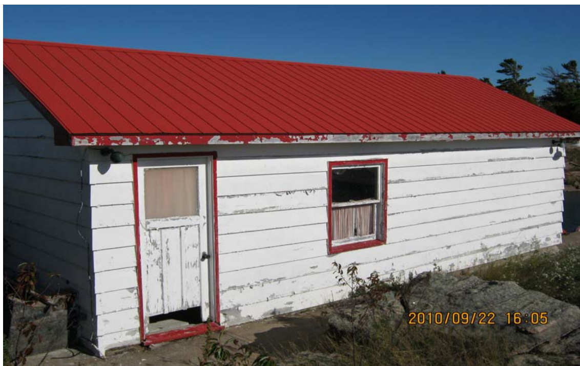
Photo 17: View of boathouse facing southeast, sample B.H LS-2 (red trim) was found to be above criteria and is considered lead based.