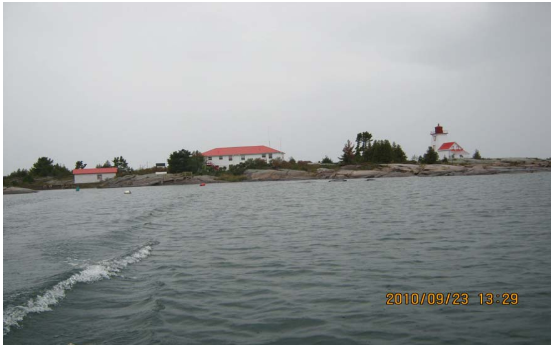
Photo 1: View of the Gereaux Island Light Station from Georgian Bay.