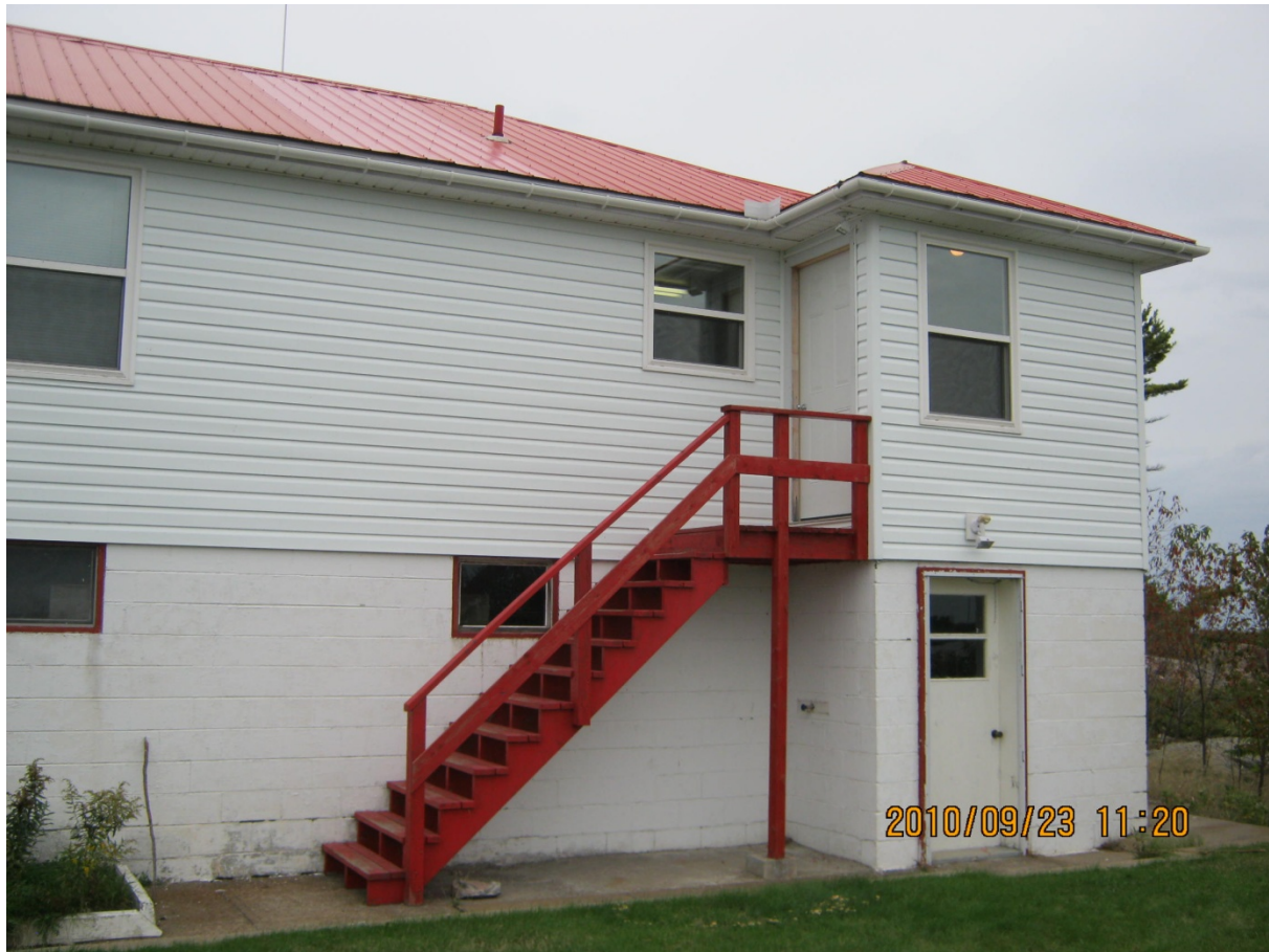
Photograph 21 – View of Residence Building.