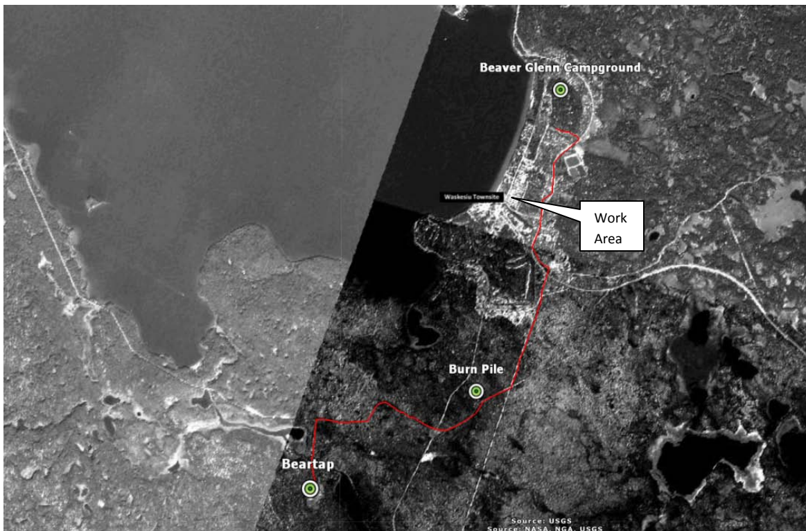
Map 2: Location of work area and material staging areas.