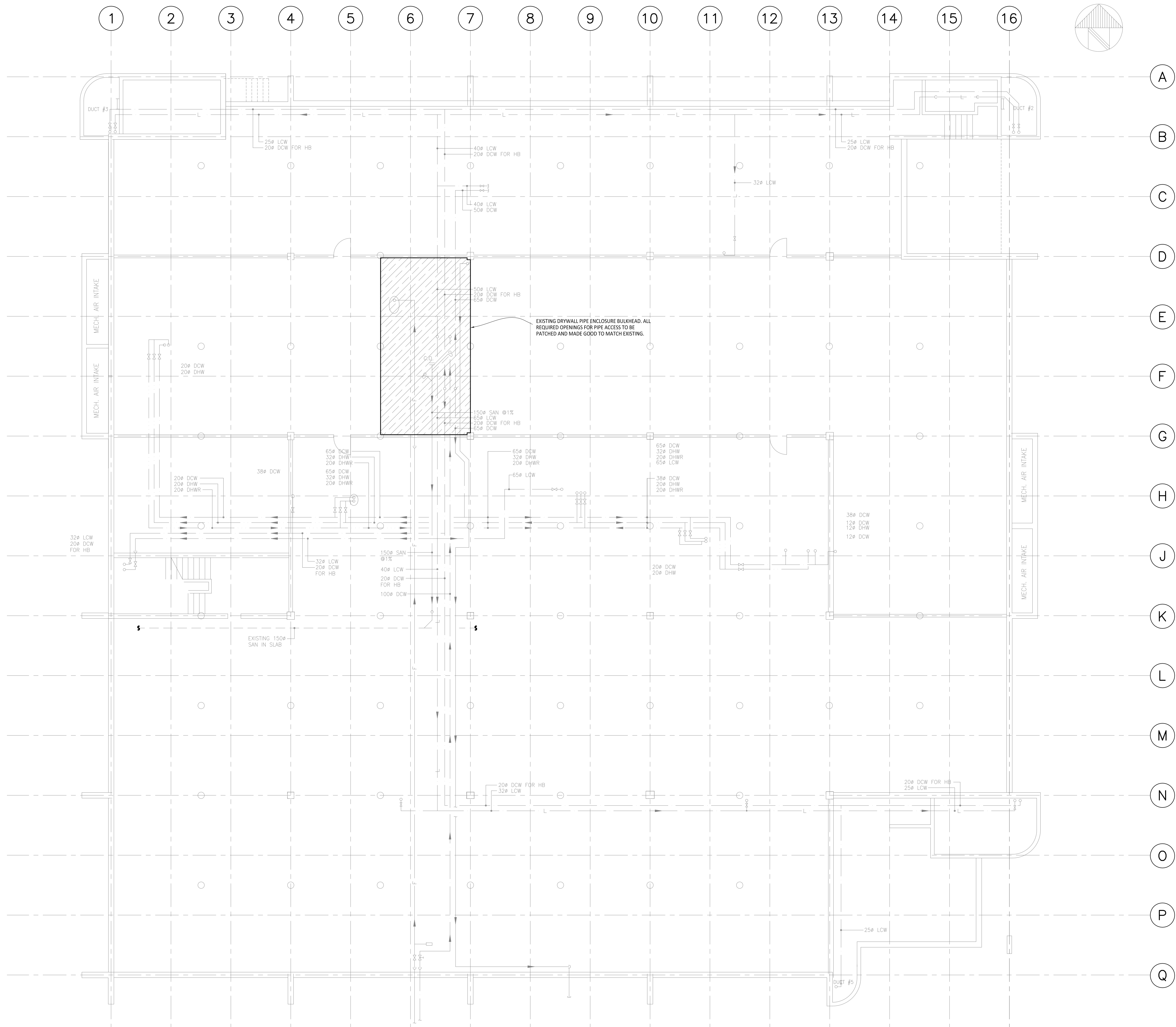
1 CRAWL SPACE - NEW PLAN SCALE: 1:100