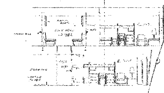
SECTION OF UPPER DECK