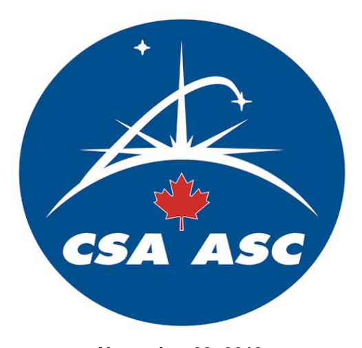
November 28, 2013