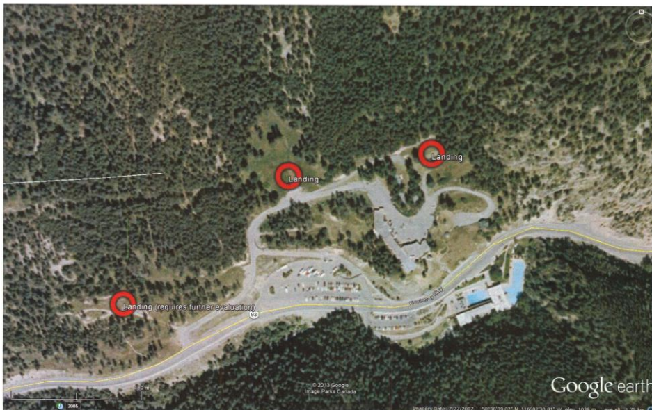
Figure 7. Designated landing/log deck locations within the project area.