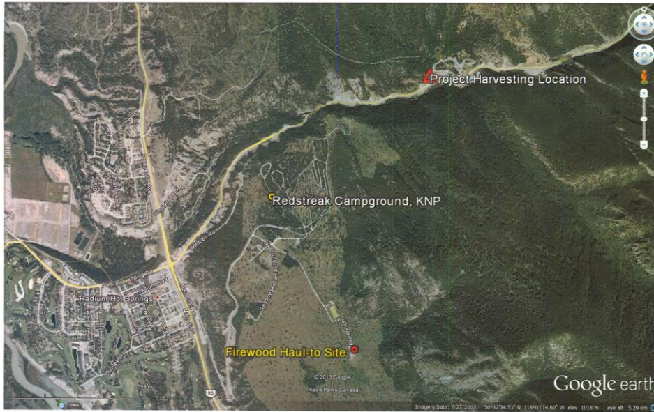
Figure 6. Firewood haul-to site, Redstreak Campground area, Kootenay National Park.