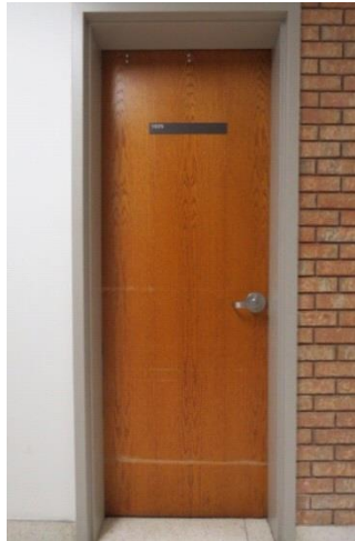
Example of Type D1