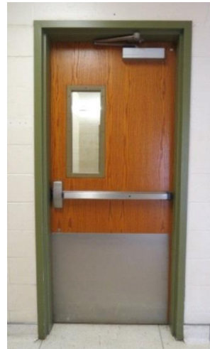
Example of Type D2

All doors, hardware, signage and accessories being replaced are to be retained by AAFC.