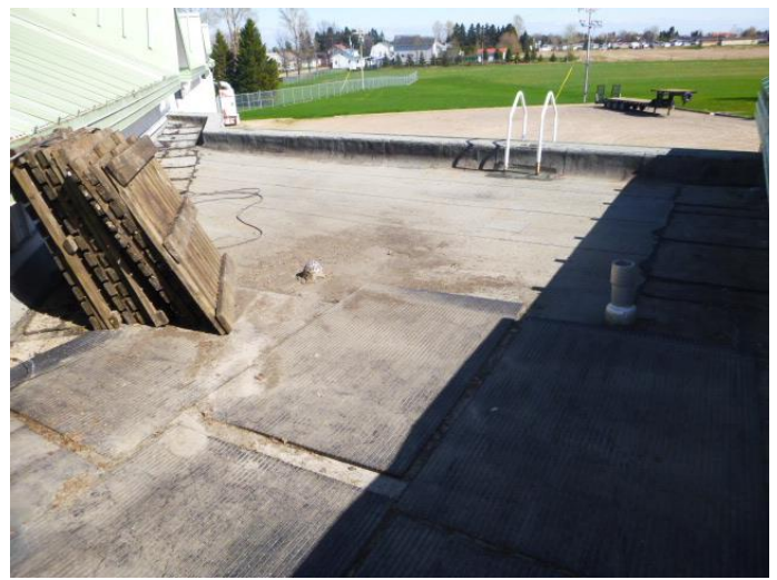
Flat roof rear view – East