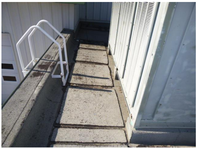
Flat roof rear view – East