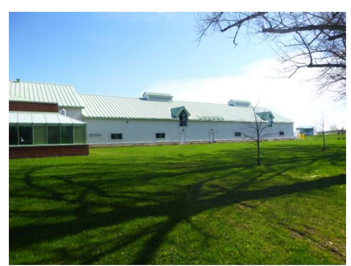
Front view – West