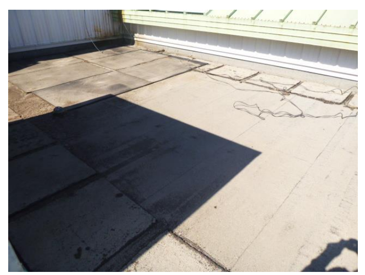
Flat roof rear view – East