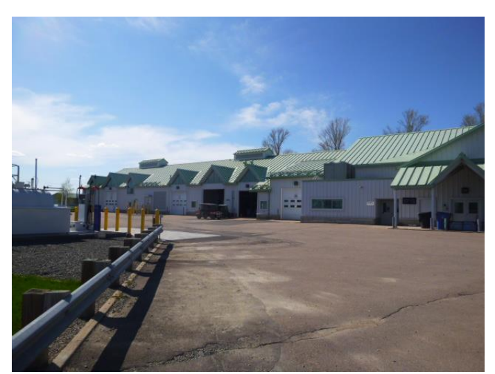
Rear view – West