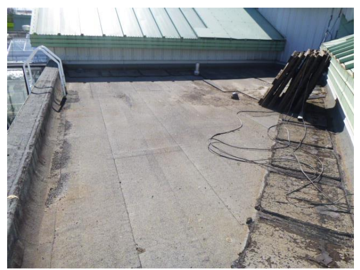
Flat roof rear view – East