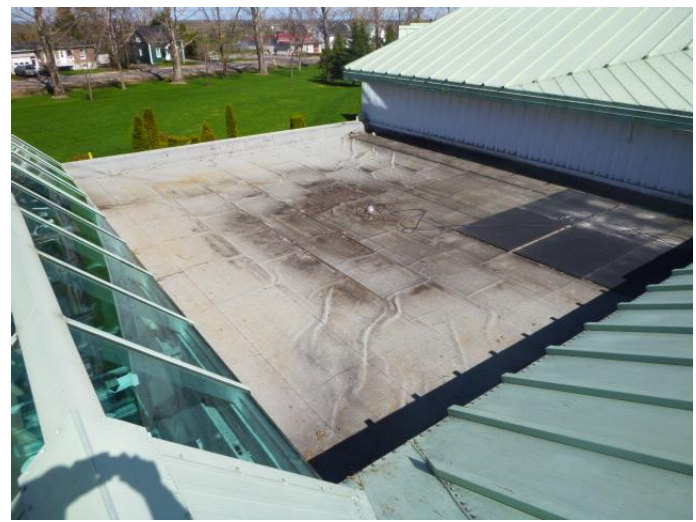
Flat roof front view – East