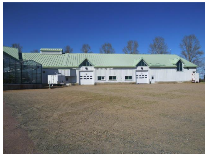
Rear view – East