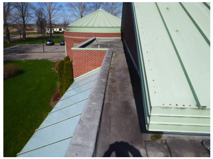
Flat roof front view – West