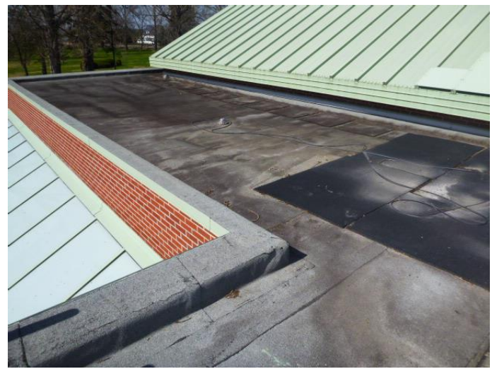
Flat roof front view – West