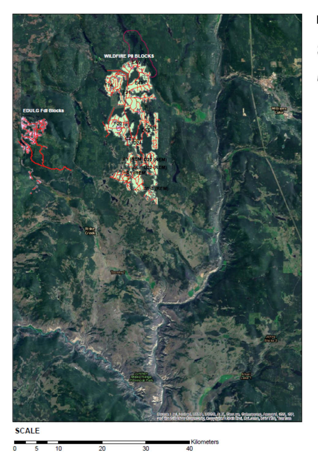
ANNEX "D" CMTA BLOCK AND LOCATION OVERVIEW MAP