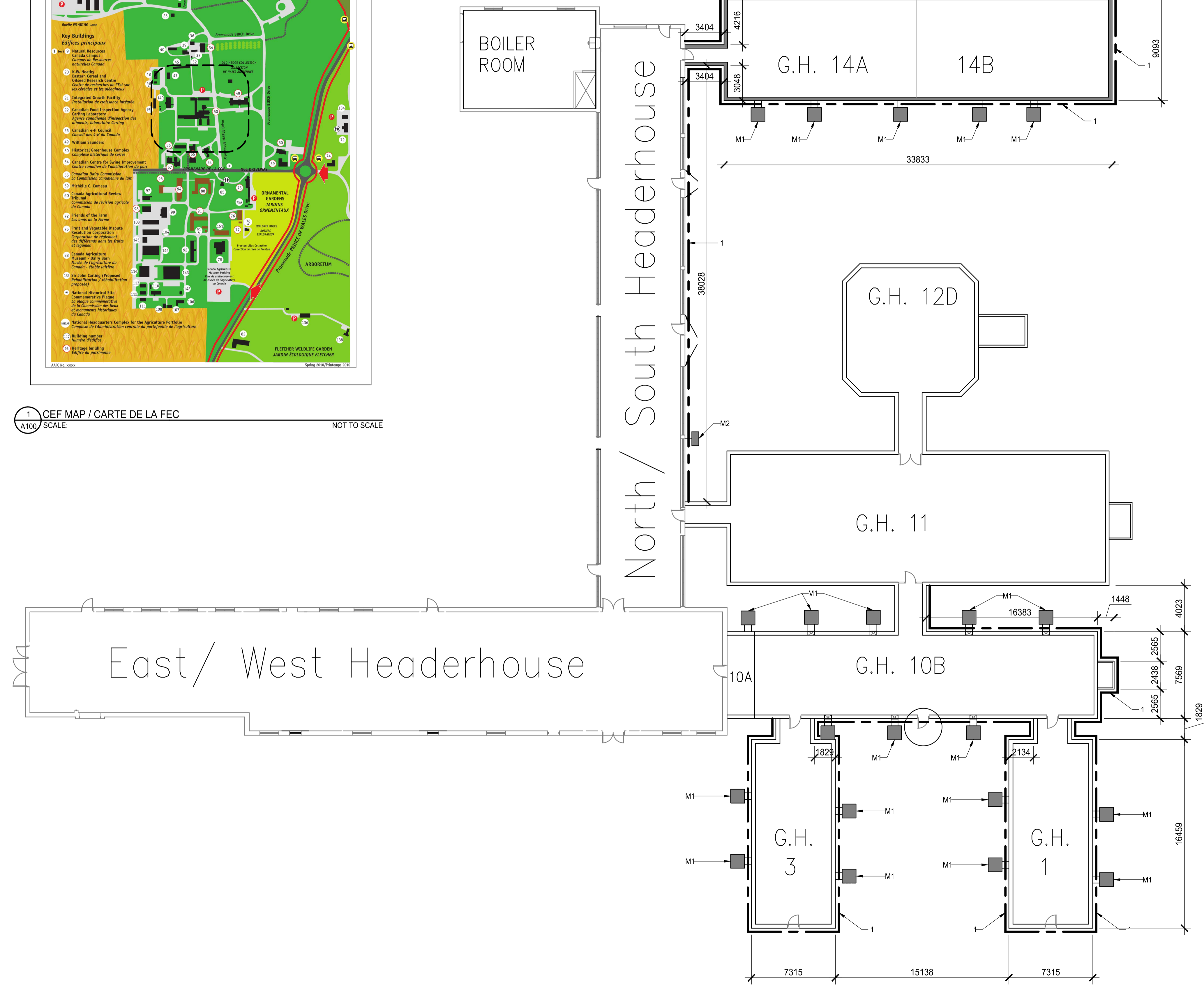
1 GROUND FLOOR PLAN / PLAN DÉTAGE DU REZ-DE-CHAUSÉE A100 SCALE: