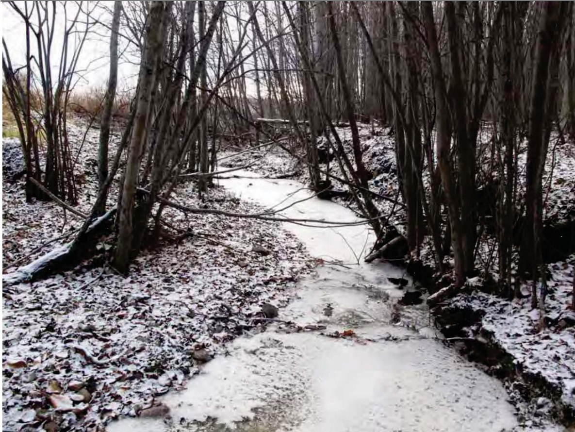
Figure 3: Downstream view of channel, approximately 200 m downstream of crossing location. Watercourse is entrenched but not incised.