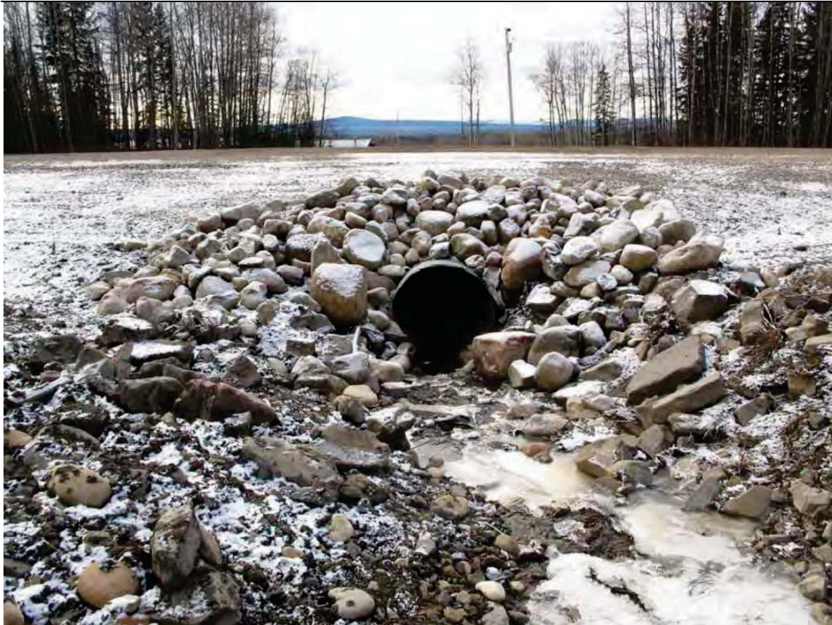
Figure 4: Inlet of culvert at Km 475 of the Alaska Highway, BC. This crossing site is approximately 19 km north of Fort Nelson

The following revisions are made to the specifications for this tender: