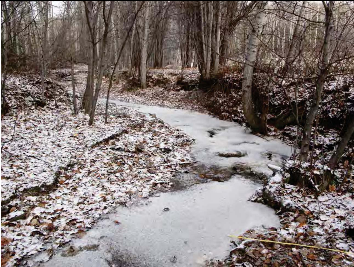
Figure 2: Upstream view of channel, approximately 200 m downstream of crossing location. Watercourse slope 2%.