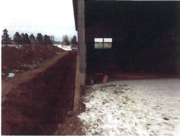
Vue latérale du mur endommagé End view of damaged wall