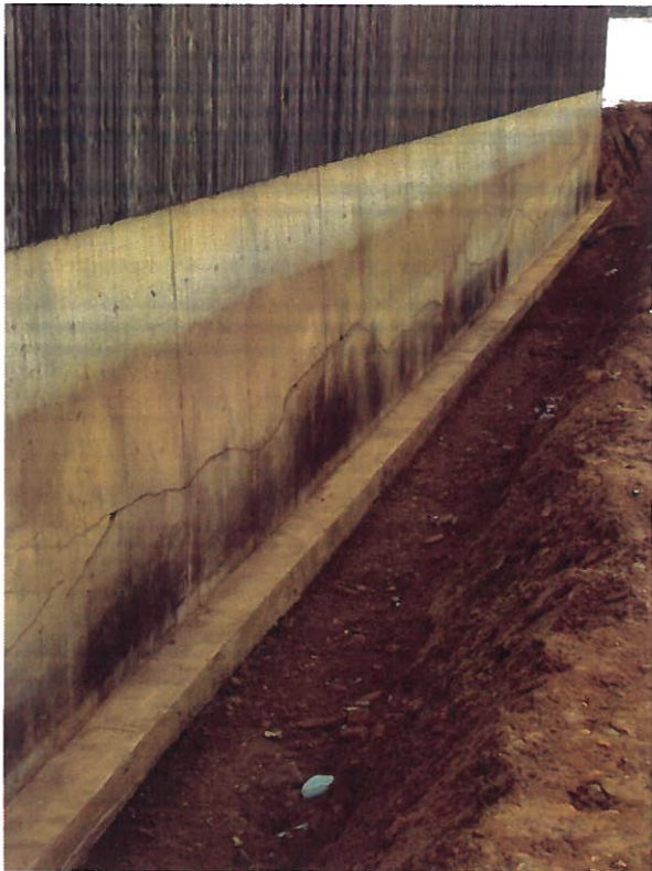
Fissure horizontale le long du mur extérieur Horizontal crack along the exterior of the wall