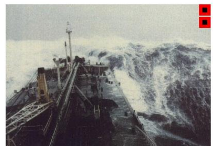
BEAUFORT FORCE 12 WIND SPEED: 64 KNOTS SEA: SEA COMPLETELY WHITE WITH DRIVING SPRAY, VISIBILITY VERY SERIOUSLY AFFECTED. THE AIR IS FILLED WITH FOAM AND SPRAY