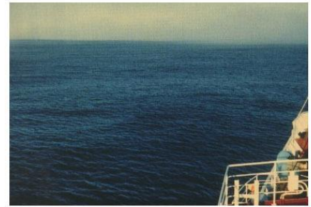
BEAUFORT FORCE 2 WIND SPEED: 4-6 KNOTS SEA: WAVE HEIGHT 2-3M (5-10FT), SMALL WAVELETS, CRESTS HAVE A GLASSY APPEARANCE AND DO NOT BREAK