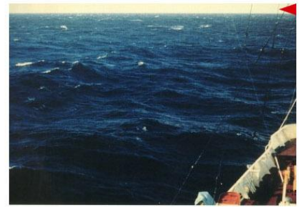
BEAUFORT FORCE 6 WIND SPEED: 22-27 KNOTS SEA: WAVE HEIGHT 3-4M (9.5-13 FT), LARGER WAVES BEGIN TO FORM, SPRAY IS PRESENT, WHITE FOAM CRESTS ARE EVERYWHERE