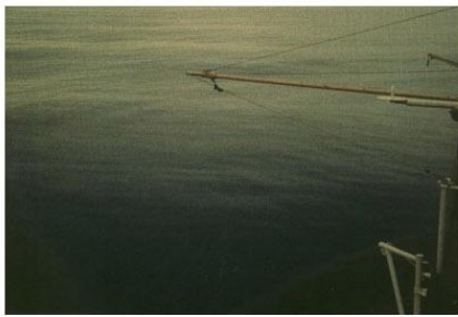
BEAUFORT FORCE 0 WIND SPEED: LESS THAN 1 KNOT SEA: SEA LIKE A MIRROR