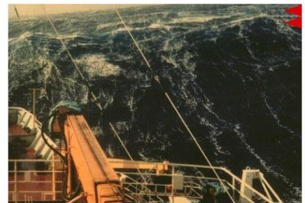
BEAUFORT FORCE 9 WIND SPEED: 41-47 KNOTS SEA: WAVE HEIGHT 7-10M (23-32FT), HIGH WAVES, DENSE STREAKS OF FOAM ALONG DIRECTION OF THE WIND, WAVE CRESTS BEGIN TO TOPPLE, TUMBLE, AND ROLL OVER. SPRAY MAY AFFECT VISIBILITY.