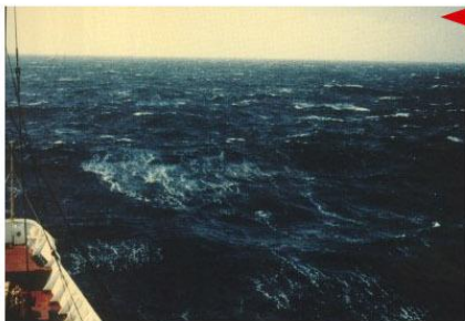
BEAUFORT FORCE 7 WIND SPEED: 28-33 KNOTS SEA: WAVE HEIGHT 4-5.5M (13.5-19 FT), SEA HEAPS UP, WHITE FOAM FROM BREAKING WAVES BEGINS TO BE BLOWN IN STREAKS ALONG THE WIND DIRECTION