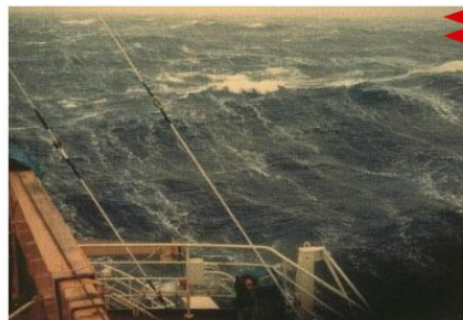
BEAUFORT FORCE 8 WIND SPEED: 34-40 KNOTS SEA: WAVE HEIGHT 5.5-7.5M (18-25FT), MODERATELY HIGH WAVES OF GREATER LENGTH, EDGES OF CREST BEGIN TO BREAK INTO THE SPINDRIFT, FOAM BLOWN IN WELL MARKED STREAKS ALONG WIND DIRECTION.