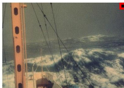
BEAUFORT FORCE 11 WIND SPEED: 56-63 KNOTS SEA: WAVE HEIGHT 11.5-16M (37-52FT), EXCEPTIONALLY HIGH WAVES, SMALL-MEDIUM SIZED SHIPS MAY BE LOST TO VIEW BEHIND THE WAVES. SEA COMPLETELY COVERED WITH LONG WHITE PATCHES OF FOAM LYING ALONG WIND DIRECTION. EVERYWHERE, THE EDGES OF WAVE CRESTS ARE BLOWN INTO FROTH.