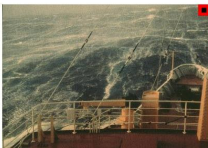
BEAUFORT FORCE 10 WIND SPEED: 48-55 KNOTS SEA: WAVE HEIGHT 9-12.5M (29-41FT), VERY HIGH WAVES WITH LONG OVERHANGING CRESTS, THE RESULTING FOAM, IN GREAT PATCHES, IS BLOWN IN DENSE WHITE STREAKS ALONG WIND DIRECTION. ON THE WHOLE, SEA SURFACE TAKES A WHITE APPEARANCE, TUMBLING OF THE SEA IS HEAVY AND SHOCK-LIKE, VISIBILITY AFFECTED.