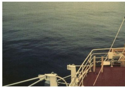
BEAUFORT FORCE 1 WIND SPEED: 1-3 KNOTS SEA: WAVE HEIGHT 1M (25FT), RIPPLES WITH THE APPEARANCE OF SCALES, BUT WITHOUT FOAM CRESTS