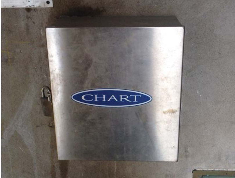
Tank filling box located outside loading dock