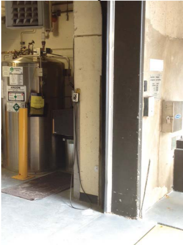
location of tank inside loading dock in relation to exterior tank filling box