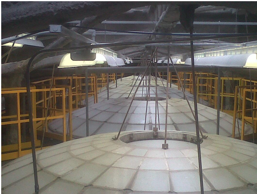
Image 1: Kitchen and dining room catwalks on opposite side of kitchen ceiling hatch

Across the catwalks, three grey terra cotta mortar samples were collected from the ceiling as well as three white plaster coat samples from the sloped exterior wall directly to the right of image 1's point of view.