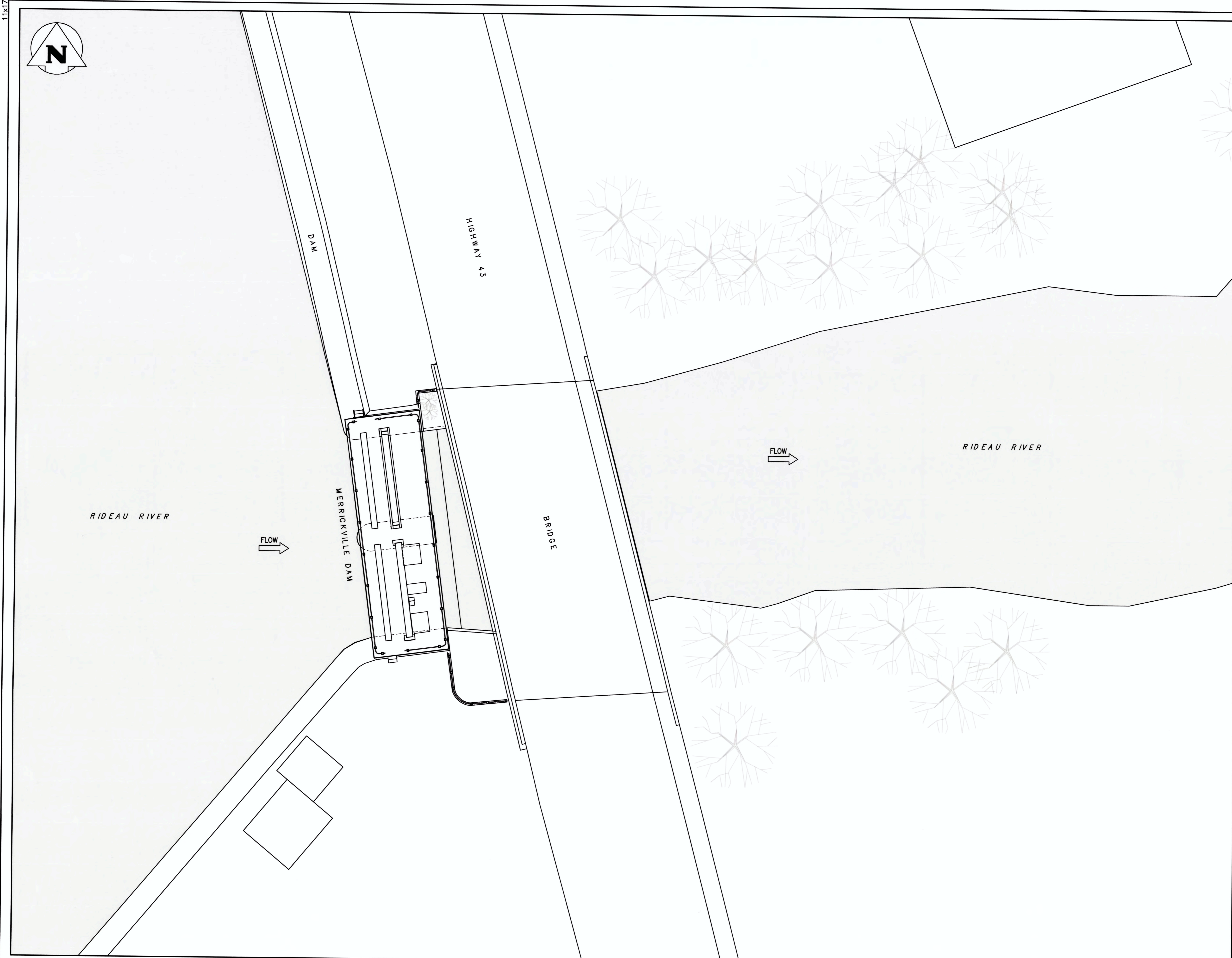
D S05 GENERAL ARRANGEMENT PLAN SCALE: 1:150

File Name: P:\Projects\2014\14-1538-003\dwg\tracut\ISSUED FOR TENDER\DWG\14-1538-003_S01-Rev_0.dwg - Tab: S01 Plotted By: J.Cortis 15/07/22 [Wed 3:48pm] 11x17" PLOT SCALE: 1"=2'