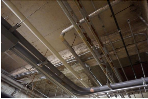
Photo 1 – Existing damaged concrete encased steel beams at expansion joint (south side of expansion joint)