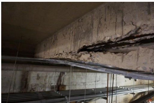
Photo 5 – Existing damaged concrete encased steel beam at expansion joint (south side of expansion joint)