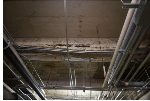
Photo 2 – Existing damaged concrete encased steel beams at expansion joint (south side of expansion joint)