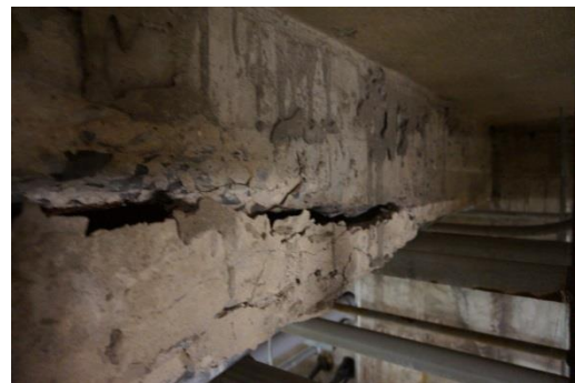
Photo 6 – Existing damaged concrete encased steel beam at expansion joint (south side of expansion joint)