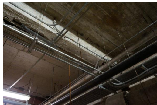
Photo 4 – Existing damaged concrete encased steel beams at expansion joint (north side of expansion joint)