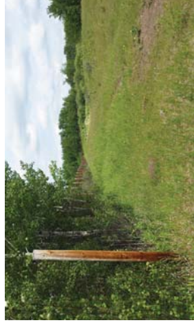
TREES ALONG PROPERTY LINE