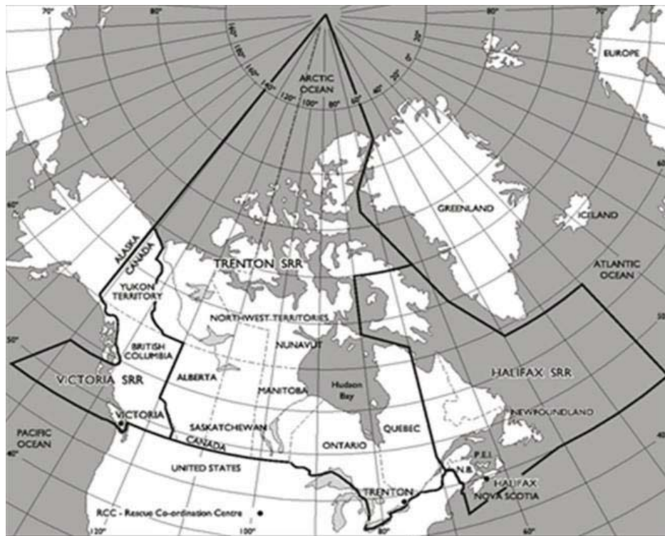
Figure 2 - Canada's SAR AOR