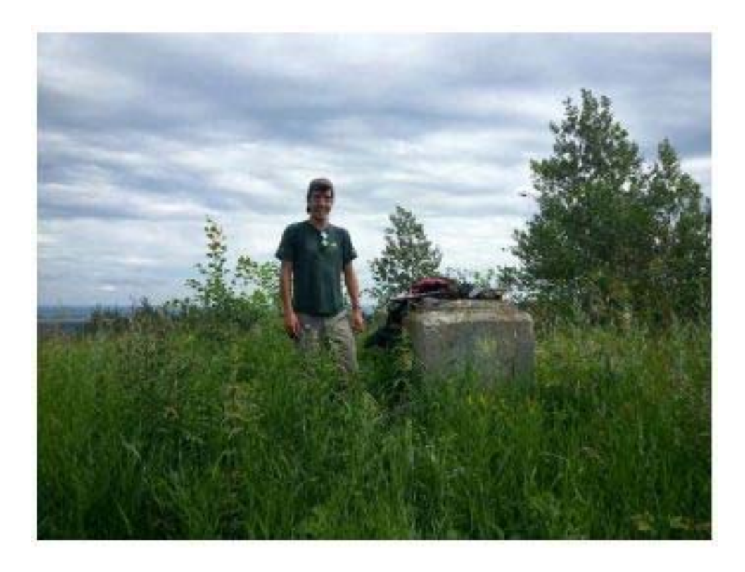
SOW Annex 1 – Lift Tower Concrete Blocks