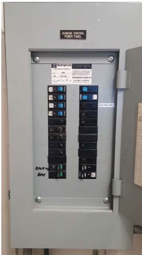
Photograph 3c ↑ Panelboard for East Gate Electrical