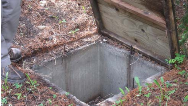
Photograph 1b ↑ Existing Septic Tank Manhole (Typical)