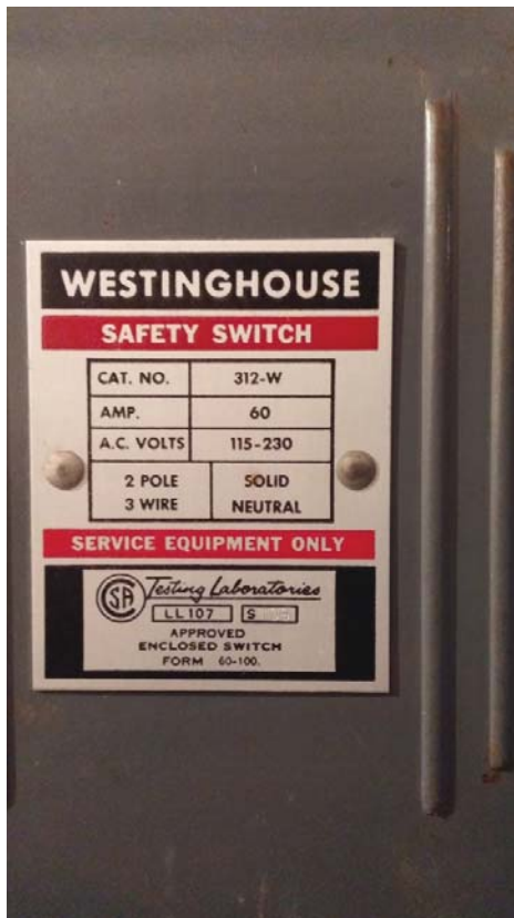
Photograph 5c ↑ Disconnect for New Installation