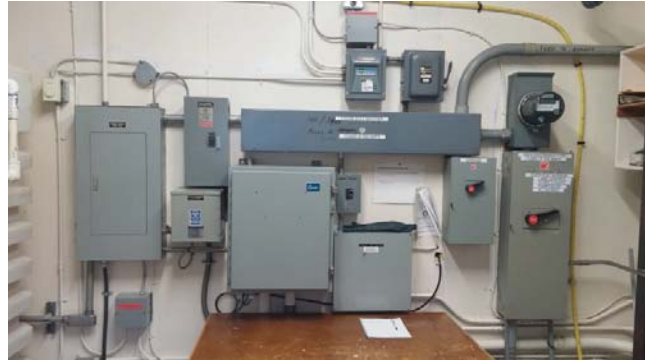
Photograph 2c ↑ Electrical Equipment for East Gate (Incl. Septic Pumps)