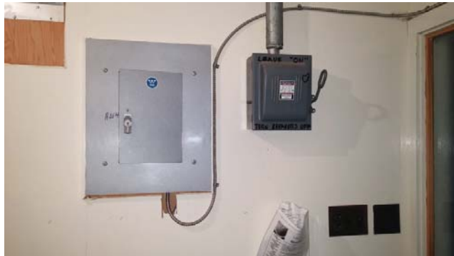
Photograph 1c ↑ Electrical Equipment for New Installation