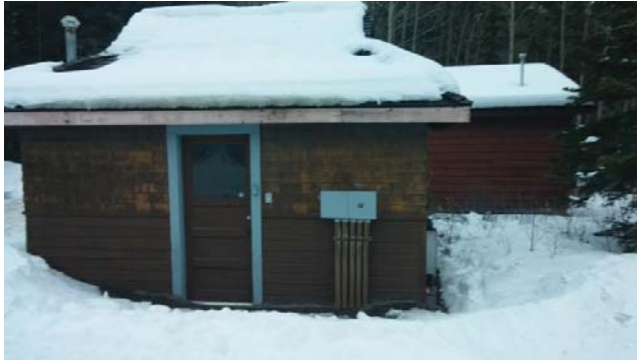
Photograph 1c ↑ Building Housing East Gate Electrical Equipment