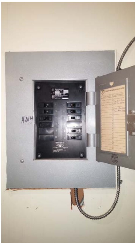
Photograph 3c ↑ Panelboard for New Installation