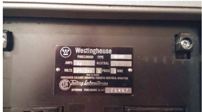
Photograph 2c ↑ Panelboard for New Installation