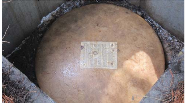
Photograph 2b ↑ Existing Septic Tank (Typical)