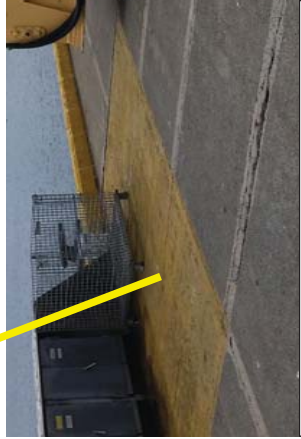
Typical Painting around Kiosk. (Yellow)