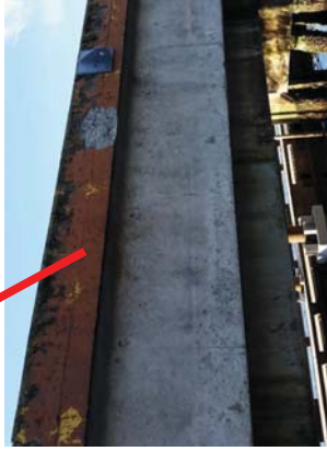
Typical Painting along outside of Bull Rail. (Red)