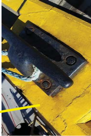
Typical Painting around Cleat. (Yellow)