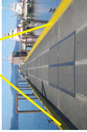
Typical Painting along surface and interior of Bull Rail. (Yellow)