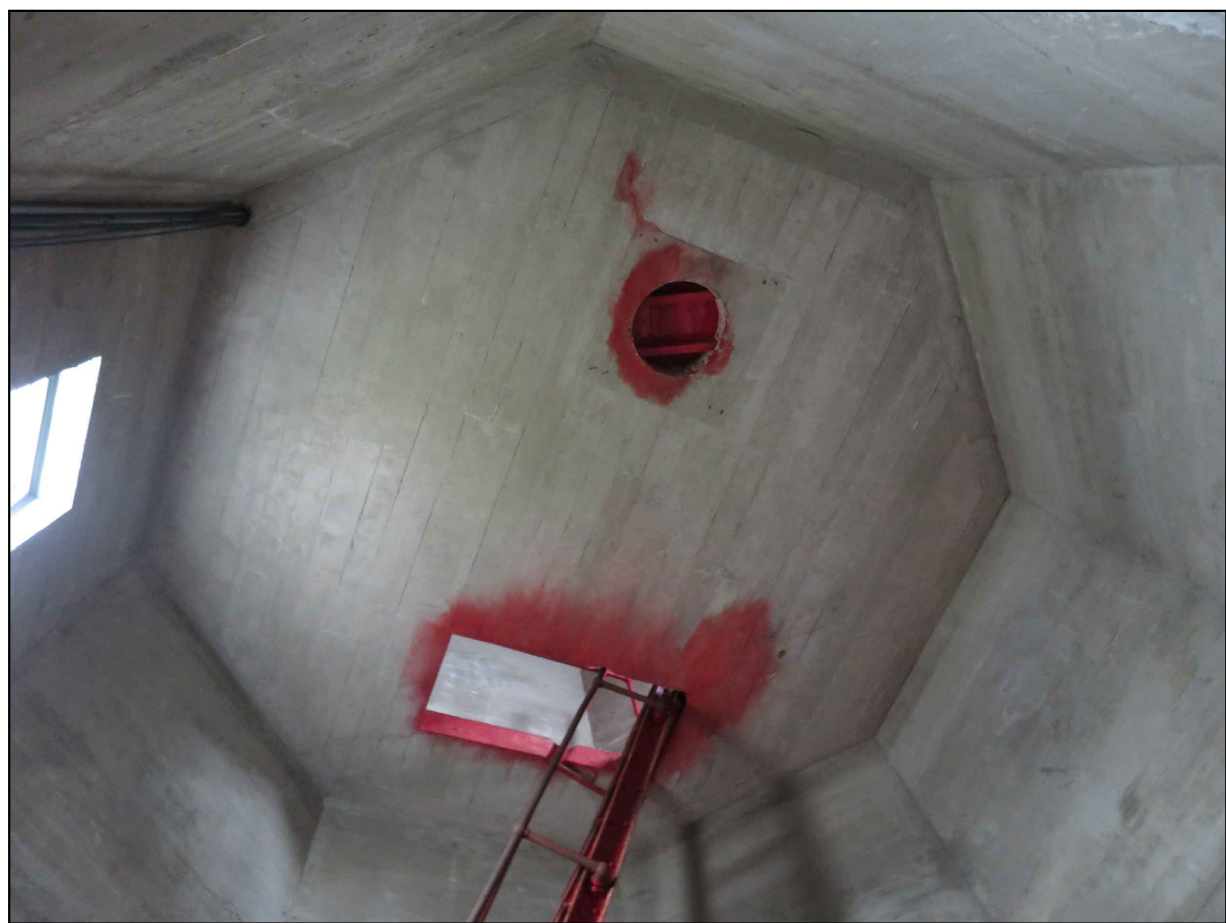
IMAGE 04: REMOVE OVER-SPRAYED PAINT ON UNDERSIDE OF FLOOR SLABS (TYPICAL).