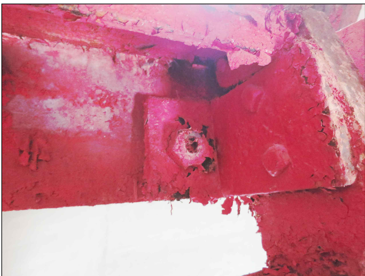
IMAGE 02: BRACKET AT TOP OF LADDERS 1, 2 & 3 TO BE REPLACED. REFER TO DETAIL 2/Ab500