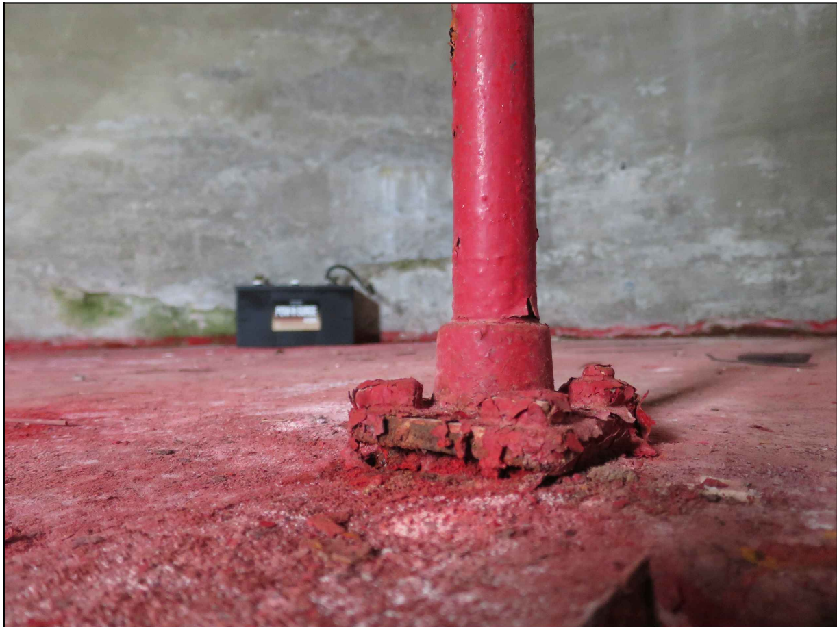
IMAGE 03: DETAIL VIEW OF EXISTING RAILING BOOT TO BE REPLACED. REFER TO DETAIL 7/Ab502