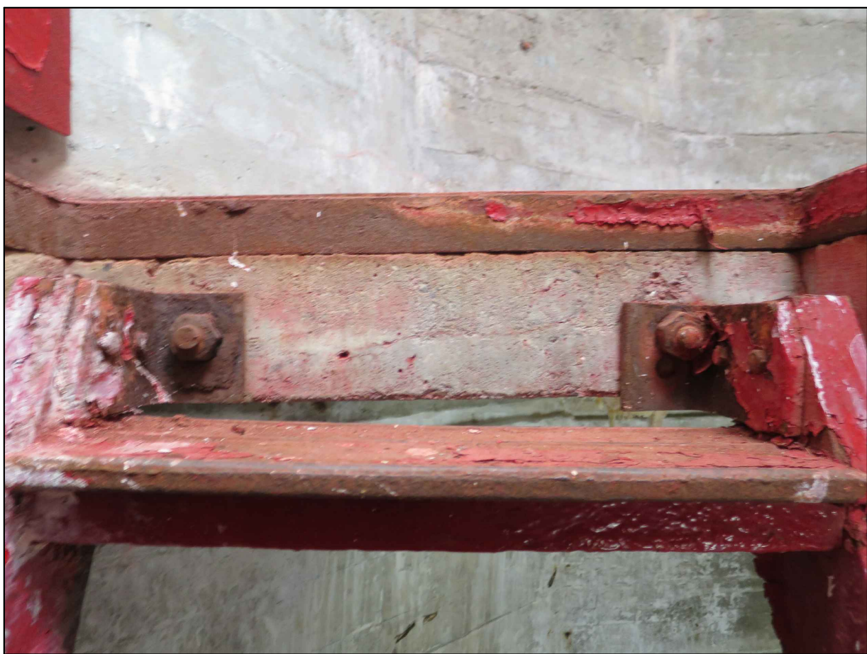
IMAGE 01: BRACKET AT TOP OF LADDERS 4 & 5 TO BE REPLACED. REFER TO DETAIL 3/Ab500