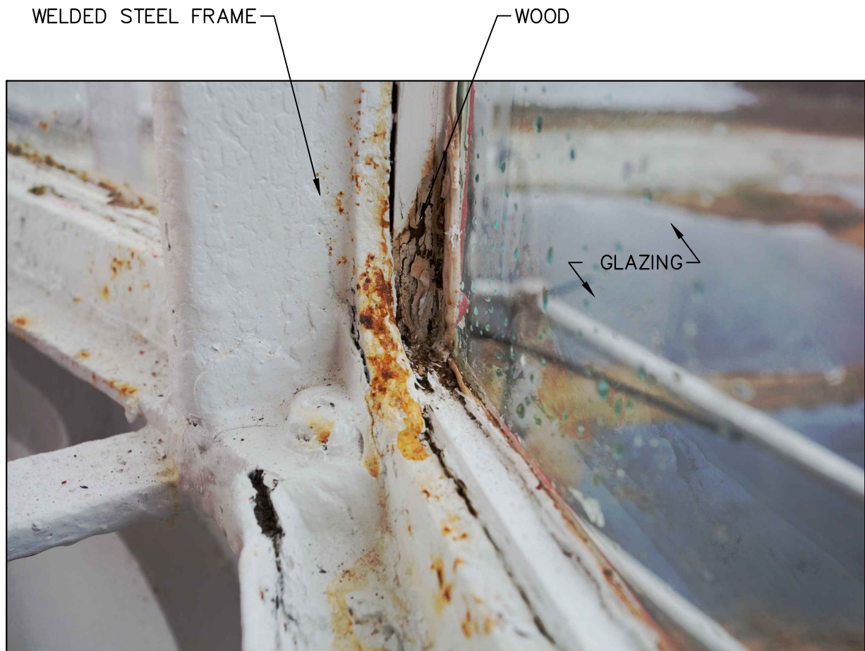
IMAGE 05: DETAIL VIEW OF LANTERN WINDOW ASSEMBLY (INTERIOR). REFER TO DETAIL 4/Ab501