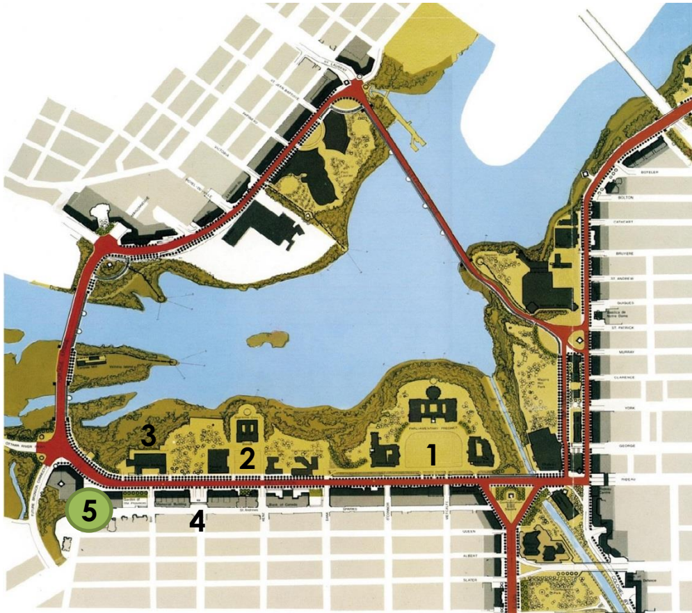
Plan of Confederation Boulevard