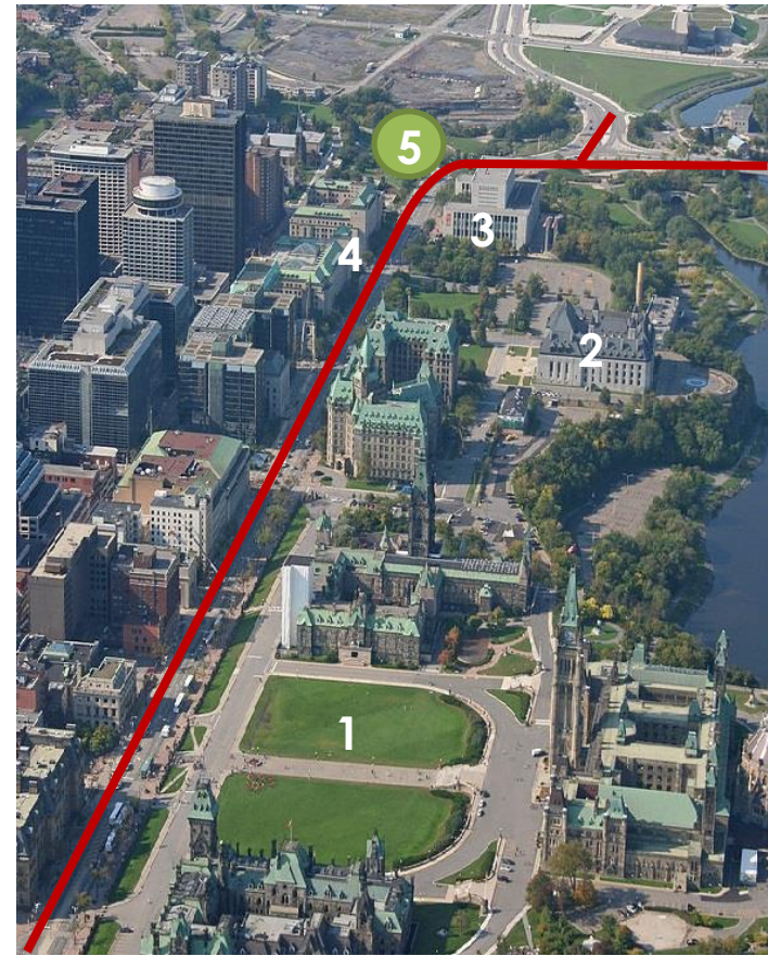
Confederation Boulevard