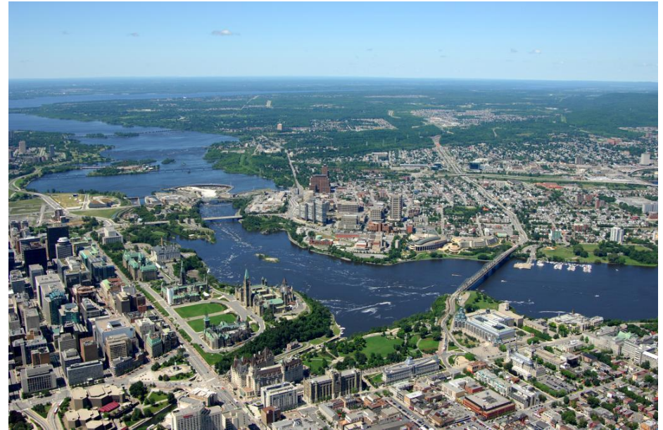
Bird's-eye view of Canada's Capital core area

Confederation Boulevard is the Capital's ceremonial route linking many of the national attractions and symbols through a unified and distinctive aesthetic approach. This discovery route is located within the Capital's core area, and encircles the downtown areas of the cities of Ottawa and Gatineau on both sides of the river. The Memorial site is situated on Confederation Boulevard west of the Parliamentary and Judicial Precincts. This prominent location will ensure visibility by thousands of visitors and residents in the core area of Canada's Capital.