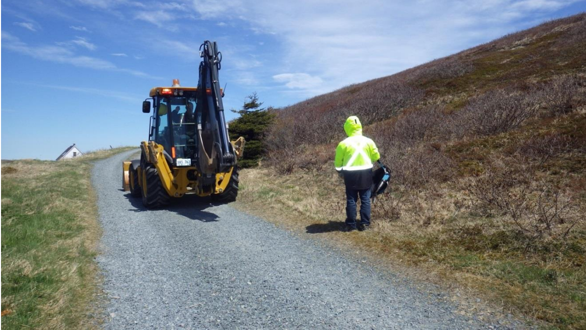
Photo 5 Location and context of Test Pit 9 (Suboperation 5A10C) prior to excavation.