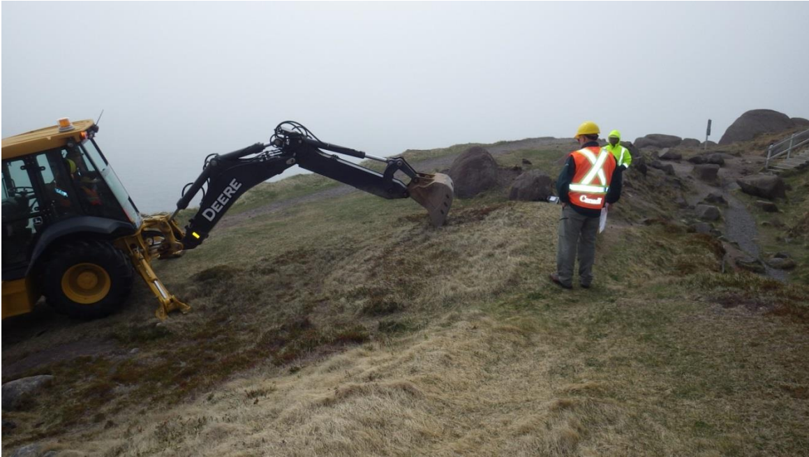
Photo 15 Location and context of Test Pit 14 (Suboperation 5A10G) prior to excavation.