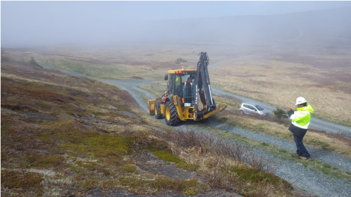
Photo 1 Location and context of Test Pit 7 (Suboperation 5A10A) prior to excavation.

Test Pit 7 (Suboperation 5A10A) was situated in proximity to the 1835 Cape Spear lighthouse, and had potential to contain evidence of the construction and/or occupation of the lighthouse (Photo 1). Excavation revealed 5-7 cm of sod/rootmat with loose, black-brown silty sand with gravel, and alder roots present in the top of the layer (Photo 2). This shallow topsoil was underlain by bedrock. No cultural features or artifacts were identified.