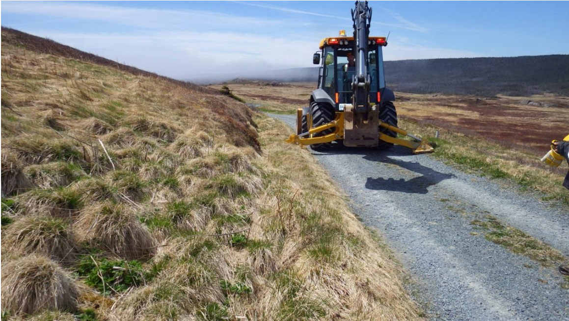
Photo 9 Location and context of Test Pit 10 (Suboperation 5A10D) prior to excavation.