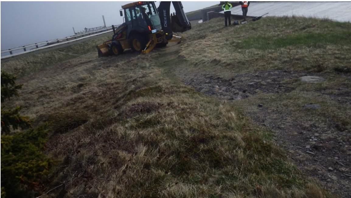
Photo 11 Location and context of Test Pit 12 (Suboperation 5A10E) prior to excavation.