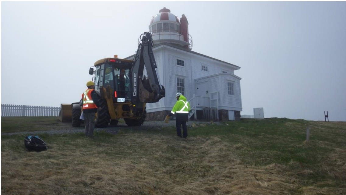
Photo 3 Location and context of Test Pit 8 (Suboperation 5A10B) prior to excavation.

Test pit 8 (Suboperation 5A10B) was also situated near the 1835 lighthouse, beside the pathway leading to the structure (Photo 3). Excavation below the sod/rootmat revealed 10 cm of crushed stone underlain by 20 cm of gravelly brown silty sand fill (Photo 4). Beneath this lay a black organic buried sod or peat 15-17 cm thick resting on bedrock. This buried sod layer yielded two small (thumbnail-sized) brick fragments. No other cultural features or artifacts were identified.