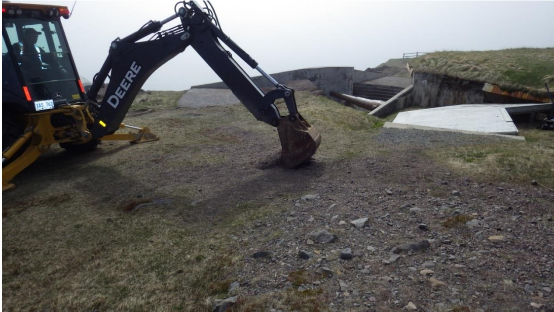
Photo 13 Location and context of Test Pit 13 (Suboperation 5A10F) prior to excavation.