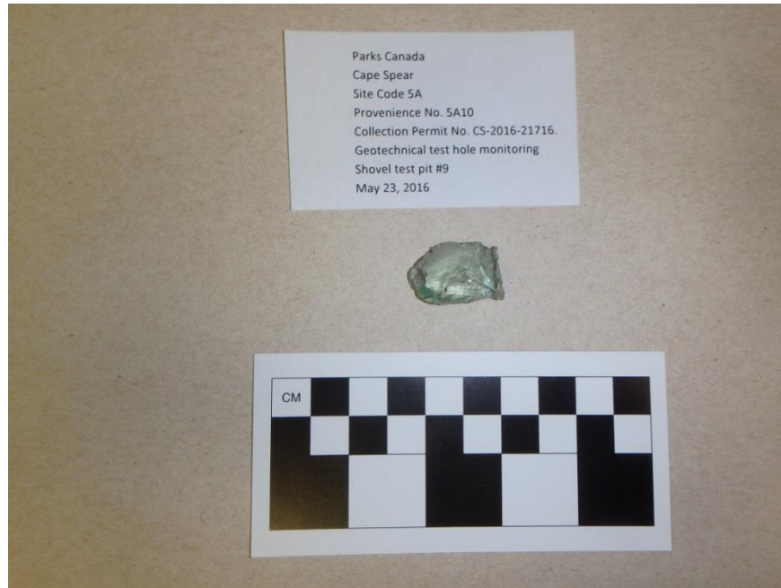
Photo 7 Sherd of container glass from Test Pit 9 (Suboperation 5A10C).