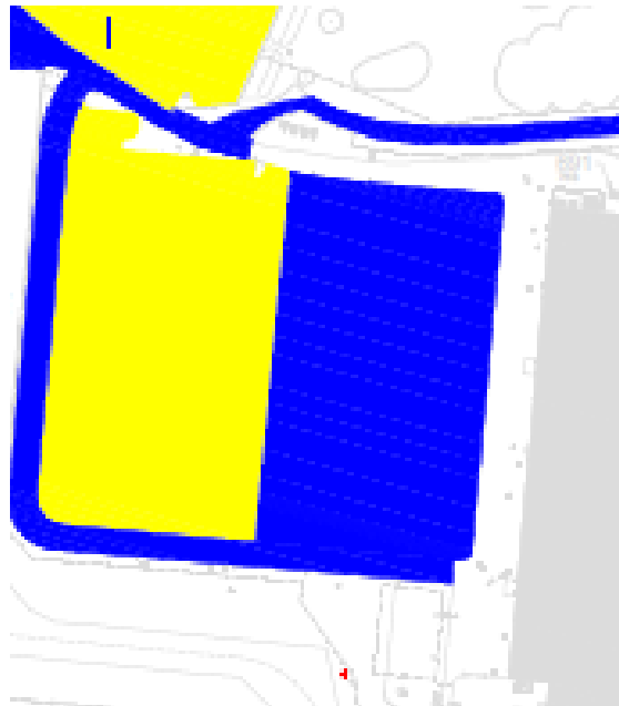
NORTH SIDE AREA #2