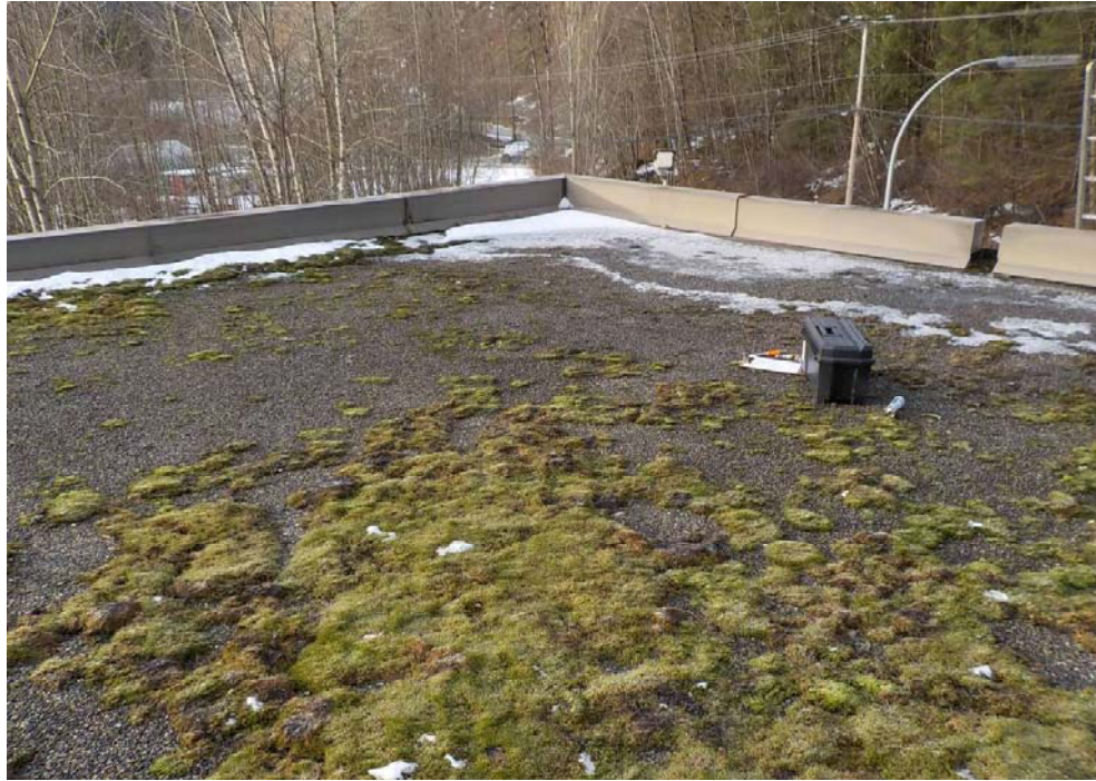
Photograph 1: Power House roof looking southwest from the northeast corner.