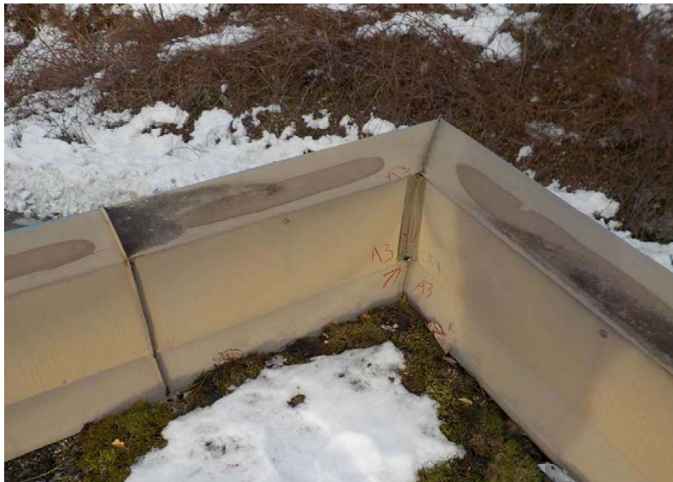
Photograph 5: Factory painted flashing and A3 (mastic) sample location.