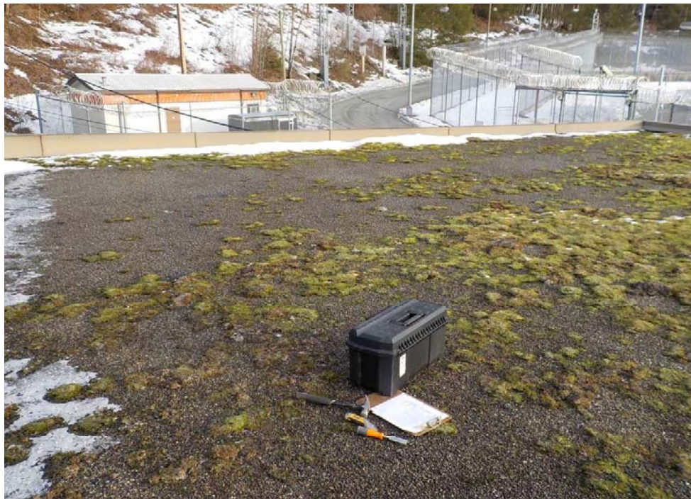
Photograph 3: Power House roof looking northeast from the southwest corner.