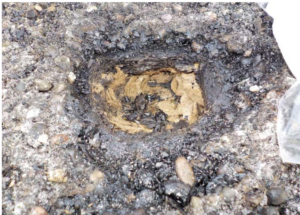
Photograph 4: Roof layers at sample location A2.