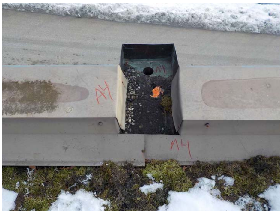
Photograph 6: A4 (roof tar) sample location.