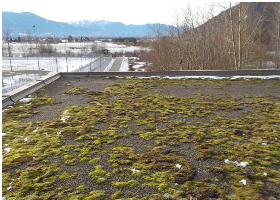
Photograph 2: Power House roof looking south from the northeast corner.