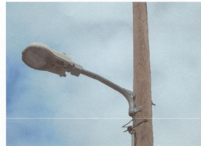
TYPICAL EXISTING LIGHT FIXTURE ON WOOD POLE