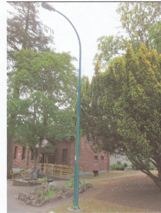
TYPICAL METAL POLE TO BE REPLACED