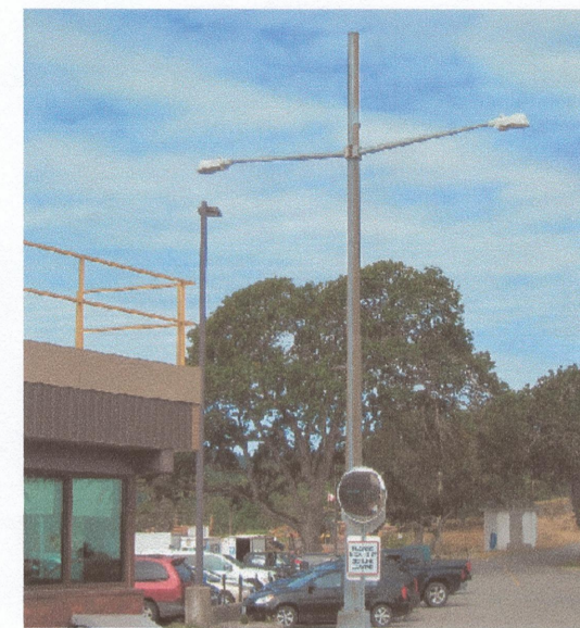
EXISTING POLE F7