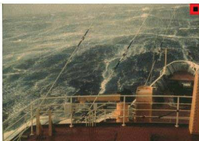
BEAUFORT FORCE 10 WIND SPEED: 48-55 KNOTS SEA: WAVE HEIGHT 9-12.5M (29-41FT), VERY HIGH WAVES WITH LONG OVERHANGING CRESTS, THE RESULTING FOAM, IN GREAT PATCHES, IS BLOWN IN DENSE WHITE STREAKS ALONG WIND DIRECTION, ON THE WHOLE, SEA SURFACE TAKES A WHITE APPEARANCE, TUMBLING OF THE SEA IS HEAVY AND SHOCK-LIKE, VISIBILITY AFFECTED.