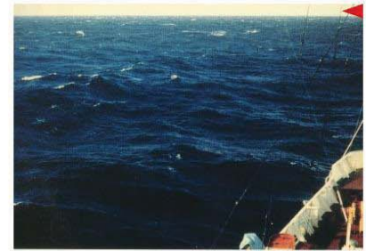
BEAUFORT FORCE 6 WIND SPEED: 22-27 KNOTS SEA: WAVE HEIGHT 3-4M (9.5-13 FT), LARGER WAVES BEGIN TO FORM, SPRAY IS PRESENT, WHITE FOAM CRESTS ARE EVERYWHERE