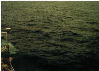
BEAUFORT FORCE 4 WIND SPEED: 11-16 KNOTS SEA: WAVE HEIGHT 1-1.5M (3.5-5FT), SMALL WAVES BECOMING LONGER, FAIRLY FREQUENT WHITE HORSES