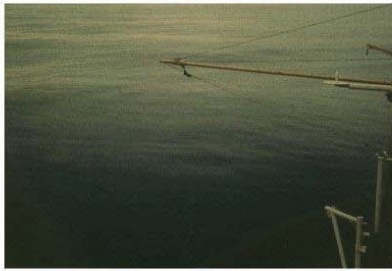
BEAUFORT FORCE 0 WIND SPEED: LESS THAN 1 KNOT SEA: SEA LIKE A MIRROR