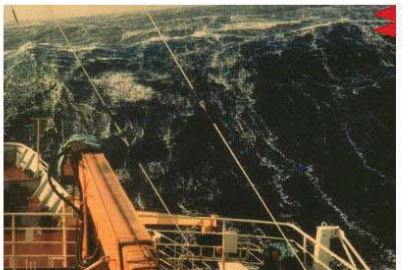
BEAUFORT FORCE 9 WIND SPEED: 41-47 KNOTS SEA: WAVE HEIGHT 7-10M (23-32FT), HIGH WAVES, DENSE STREAKS OF FOAM ALONG DIRECTION OF THE WIND, WAVE CRESTS BEGIN TO TOPPLE, TUMBLE, AND ROLL OVER, SPRAY MAY AFFECT VISIBILITY.