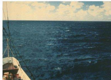
BEAUFORT FORCE 5 WIND SPEED: 17-21 KNOTS SEA: WAVE HEIGHT 2-2.5M (6-8FT), MODERATE WAVES TAKING MORE PRONOUNCED LONG FORM, MANY WHITE HORSES, CHANCE OF SOME SPRAY