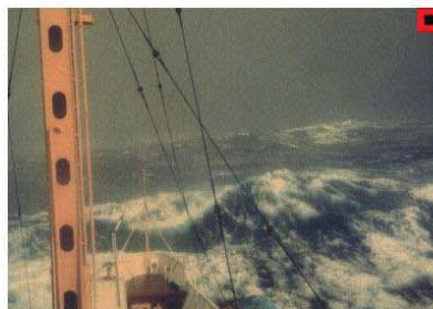
BEAUFORT FORCE 11 WIND SPEED: 56-63 KNOTS SEA: WAVE HEIGHT 11.5-16M (37-52FT), EXCEPTIONALLY HIGH WAVES, SMALL-MEDIUM SIZED SHIPS MAY BE LOST TO VIEW BEHIND THE WAVES, SEA COMPLETELY COVERED WITH LONG WHITE PATCHES OF FOAM LYING ALONG WIND DIRECTION, EVERYWHERE, THE EDGES OF WAVE CRESTS ARE BLOWN INTO FROTH.