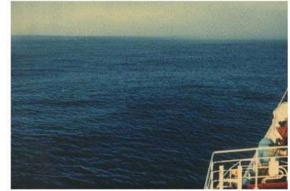
BEAUFORT FORCE 2 WIND SPEED: 4-6 KNOTS SEA: WAVE HEIGHT 2-3M (5-10FT), SMALL WAVELETS, CRESTS HAVE A GLASSY APPEARANCE AND DO NOT BREAK