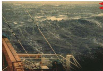
BEAUFORT FORCE 8 WIND SPEED: 34-40 KNOTS SEA: WAVE HEIGHT 5.5-7.5M (18-25FT), MODERATELY HIGH WAVES OF GREATER LENGTH, EDGES OF CREST BEGIN TO BREAK INTO THE SPINDRIFT, FOAM BLOWN IN WELL MARKED STREAKS ALONG WIND DIRECTION.