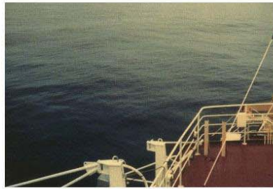
BEAUFORT FORCE 1 WIND SPEED: 1-3 KNOTS SEA: WAVE HEIGHT 1M (25FT), RIPPLES WITH THE APPEARANCE OF SCALES, BUT WITHOUT FOAM CRESTS