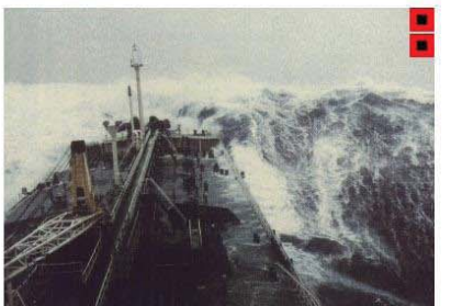
BEAUFORT FORCE 12 WIND SPEED: 64 KNOTS SEA: SEA COMPLETELY WHITE WITH DRIVING SPRAY, VISIBILITY VERY SERIOUSLY AFFECTED, THE AIR IS FILLED WITH FOAM AND SPRAY