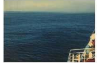
BEAUFORT FORCE 2 WIND SPEED: 4-6 KNOTS SEA: WAVE HEIGHT 2-3M (6.5-10 FT). SMALL WAVELETS. CRESTS HAVE A GLASSY APPEARANCE AND DO NOT BREAK