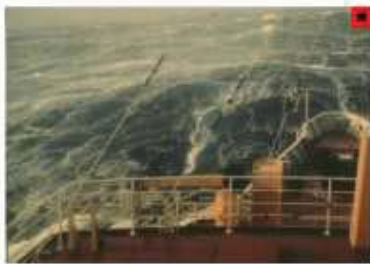
BEAUFORT FORCE 9 WIND SPEED: 48-55 KNOTS SEA: WAVE HEIGHT 25-30M (82.0-98.4 FT). VERY HIGH WAVES WITH LONG OVERHANGING CRESTS. THE RESULTING FOAM, IN GREAT PATCHES, IS BLOWN IN DENSE WHITE STREAKS ALONG WIND DIRECTION. ON THE WHOLE, SEA SURFACE TAKES A WHITE APPEARANCE. TUMBLING OF THE SEA IS HEAVY AND SHOCKLIKE. VISIBILITY AFFECTED