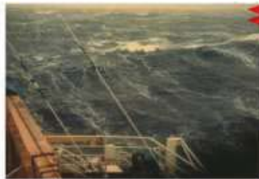
BEAUFORT FORCE 7 WIND SPEED: 34-40 KNOTS SEA: WAVE HEIGHT 15-20M (49.2-65.6 FT). MODERATELY HIGH WAVES OF GREATER LENGTH. EDGES OF CRESTS BEGIN TO BREAK INTO THE SPINDRIFT. FOAM BLOWN IN WELL MARKED STREAKS ALONG WIND DIRECTION