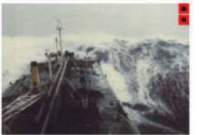
BEAUFORT FORCE 11 WIND SPEED: 64 KNOTS SEA: SEA COMPLETELY WHITE WITH DRIVING SPRAY. VISIBILITY VERY SERIOUSLY AFFECTED. THE AIR IS FILLED WITH FOAM AND SPRAY