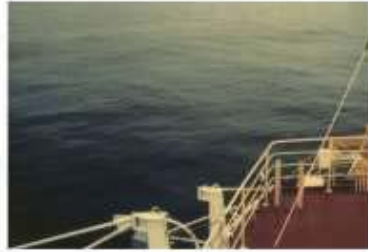
BEAUFORT FORCE 1 WIND SPEED: 1-3 KNOTS SEA: WAVE HEIGHT 1M (3.3FT). RIPPLES WITH THE APPEARANCE OF SCALES, BUT WITHOUT FOAM CRESTS