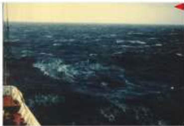
BEAUFORT FORCE 6 WIND SPEED: 24-30 KNOTS SEA: WAVE HEIGHT 10-14M (32.8-45.9 FT). SEA HEAPS UP. WHITE FOAM FROM BREAKING WAVES BEGINS TO BE BLOWN IN STREAKS ALONG THE WIND DIRECTION