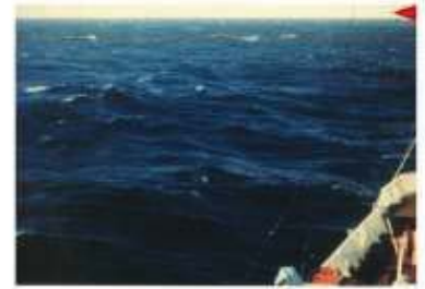
BEAUFORT FORCE 5 WIND SPEED: 18-23 KNOTS SEA: WAVE HEIGHT 7-9M (22.9-29.5 FT). LARGER WAVES BEGIN TO FORM. SPRAY IS PRESENT. WHITE FOAM CRESTS ARE EVERYWHERE