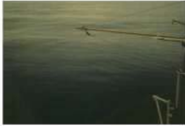
BEAUFORT FORCE 0 WIND SPEED: LESS THAN 1 KNOT SEA: SEA LIKE A MIRROR