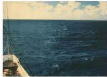
BEAUFORT FORCE 4 WIND SPEED: 13-17 KNOTS SEA: WAVE HEIGHT 5-6M (16.4-19.7 FT). MODERATE WAVES TAKING MORE PRONOUNCED LONG FORM. MANY WHITE HORSES. CHANGE OF SOME SPRAY