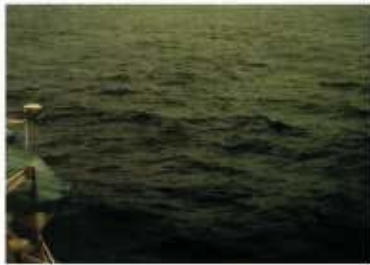
BEAUFORT FORCE 3 WIND SPEED: 7-10 KNOTS SEA: WAVE HEIGHT 3-4M (9.8-13.1 FT). SMALL WAVES BECOMING LONGER. FAIRLY FREQUENT WHITE HORSES