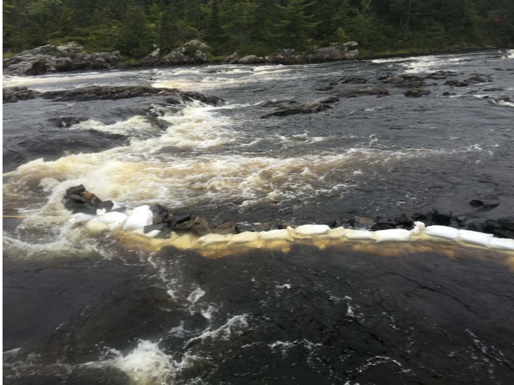
2016 – September