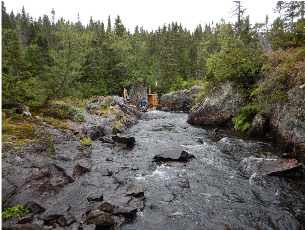
2016 – September