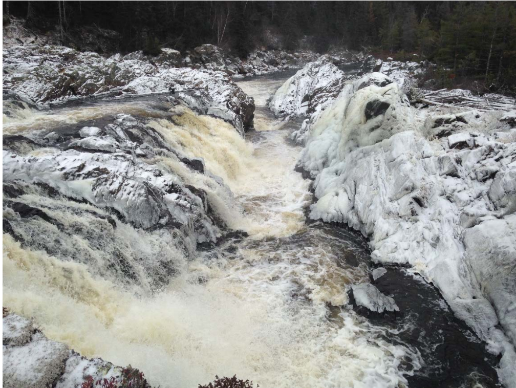
2015 – December