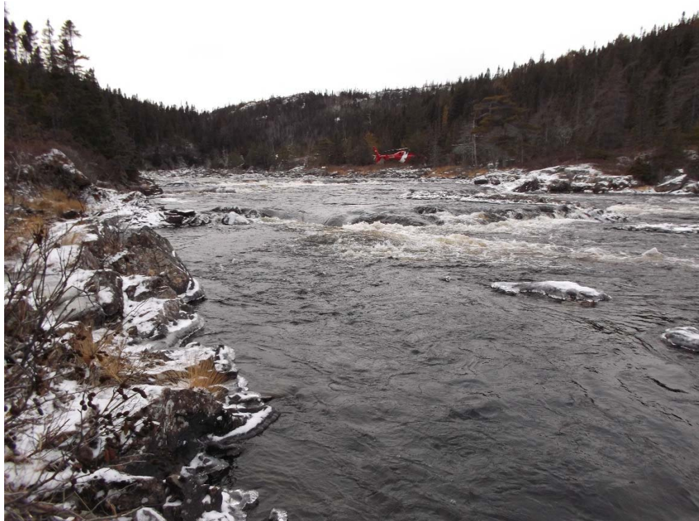
2015 – December