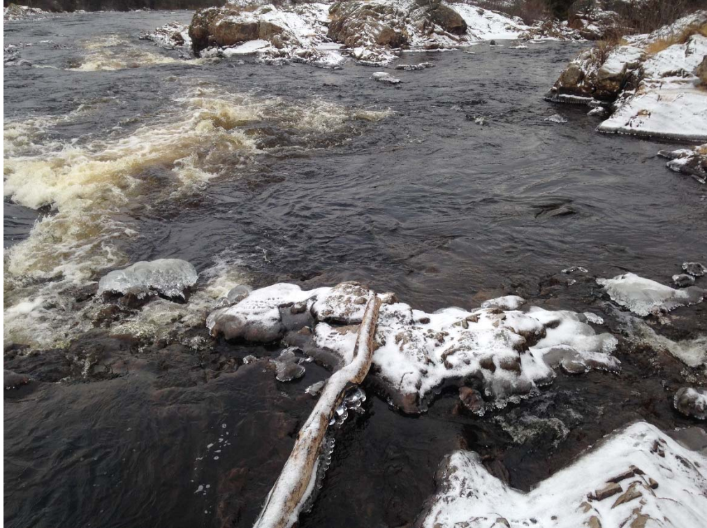
2015 – December