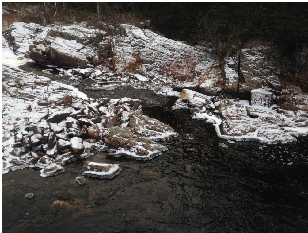
2015 – December