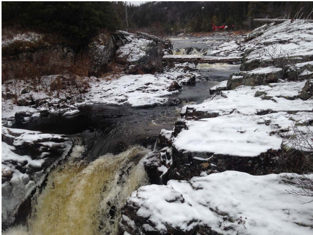
2015 – December