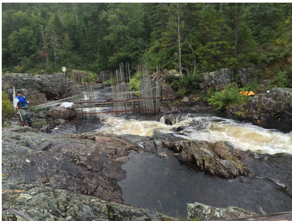
2016 – September