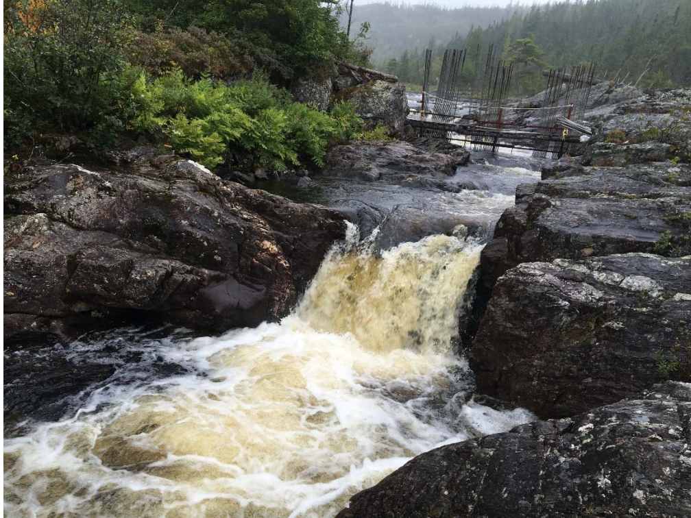
2016 – September