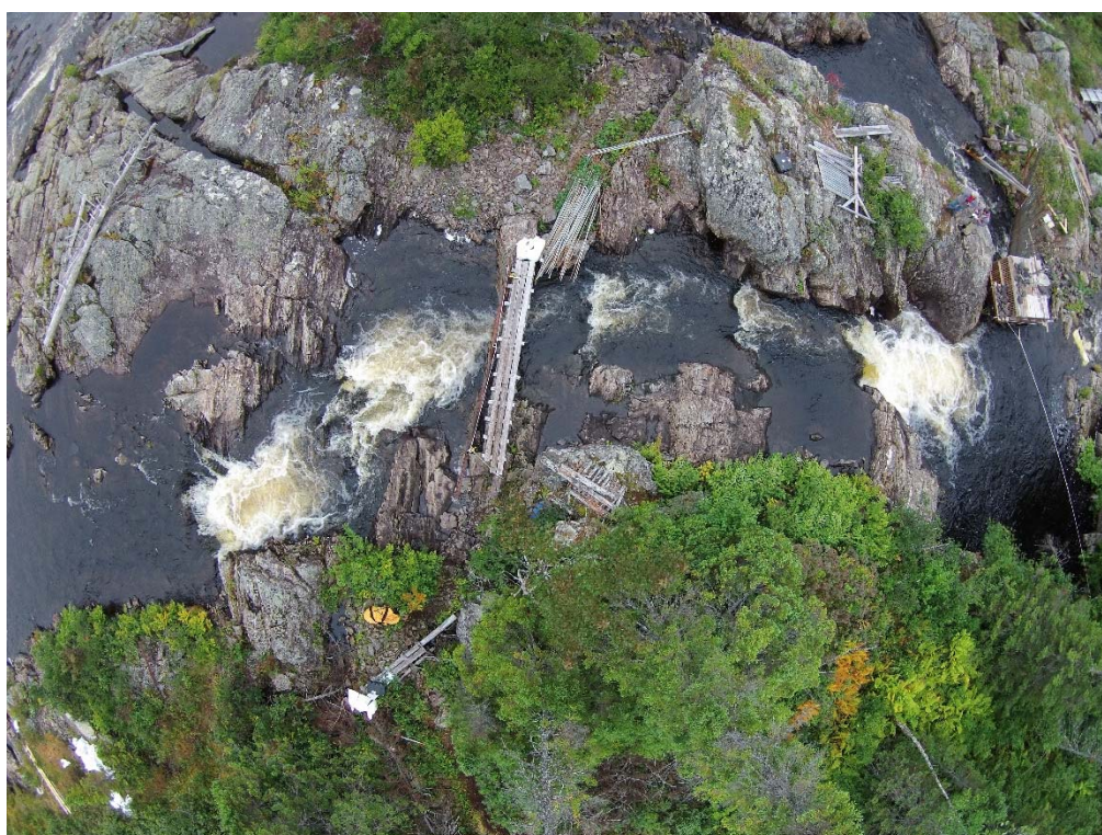
2016 – September