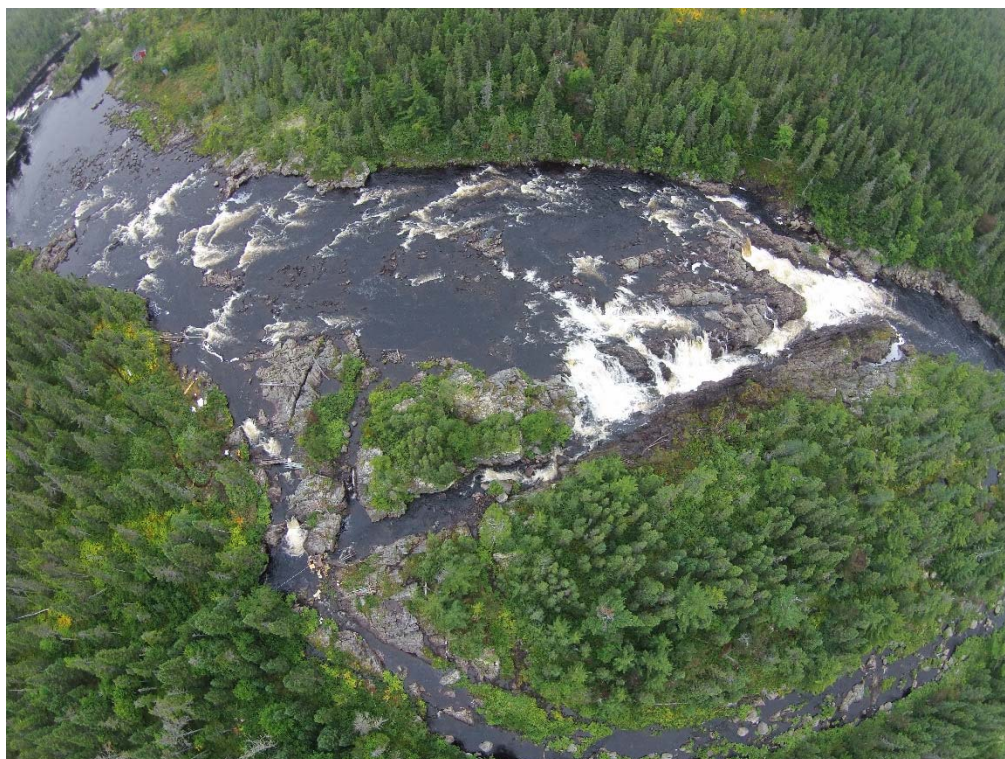
2016 – September