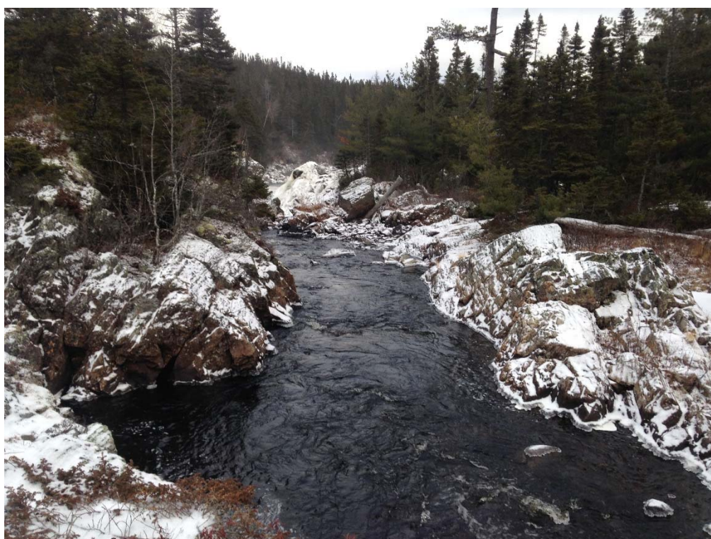
2015 – December