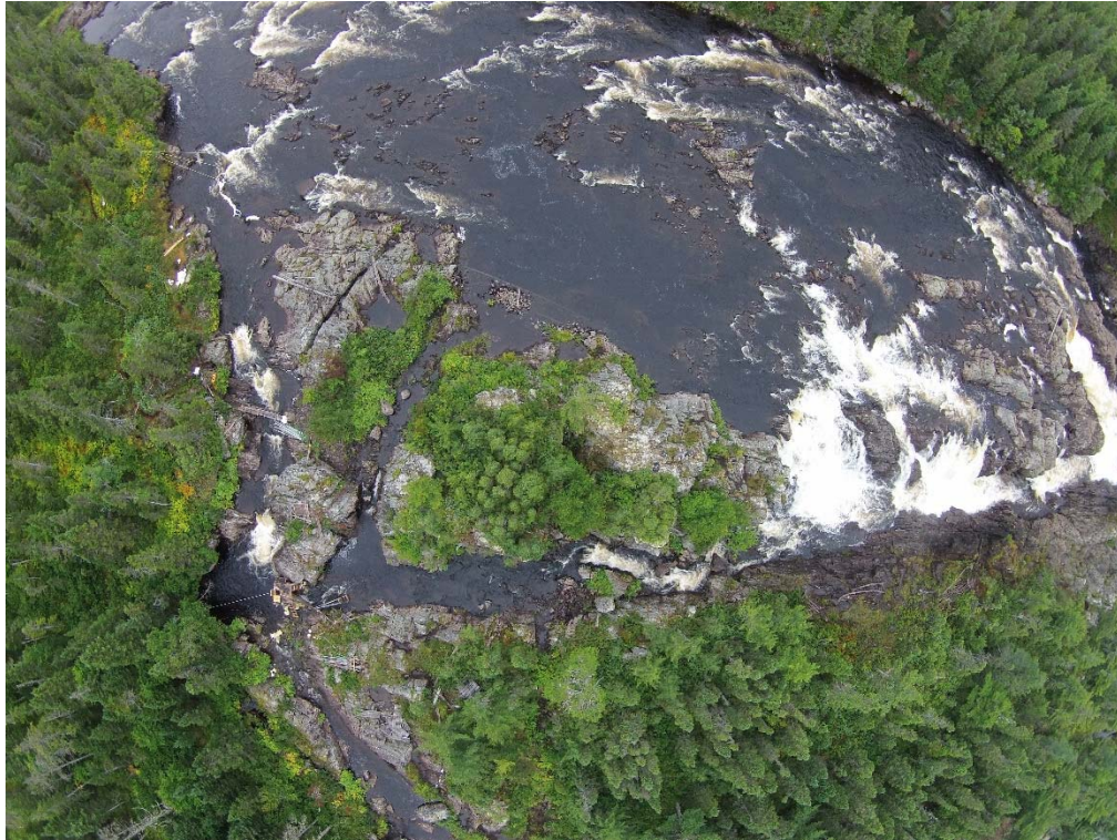
2016 – September