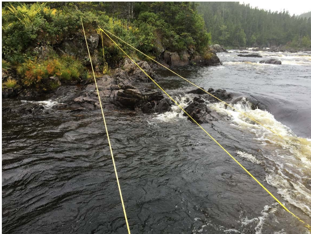
2016 – September