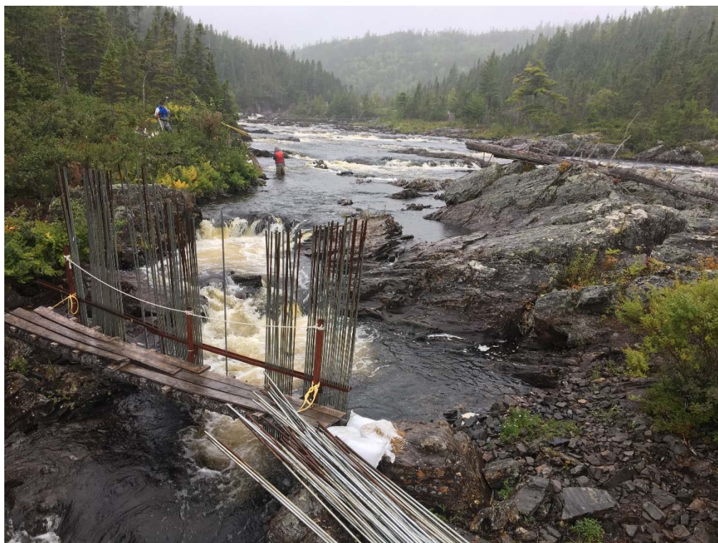
2016 – September