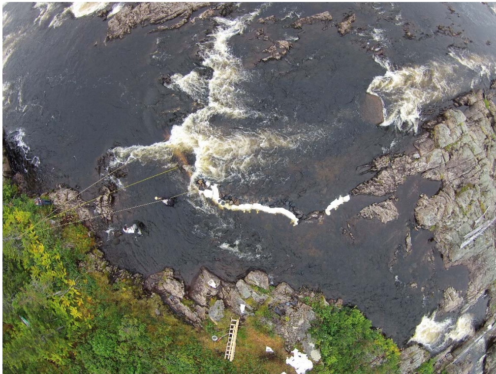
2016 – September