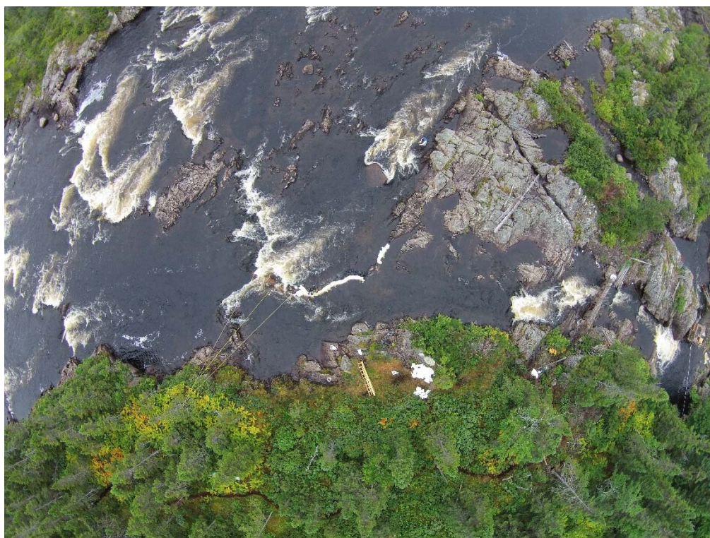
2016 – September