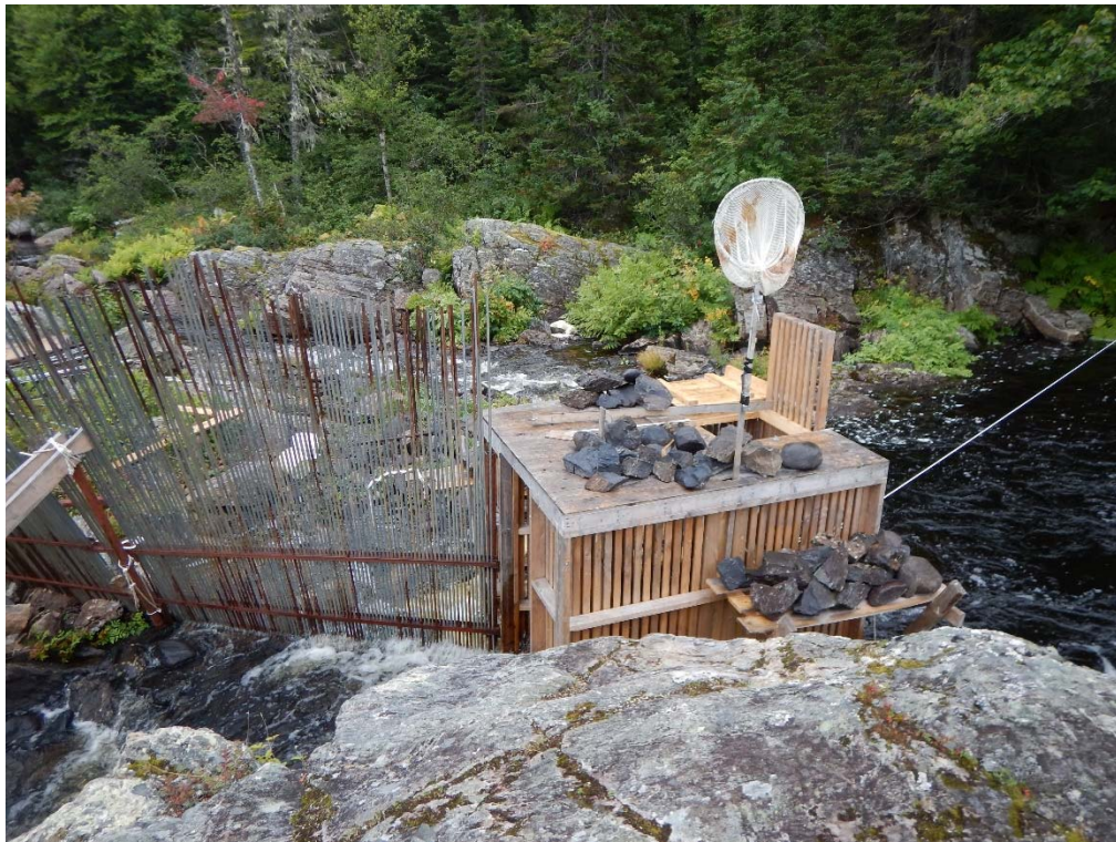
2016 – September