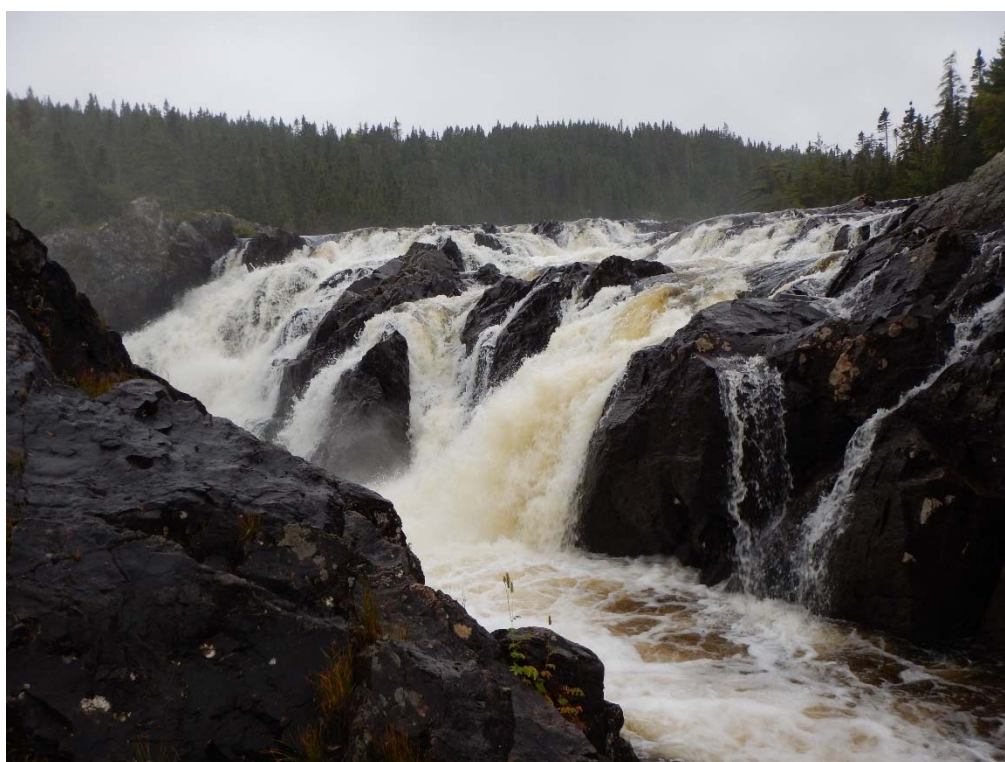
2016 – September