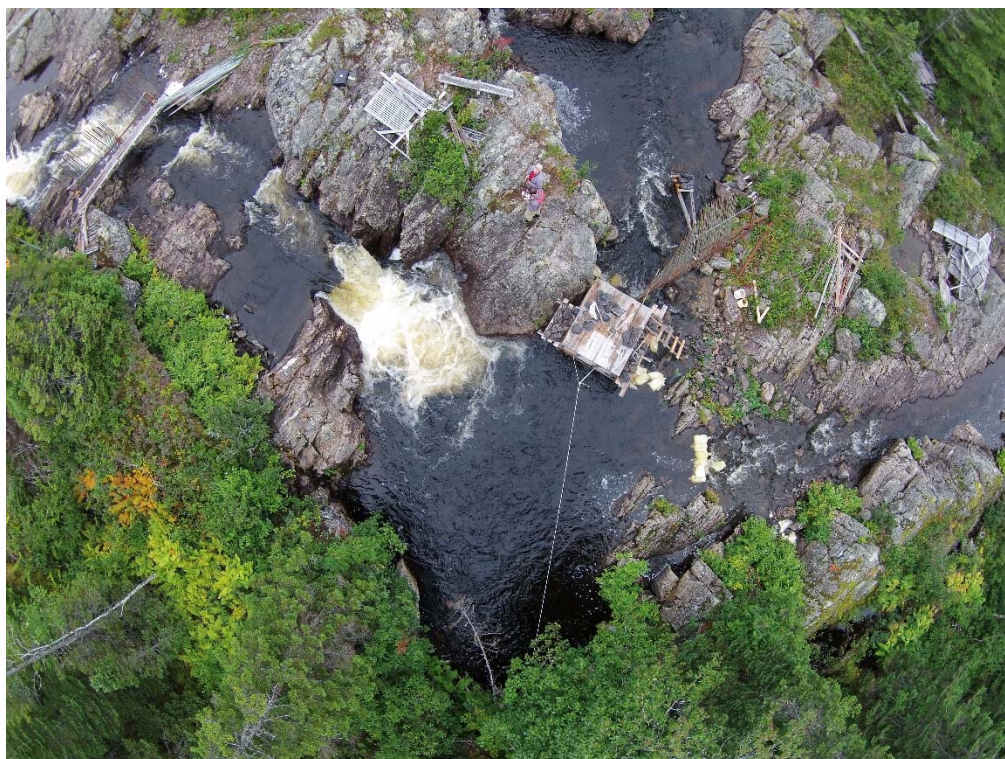
2016 – September