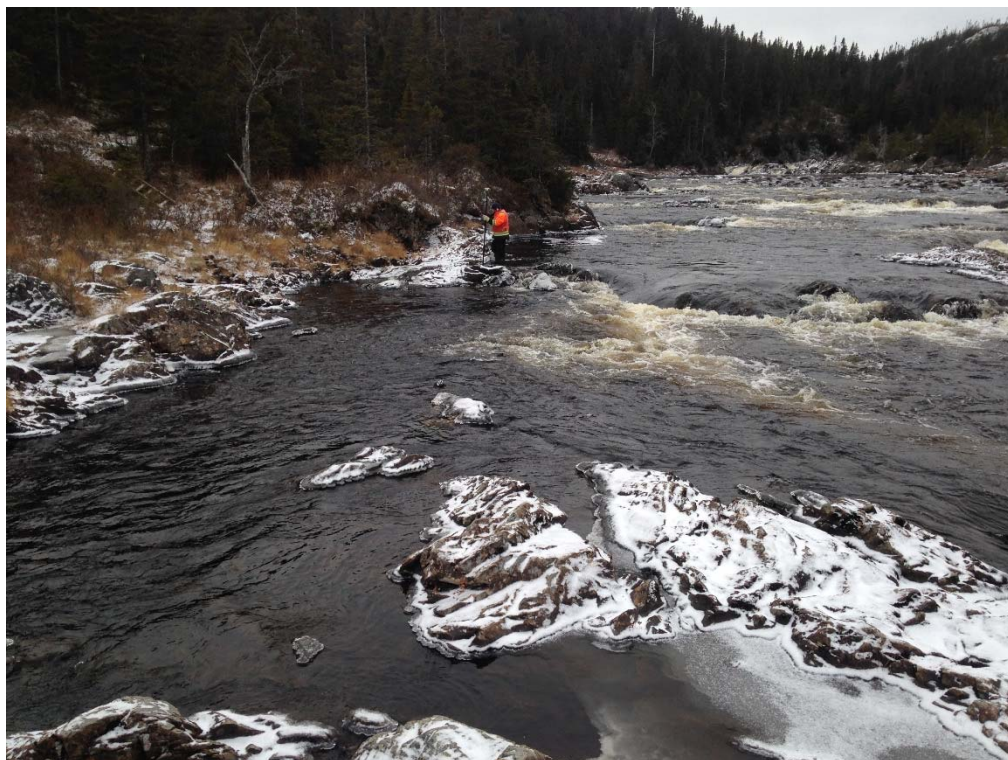
2015 – December