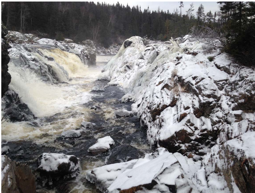
2015 – December