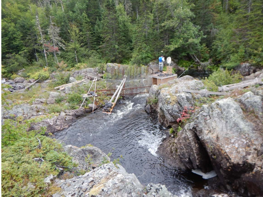
2016 – September