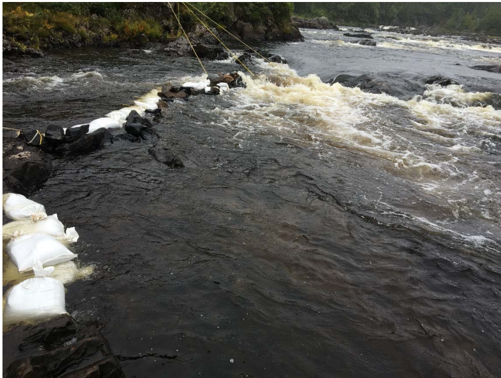
2016 – September