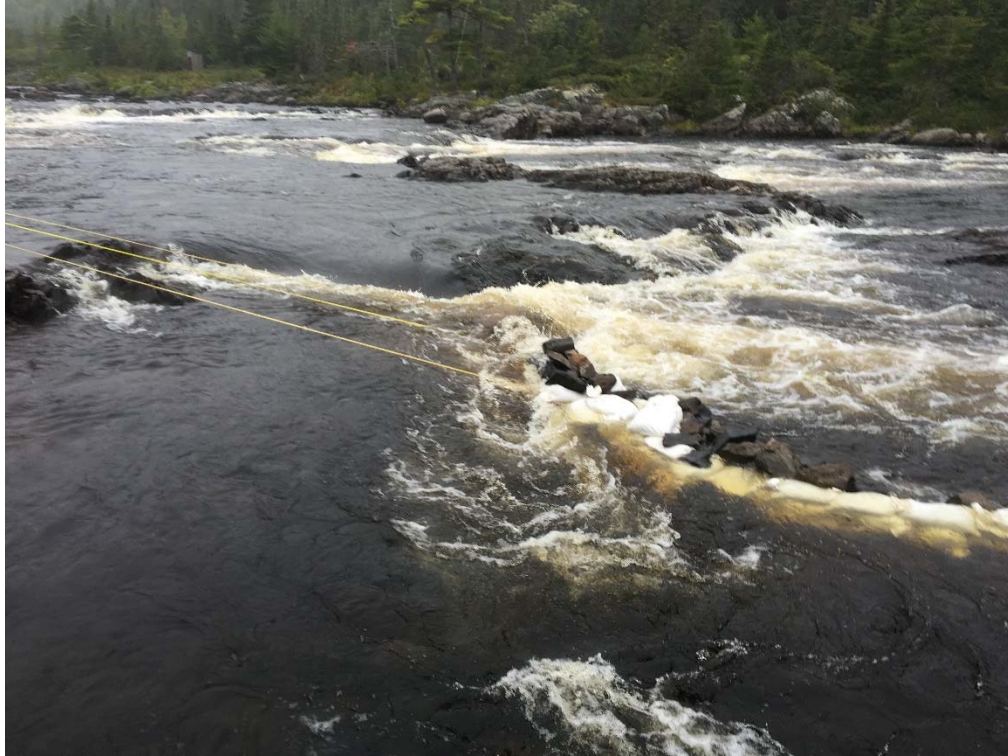
2016 – September