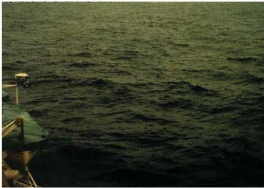
BEAUFORT FORCE 4 WIND SPEED: 11-16 KNOTS SEA: WAVE HEIGHT 1-1.5M (3.5-5FT), SMALL WAVES BECOMING LONGER, FAIRLY FREQUENT WHITE HORSES