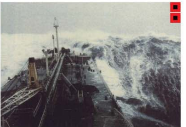
BEAUFORT FORCE 12 WIND SPEED: 64 KNOTS SEA: SEA COMPLETELY WHITE WITH DRIVING SPRAY, VISIBILITY VERY SERIOUSLY AFFECTED, THE AIR IS FILLED WITH FOAM AND SPRAY