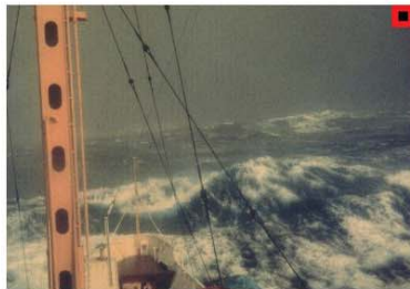
BEAUFORT FORCE 11 WIND SPEED: 56-63 KNOTS SEA: WAVE HEIGHT 11.5-16M (37-52FT), EXCEPTIONALLY HIGH WAVES, SMALL-MEDIUM SIZED SHIPS MAY BE LOST TO VIEW BEHIND THE WAVES, SEA COMPLETELY COVERED WITH LONG WHITE PATCHES OF FOAM LYING ALONG WIND DIRECTION, EVERYWHERE, THE EDGES OF WAVE CRESTS ARE BLOWN INTO FROTH