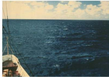
BEAUFORT FORCE 5 WIND SPEED: 17-21 KNOTS SEA: WAVE HEIGHT 2-2.5M (6-8FT), MODERATE WAVES TAKING MORE PRONOUNCED LONG FORM, MANY WHITE HORSES, CHANCE OF SOME SPRAY