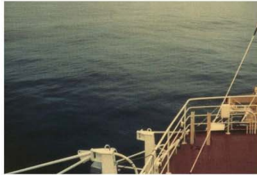
BEAUFORT FORCE 1 WIND SPEED: 1-3 KNOTS SEA: WAVE HEIGHT 1M (25FT), RIPPLES WITH THE APPEARANCE OF SCALES, BUT WITHOUT FOAM CRESTS