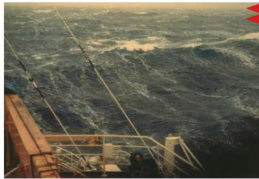
BEAUFORT FORCE 8 WIND SPEED: 34-40 KNOTS SEA: WAVE HEIGHT 5.5-7.5M (18-25FT), MODERATELY HIGH WAVES OF GREATER LENGTH, EDGES OF CREST BEGIN TO BREAK INTO THE SPINDRIFT, FOAM BLOWN IN WELL MARKED STREAKS ALONG WIND DIRECTION