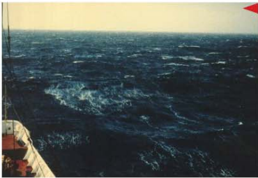
BEAUFORT FORCE 7 WIND SPEED: 28-33 KNOTS SEA: WAVE HEIGHT 4-5.5M (13.5-19 FT), SEA HEAPS UP, WHITE FOAM FROM BREAKING WAVES BEGINS TO BE BLOWN IN STREAKS ALONG THE WIND DIRECTION