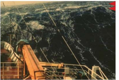
BEAUFORT FORCE 9 WIND SPEED: 41-47 KNOTS SEA: WAVE HEIGHT 7-10M (23-32FT), HIGH WAVES, DENSE STREAKS OF FOAM ALONG DIRECTION OF THE WIND, WAVE CRESTS BEGIN TO TOPPLE, TUMBLE, AND ROLL OVER, SPRAY MAY AFFECT VISIBILITY