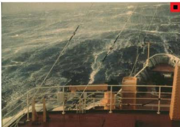
BEAUFORT FORCE 10 WIND SPEED: 48-55 KNOTS SEA: WAVE HEIGHT 9-12.5M (29-41FT), VERY HIGH WAVES WITH LONG OVERHANGING CRESTS, THE RESULTING FOAM, IN GREAT PATCHES, IS BLOWN IN DENSE WHITE STREAKS ALONG WIND DIRECTION, ON THE WHOLE, SEA SURFACE TAKES A WHITE APPEARANCE, TUMBLING OF THE SEA IS HEAVY AND SHOCK-LIKE, VISIBILITY AFFECTED