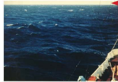
BEAUFORT FORCE 6 WIND SPEED: 22-27 KNOTS SEA: WAVE HEIGHT 3-4M (9.5-13 FT), LARGER WAVES BEGIN TO FORM, SPRAY IS PRESENT, WHITE FOAM CRESTS ARE EVERYWHERE