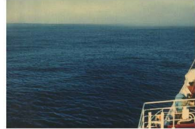
BEAUFORT FORCE 2 WIND SPEED: 4-6 KNOTS SEA: WAVE HEIGHT 2-3M (5-10FT), SMALL WAVELETS, CRESTS HAVE A GLASSY APPEARANCE AND DO NOT BREAK