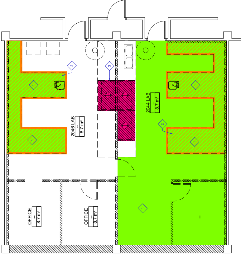
ASBESTOS-ABATEMENT PLAN - LEVEL 2 / PLAN DE DESAMANTAGE - NIVEAU 2