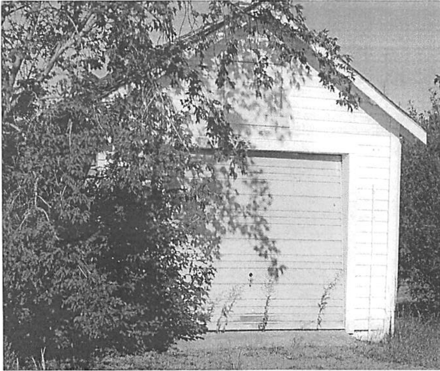
Building #65, Single Car Garage