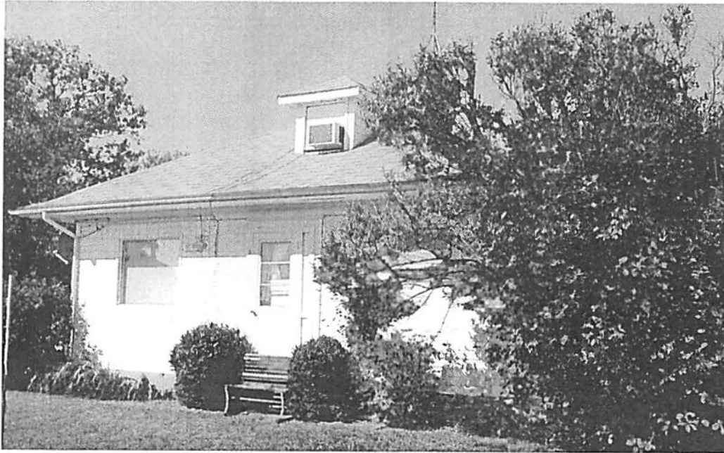
Building #7 Drying Shed (Pigeon Shack)