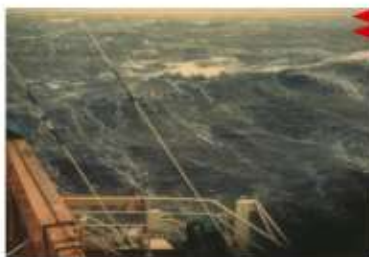
BEAUFORT FORCE 8 WIND SPEED: 34-40 KNOTS SEA: WAVE HEIGHT 5.5-7.5M (18-25FT), MODERATELY HIGH WAVES OF GREATER LENGTH, EDGES OF CREST BEGIN TO BREAK INTO THE SPINDRIFT, FOAM BLOWN IN WELL-MARKED STREAKS ALONG WIND DIRECTION