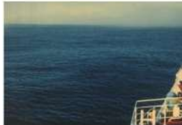
BEAUFORT FORCE 2 WIND SPEED: 4-6 KNOTS SEA: WAVE HEIGHT 2-3M (5-10FT), SMALL WAVELETS, CRESTS HAVE A GLASSY APPEARANCE AND DO NOT BREAK