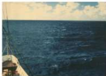
BEAUFORT FORCE 5 WIND SPEED: 17-21 KNOTS SEA: WAVE HEIGHT 2-2.5M (6-8FT), MODERATE WAVES TAKING MORE PRONOUNCED LONG FORM, MANY WHITE HORSES, CHANCE OF SOME SPRAY