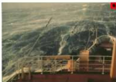
BEAUFORT FORCE 10 WIND SPEED: 48-55 KNOTS SEA: WAVE HEIGHT 9-12.5M (29-41FT), VERY HIGH WAVES WITH LONG OVERHANGING CRESTS, THE RESULTING FOAM, IN GREAT PATCHES, IS BLOWN IN DENSE WHITE STREAKS ALONG WIND DIRECTION, ON THE WHOLE, SEA SURFACE TAKES A WHITE APPEARANCE, TUMBLING OF THE SEA IS HEAVY AND SHOCK-LIKE, VISIBILITY AFFECTED