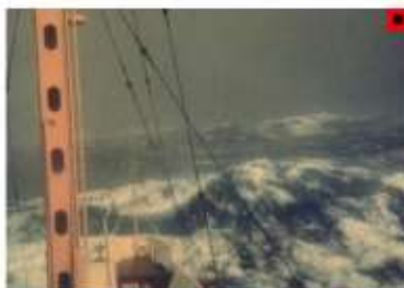
BEAUFORT FORCE 11 WIND SPEED: 56-63 KNOTS SEA: WAVE HEIGHT 11.5-16M (37-53FT), EXCEPTIONALLY HIGH WAVES, SMALL, MEDIUM SIZED SHIPS MAY BE LOST TO VIEW BEHIND THE WAVES, SEA COMPLETELY COVERED WITH LONG WHITE PATCHES OF FOAM (FWD) ALONG WIND DIRECTION, EVERYWHERE, THE EDGES OF WAVE CRESTS ARE BLOWN INTO FROTH