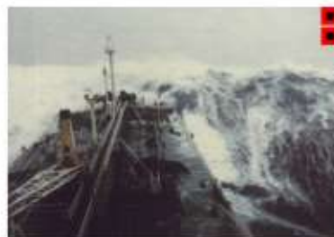
BEAUFORT FORCE 12 WIND SPEED: 64 KNOTS SEA: SEA COMPLETELY WHITE WITH DRIVING SPRAY, VISIBILITY VERY SERIOUSLY AFFECTED, THE AIR IS FILLED WITH FOAM AND SPRAY