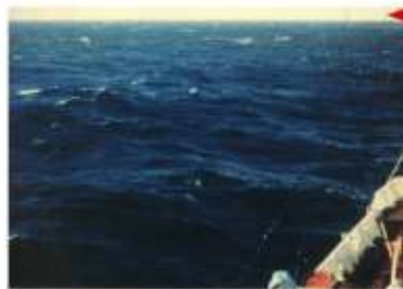
BEAUFORT FORCE 6 WIND SPEED: 22-27 KNOTS SEA: WAVE HEIGHT 3-4M (9.5-13 FT), LARGER WAVES BEGIN TO FORM, SPRAY IS PRESENT, WHITE FOAM CRESTS ARE EVERYWHERE