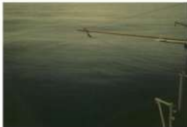
BEAUFORT FORCE 0 WIND SPEED: LESS THAN 1 KNOT SEA: SEA LIKE A MIRROR