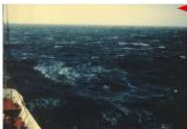
BEAUFORT FORCE 7 WIND SPEED: 28-33 KNOTS SEA: WAVE HEIGHT 4-5.5M (13-18 FT), SEA HEAPS UP, WHITE FOAM FROM BREAKING WAVES BEGINS TO BE BLOWN IN STREAKS ALONG THE WIND DIRECTION