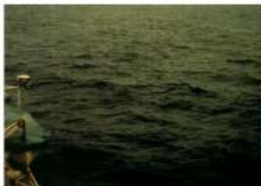
BEAUFORT FORCE 4 WIND SPEED: 11-16 KNOTS SEA: WAVE HEIGHT 1-1.5M (3.5-5FT), SMALL WAVES BECOMING LONGER, FAIRLY FREQUENT WHITE HORSES