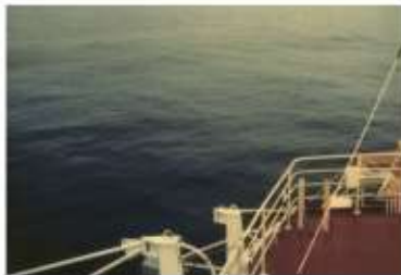
BEAUFORT FORCE 1 WIND SPEED: 1-3 KNOTS SEA: WAVE HEIGHT 1M (3.3FT), RIPPLES WITH THE APPEARANCE OF SCALES, BUT WITHOUT FOAM CRESTS