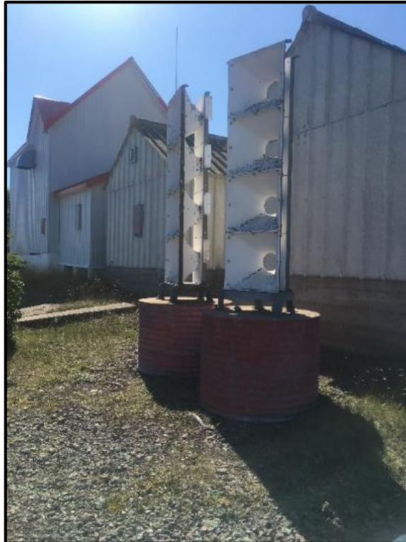
Photograph 30: Two navigation aids located east of the generator shed. Lead-based white and red paint on surfaces.