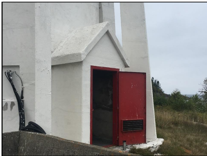
Photograph 26: Exterior of the lighthouse entry, with red lead-based paint on door and trim.