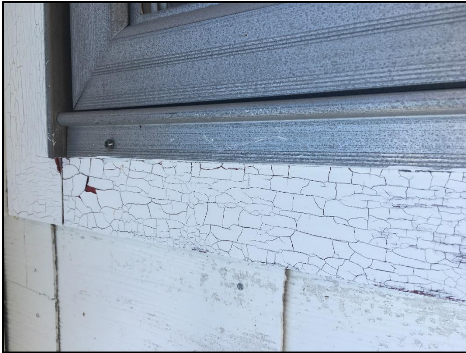
Photograph 13: View of white on red lead-based paint observed on window and door trim of the living quarters building.