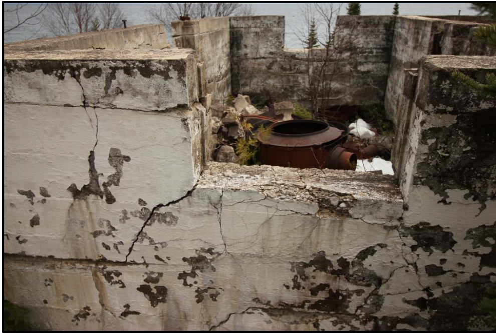
Photograph 39: Concentrated debris observed inside of the radio beacon building foundation. The concrete foundation has lead-based painted surfaces.