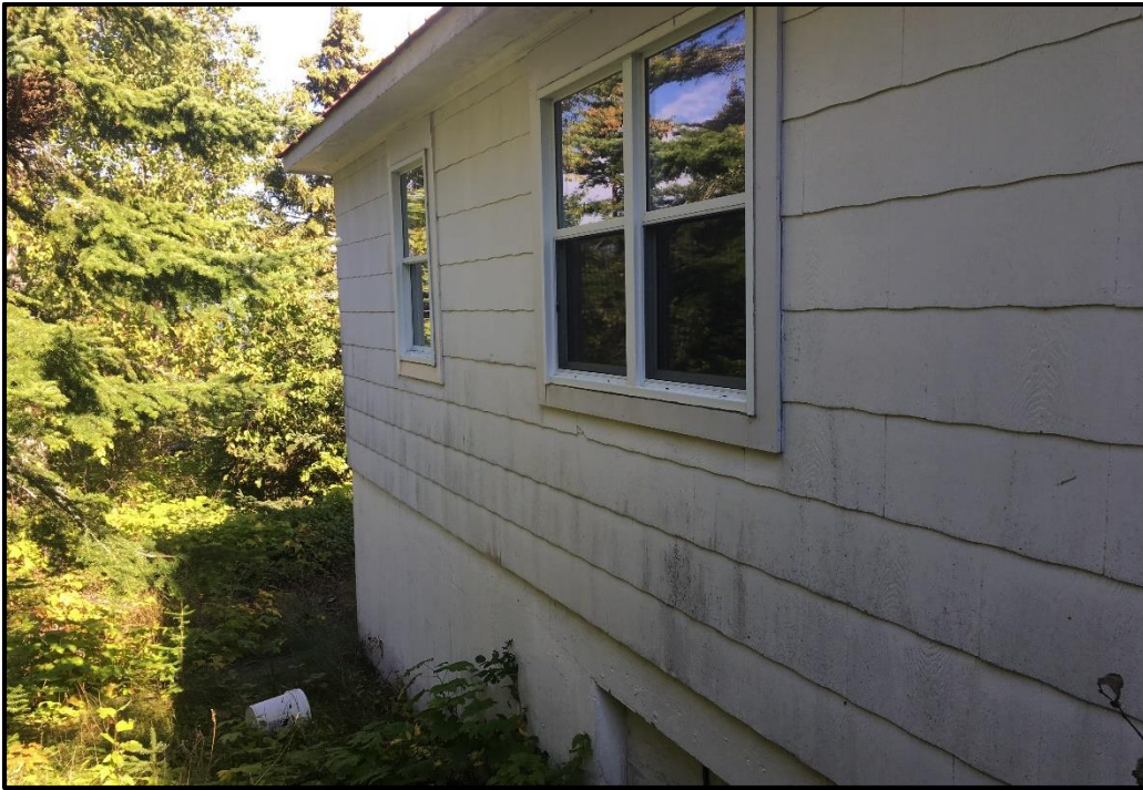
Photograph 15: Asbestos containing transite siding painted with white lead-based paint on the exterior of the living quarters building.