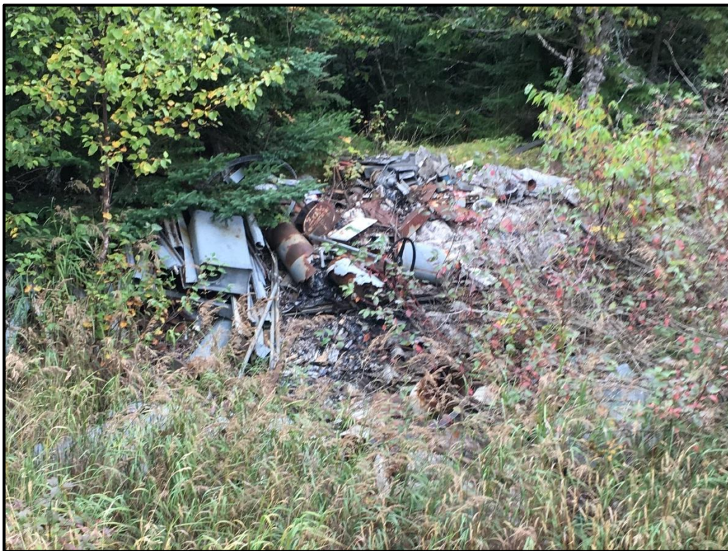
Photograph 40: Concentrated debris within debris pile 1 located in a wooded area west of the living quarters building.