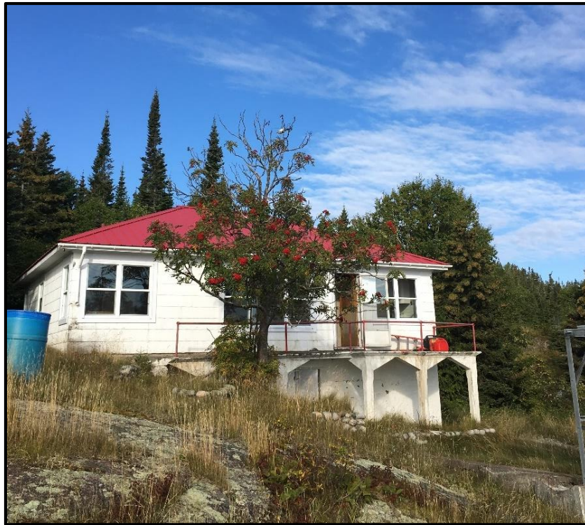
Photograph 3: Living quarters building looking east.