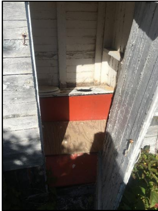
Photograph 31: North outhouse with lead-based wood on the exterior and interior. Lead paint debris was also observed on the ground surrounding the outhouse. Asbestos-containing shingles observed on the roof and as debris surrounding the structure.