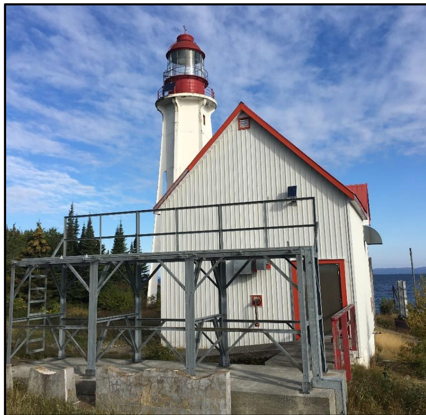
Photograph 4: Garage/former living quarters building and fuel stage looking northeast.