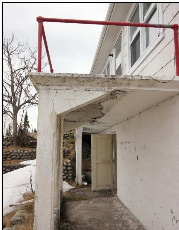
Photograph 10: Exterior of the living quarters building from the lower level looking south.