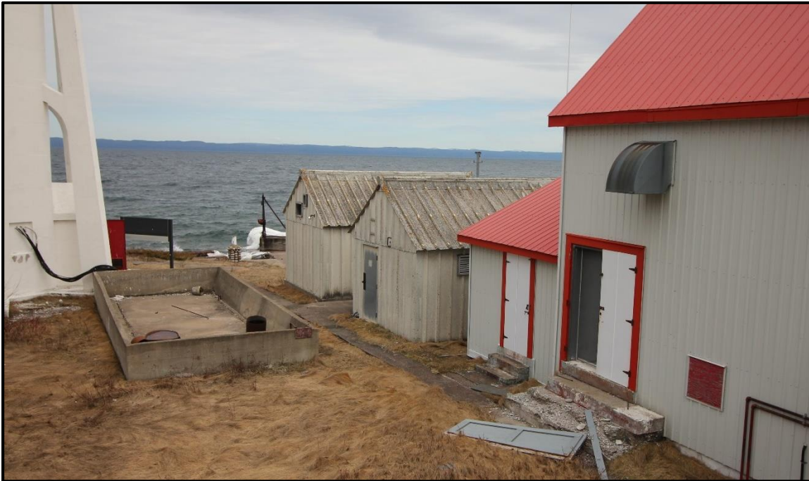
Photograph 5: Garage/former living quarters building with equipment shed and generator shed to the north, and concrete dyke at centre-left in photograph, looking north.