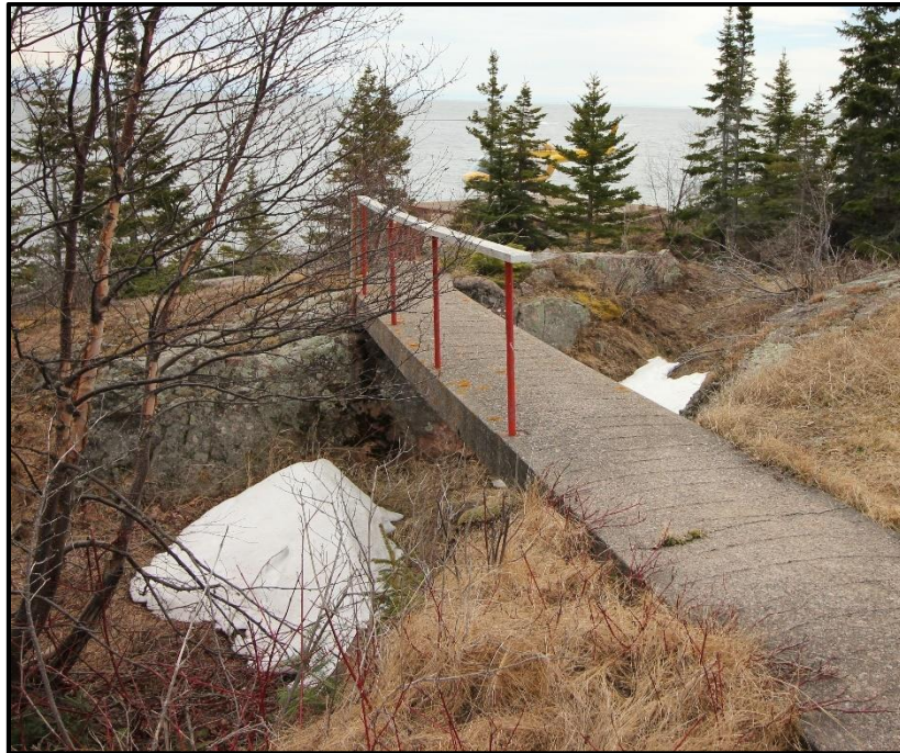
Photograph 33: View of walkway leading south towards the helipad. Lead-based paints on metal and wood rails.