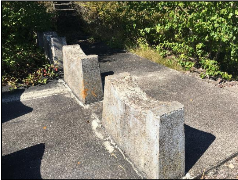
Photograph 45: Tank cradles located south of the garage/former living quarters. Residual lead-based white paint observed.