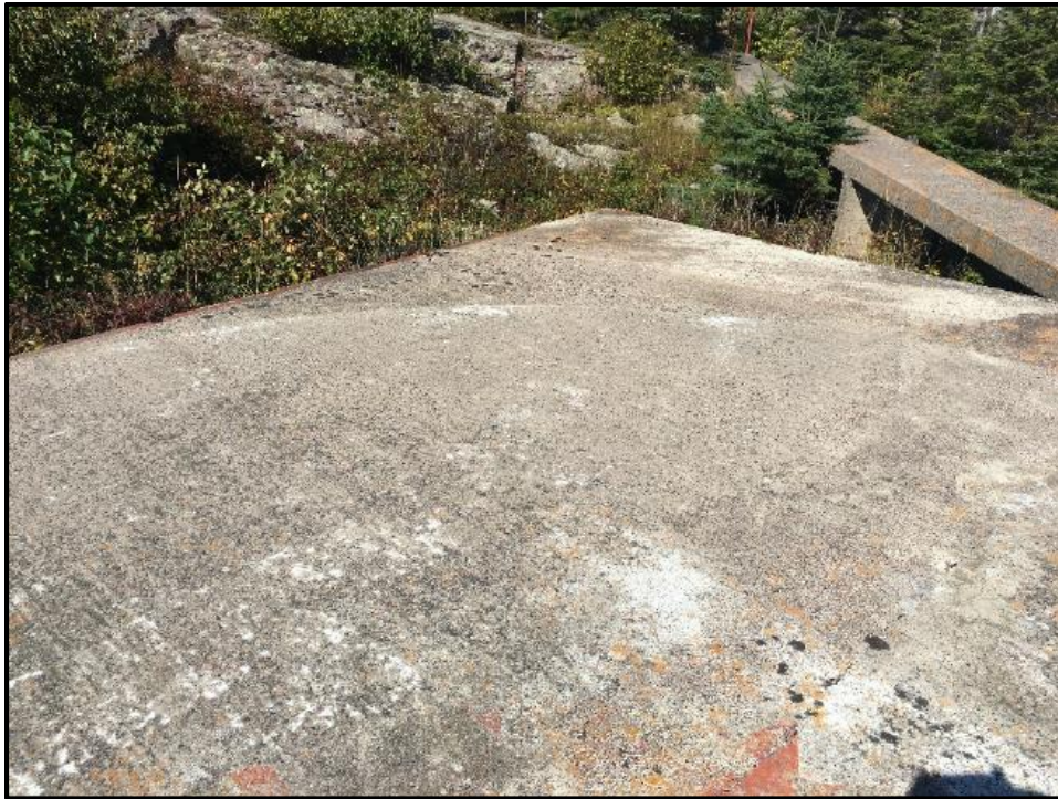
Photograph 29: Helipad with residual lead-based red and white paint.