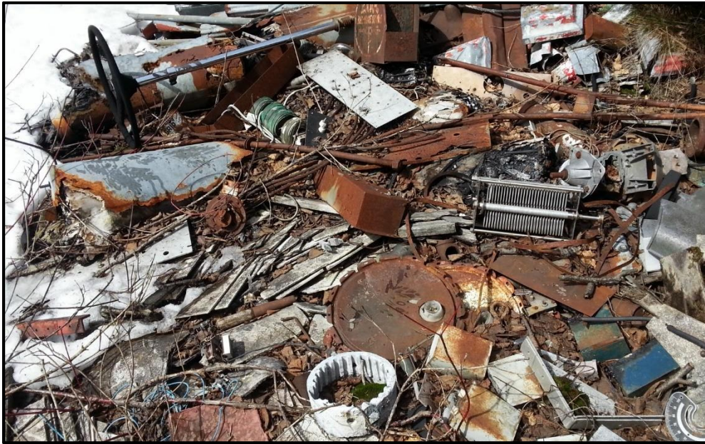
Photograph 41: Waste observed in Debris Pile 1. Wood with lead-based paint and asbestos containing materials, such as transite and shingles were observed.