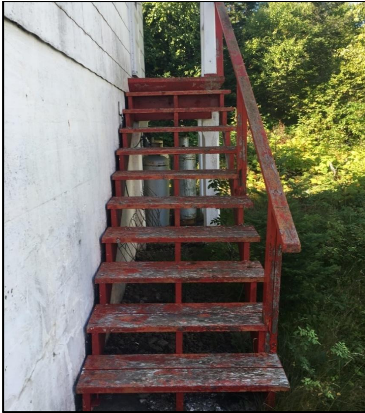
Photograph 11: Wooden staircase located on the north wall of the living quarters building with red lead-based paint.