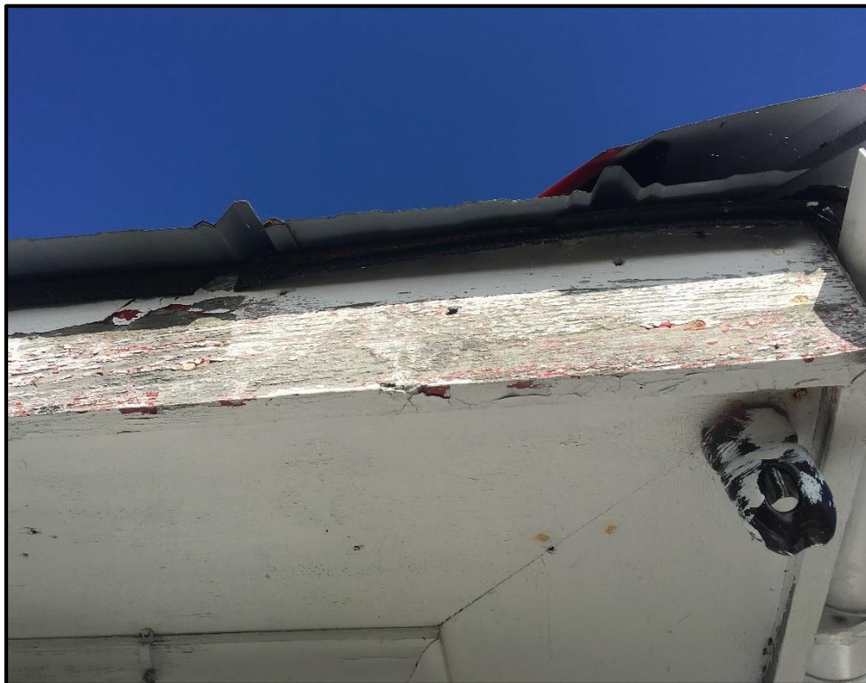
Photograph 14 – View of white lead- based painted soffit and fascia on the exterior of the living quarters building.