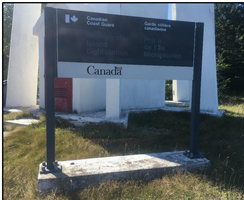
Photograph 24: Lighthouse sign with lead-based painted concrete base located north of the lighthouse.