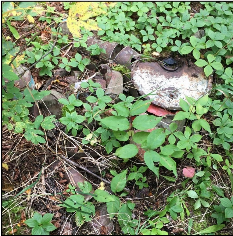
Photograph 43: Scattered debris observed in wooded area behind the duplex dwelling foundation.