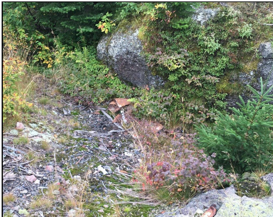
Photograph 42: Debris Pile 2 located in a rock crevice south of the radio beacon building foundation.