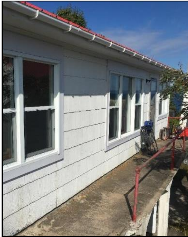
Photograph 9: Exterior of living quarters building looking northeast. Lead-containing white paint on asbestos containing transite siding.