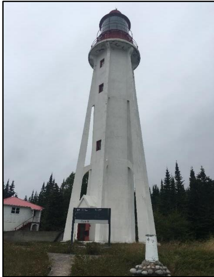
Photograph 25: View of the lighthouse exterior painted with lead-based paint, facing south.