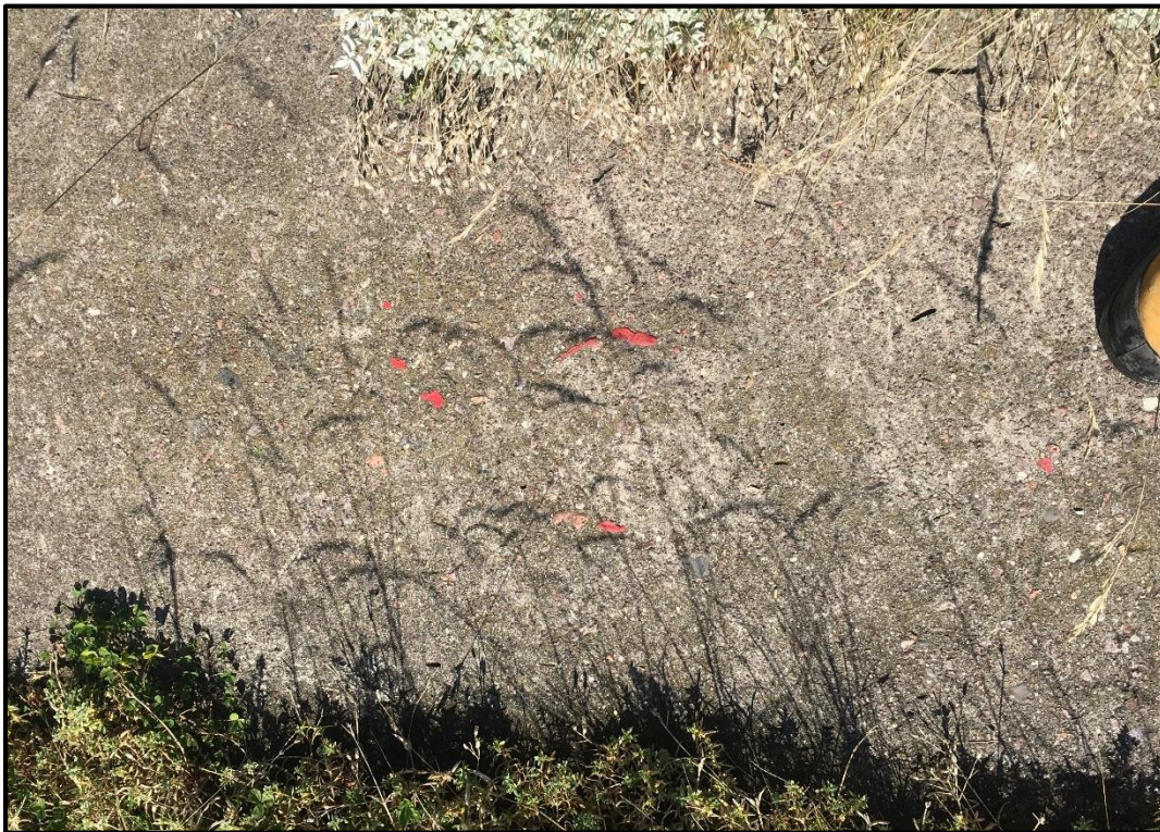
Photograph 16 – Red lead-based paint observed on the sidewalk near the living quarters building.