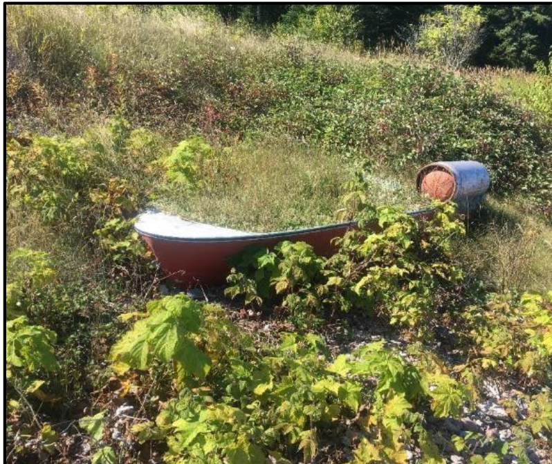
Photograph 34: Boat located east of the duplex dwelling foundation, with nearby metal debris. Lead-based white and red/orange paint are present on the boat, which is filled with soil.