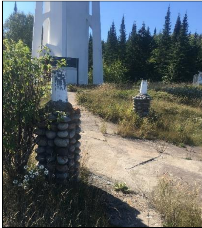
Photograph 23: Two rock pillars with lead-based painted posts located north of the lighthouse.