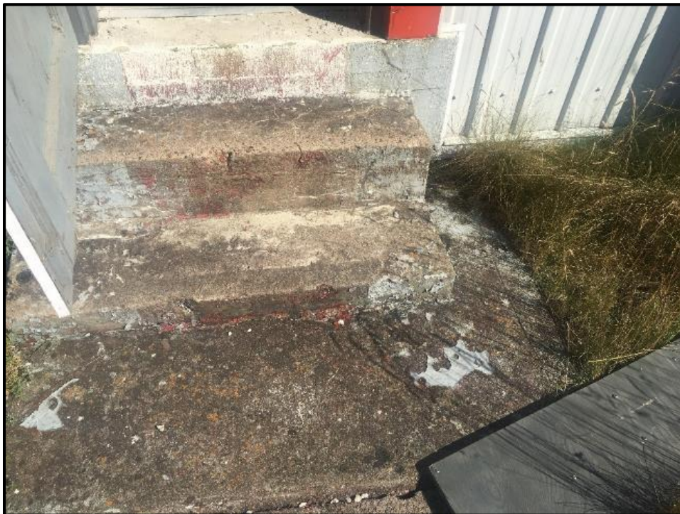
Photograph 22: Lead-based red and grey paint on the concrete steps at the south side of the garage/former living quarters building.