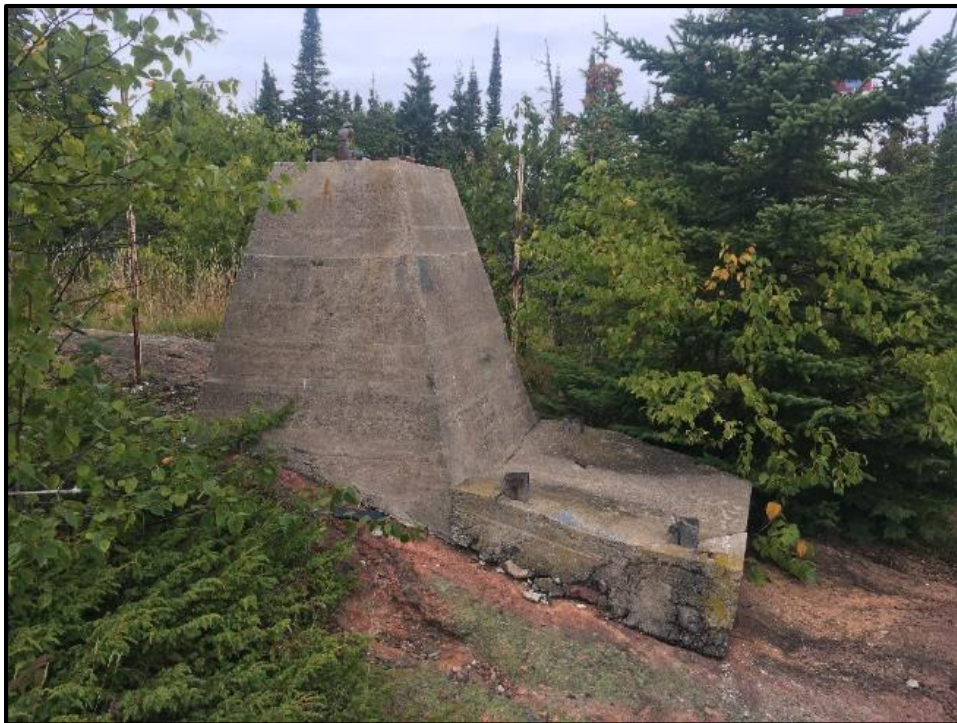
Photograph 20: Radio tower base, located west of the radio beacon building foundation. Lead-based grey and white paint are present.