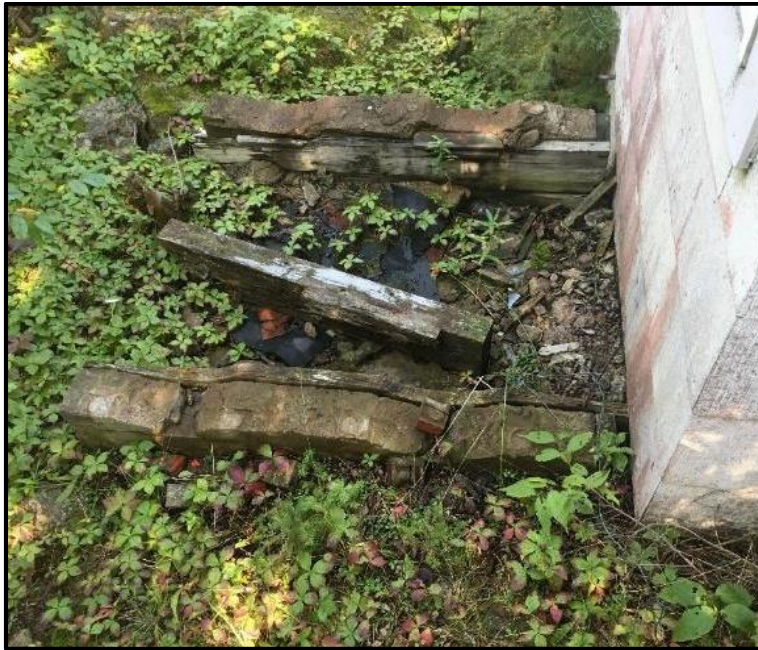
Photograph 17: Asbestos containing shingle debris located behind the living quarters building.