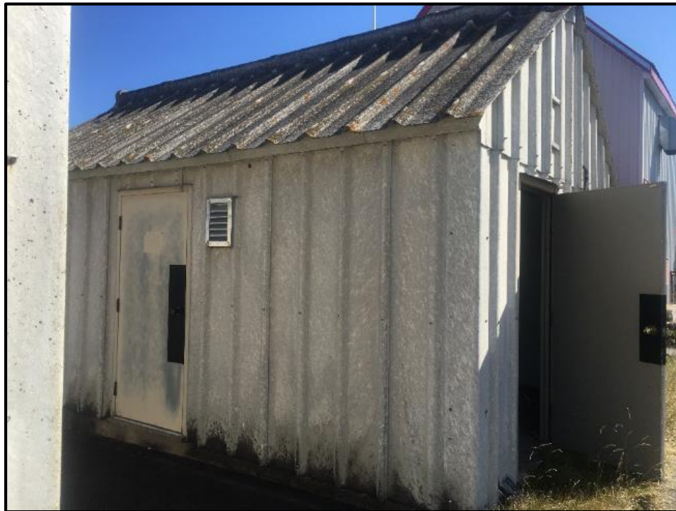
Photograph 28: View of the equipment shed. Interior floor contains grey lead-based paint and asbestos shingles observed inside.