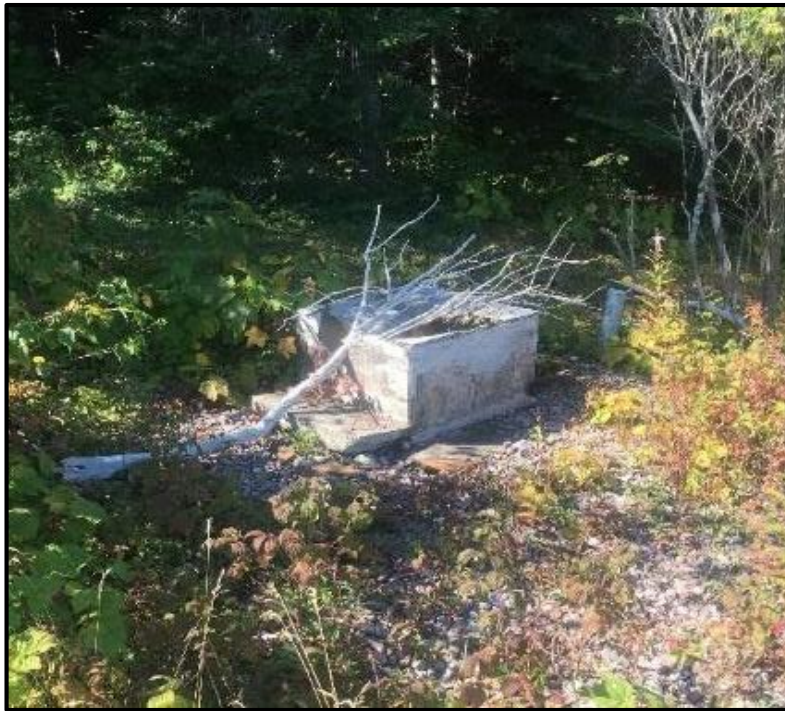
Photograph 37: View of outhouse foundation located north of the duplex dwelling foundation. White lead-based paint on concrete surfaces.