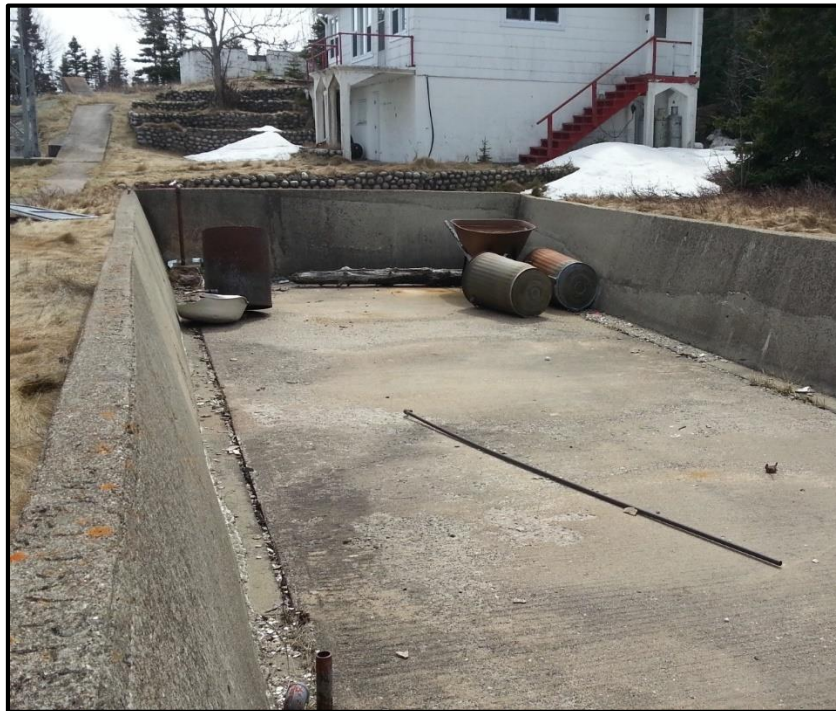
Photograph 44: Scattered metal debris observed in the concrete dyke.