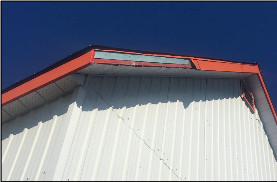
Photograph 21: Exposed red lead-based painted wood trim underlying red metal flashing along roof line of garage/former living quarters building.