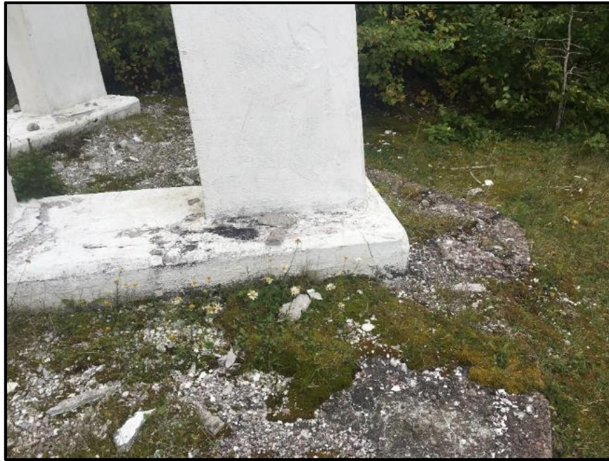
Photograph 27: Debris including lead-based paint chips and painted parging located at the base of the lighthouse.