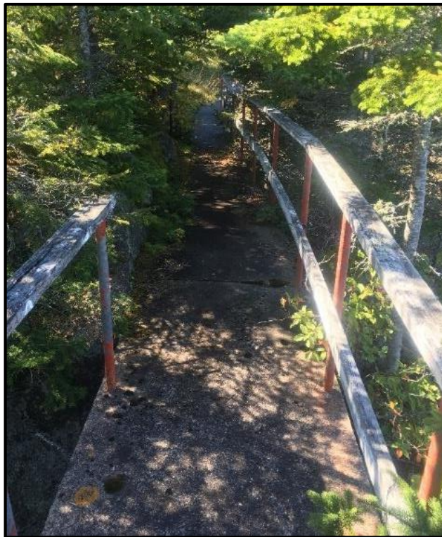
Photograph 32: View of the walkway leading north towards the duplex dwelling foundation. Lead-based paints on metal and wood rails.