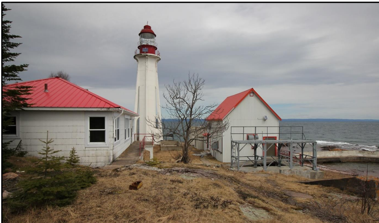
Photograph 6: View of living quarters building (at left), garage/former living quarters and fuel stage (at right) and lighthouse (centre), looking north.