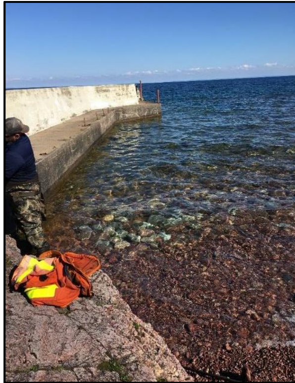
Photograph 7: East dock – concrete dock located east of the equipment and generator shed.