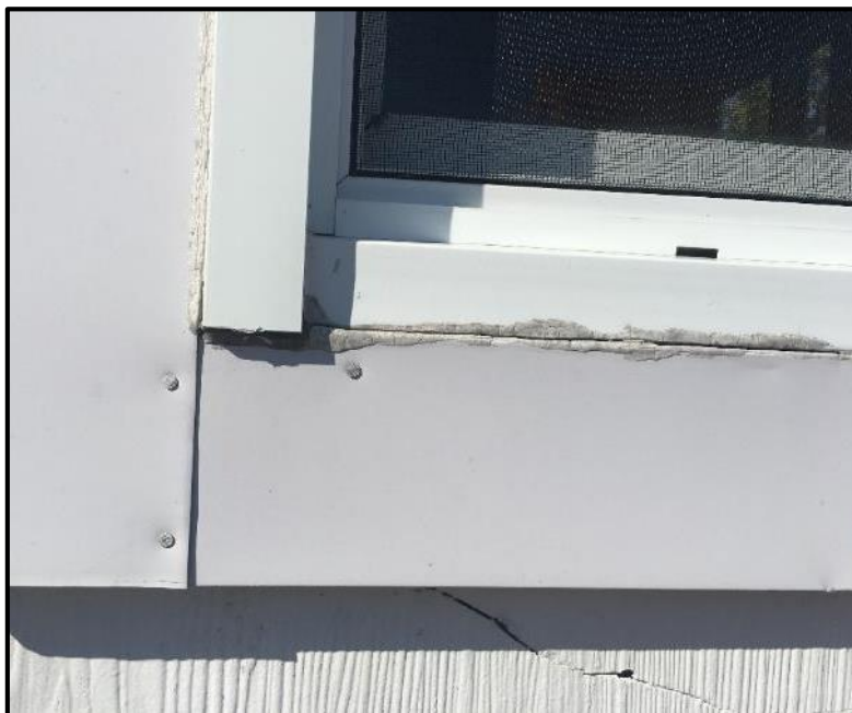
Photograph 12: Asbestos containing white caulking and transite siding on the exterior of the living quarters.