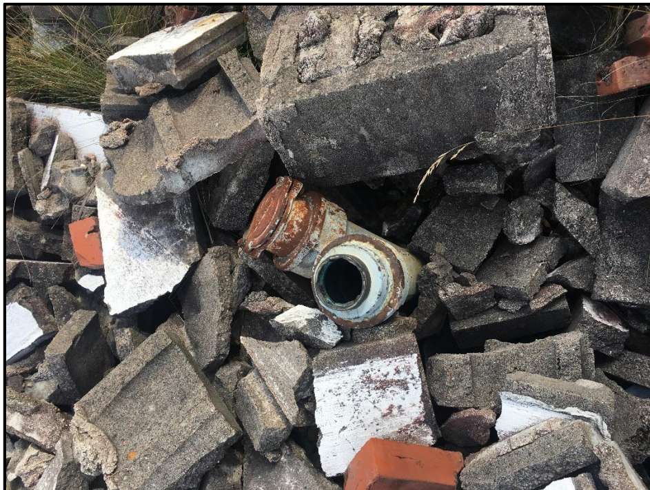
Photograph 36: Lead-based painted concrete debris observed in the foundation of the duplex dwelling.