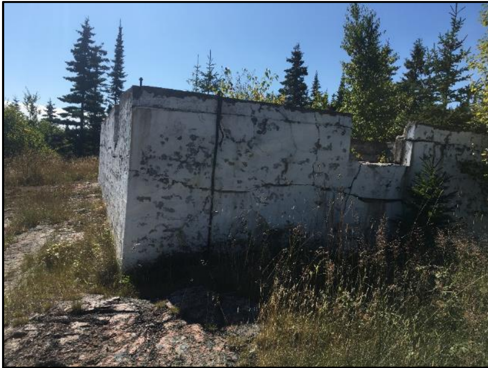
Photograph 19: View of the radio beacon building foundation. Concrete foundation has lead-based white paint. Debris inside foundation includes painted concrete pieces.