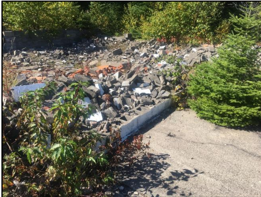
Photograph 35: Duplex dwelling foundation with white lead-based paint on concrete blocks.