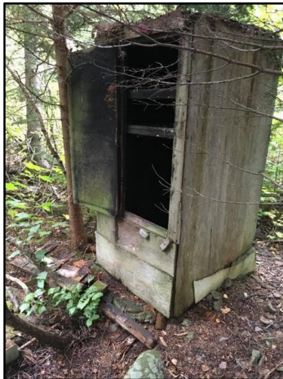
Photograph 38: South outhouse located in wooded area west of living quarters building. Asbestos-containing transite panels with tar paper form the roof and walls, and lead-based paint debris and other debris is present within the outhouse and surrounding ground.