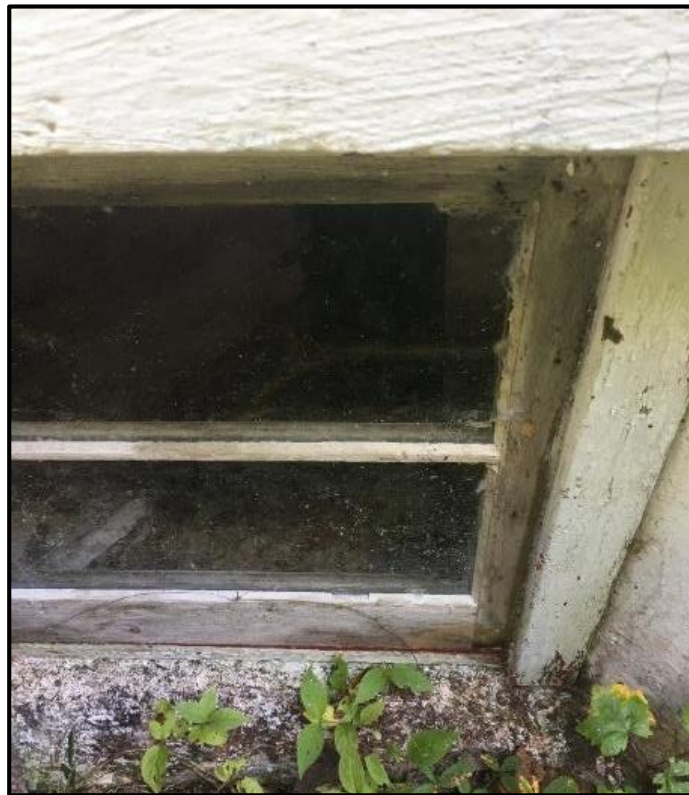
Photograph 18: View of exterior basement window of the living quarters building. Asbestos containing grey caulking is present.