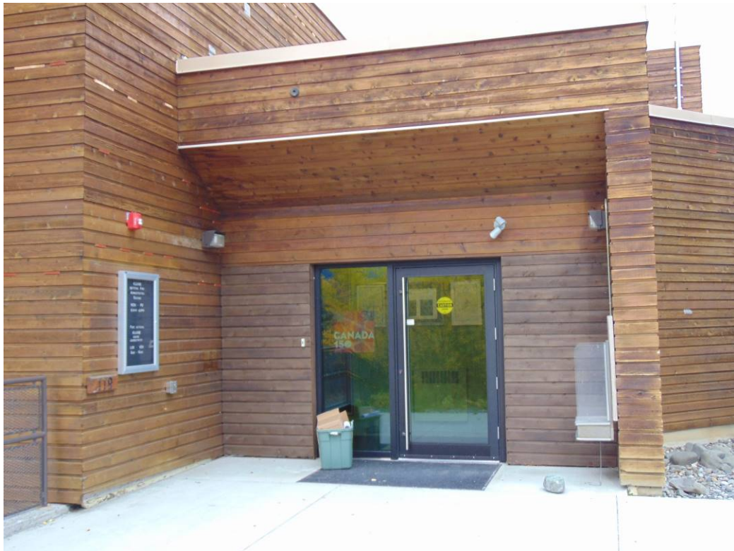
Photograph 2. – Main entrance on south elevation