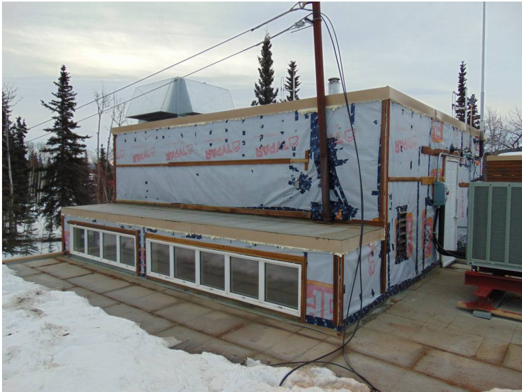
Photograph 25. – Penthouse north wall