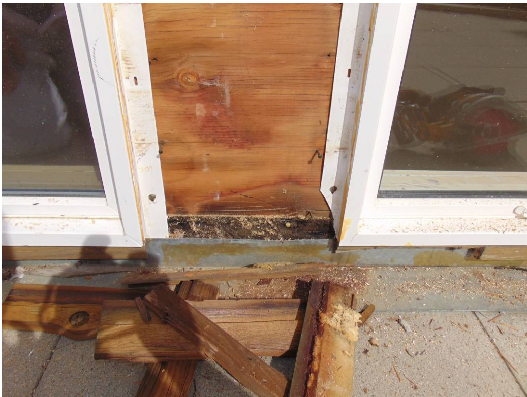
Photograph 22. – Cut test at clerestory windows along GL L.