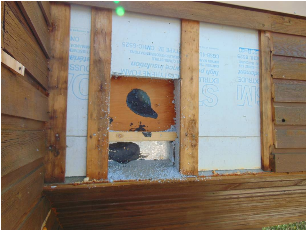
Photograph 20. – Cut test along GL J between 4 and 5.