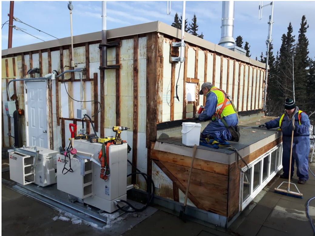
Photograph 23. – View of penthouse from southwest corner during demolition of siding