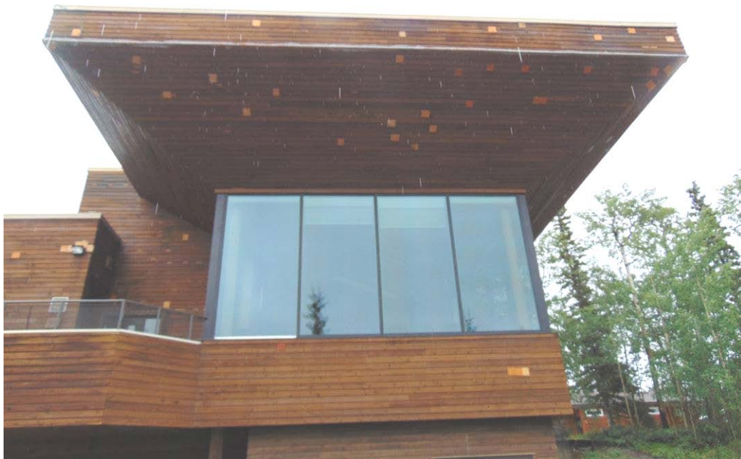
Photograph 10. – Southern section of west elevation (main floor)