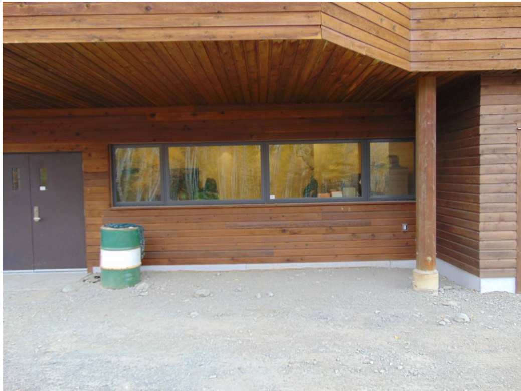
Photograph 9. – View of wall below deck on west elevation