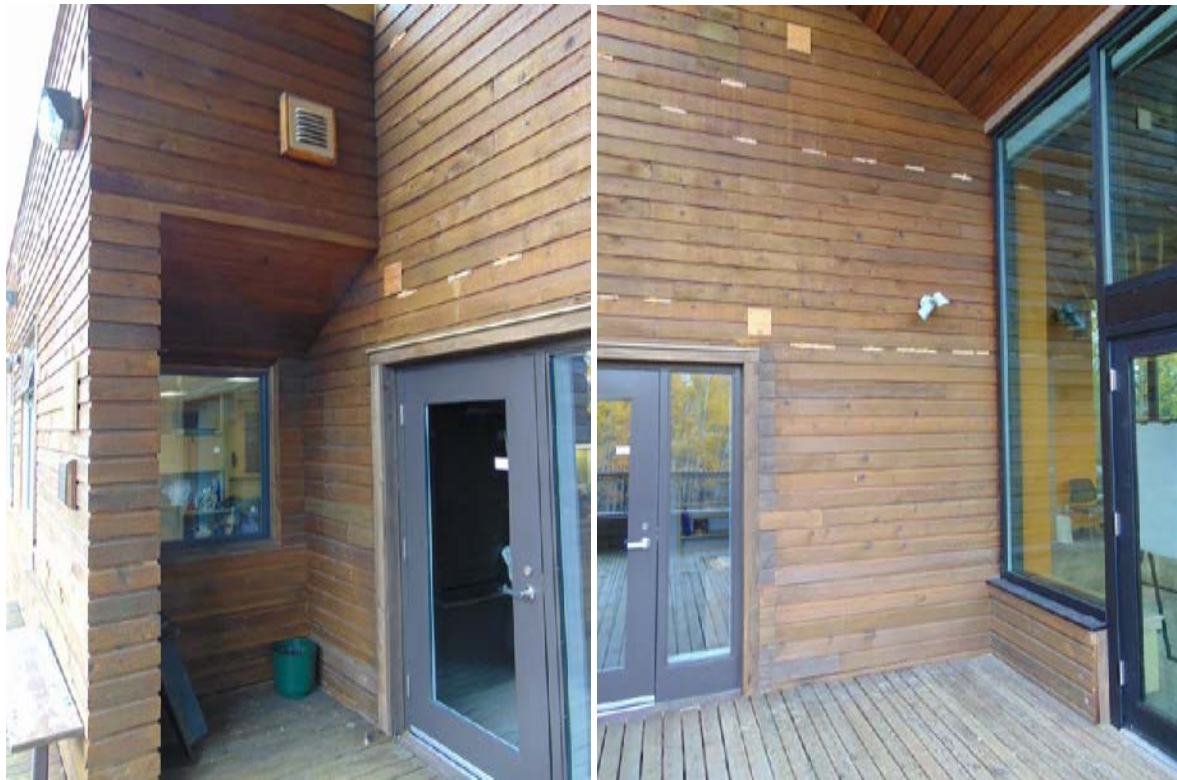
Photograph 8. A+B – South, west and north walls at deck on west side of building