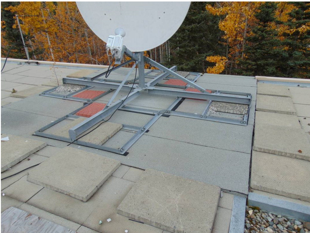
Photograph 18. – Existing satellite dish support between GLs T+W and 9 and 11.