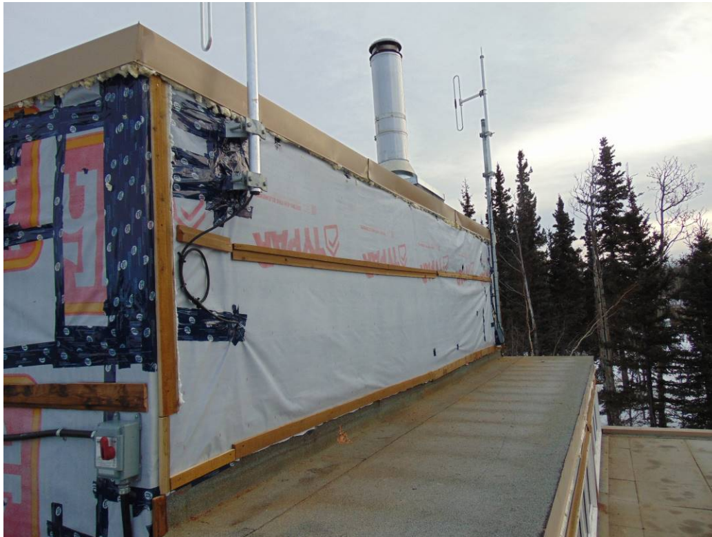
Photograph 27. – Penthouse south wall