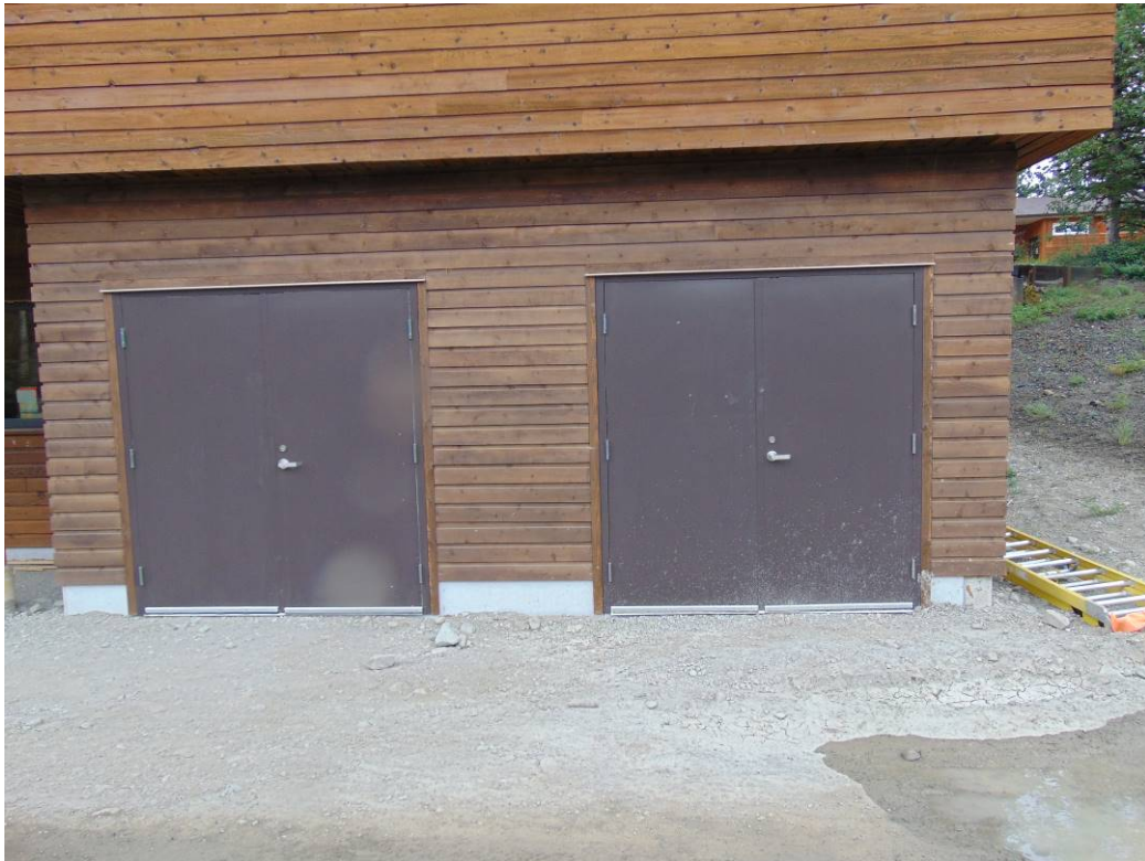
Photograph 11. – Southern section of west elevation (lower level)