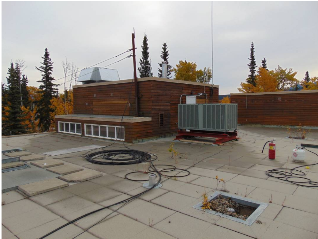
Photograph 14. – Overall view of penthouse and roof surface from northwest prior to siding removal.