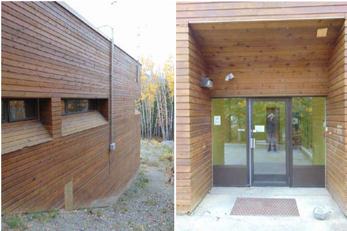
Photograph 4. – Views of north wall and north entrance