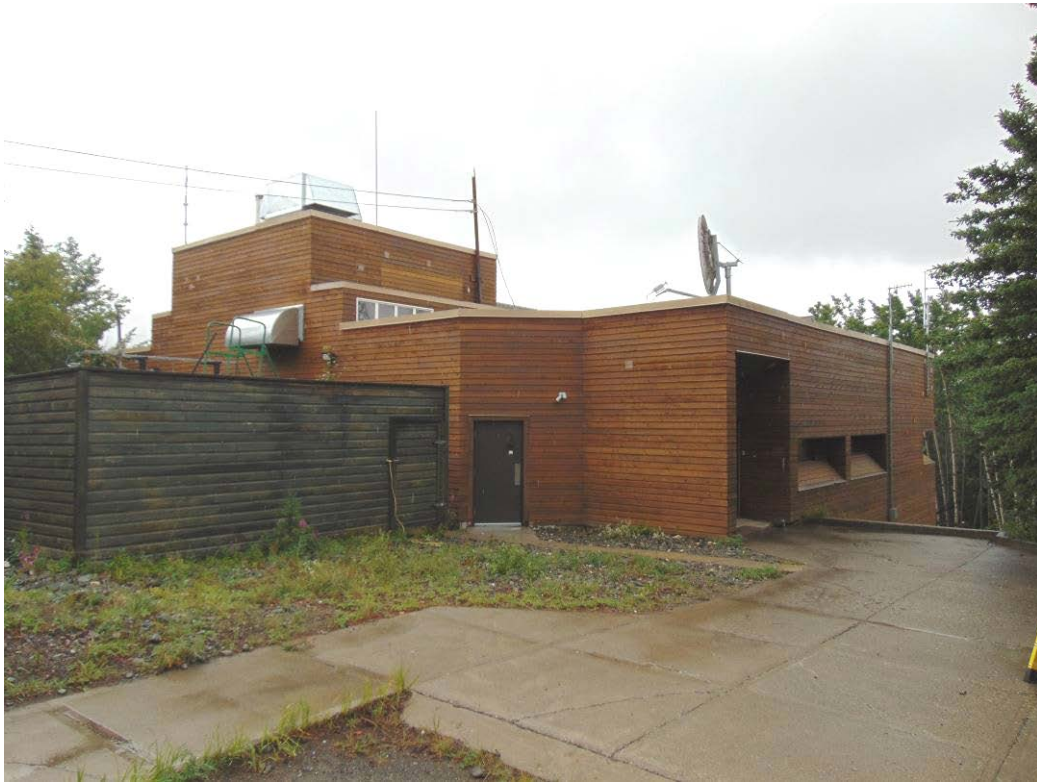
Photograph 5. – Views of building from northeast corner