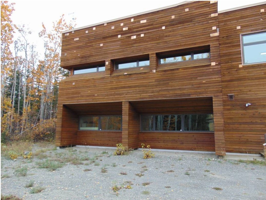
Photograph 6. – North section of west elevation