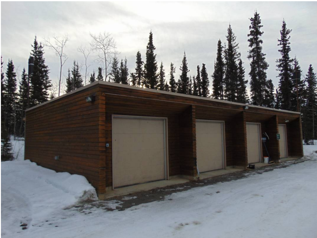
Photograph 30. - View of garage from northwest corner