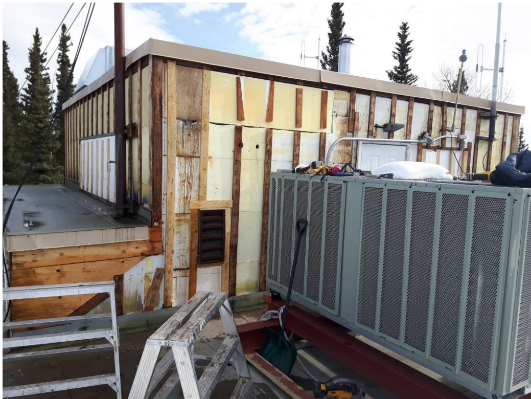
Photograph 24. – View of penthouse from northwest corner during demolition of siding