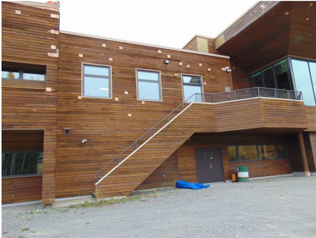
Photograph 7. – Central section of west elevation