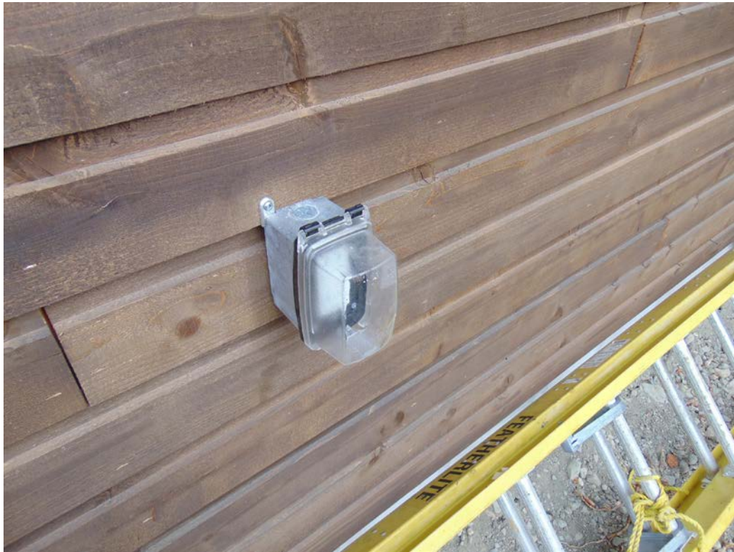
Photograph 15. – Typical exterior receptacle