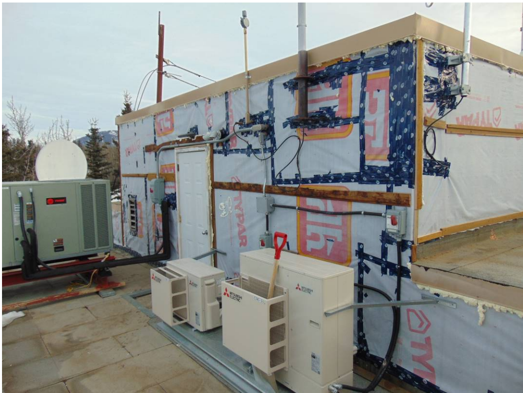
Photograph 26. – Penthouse west wall