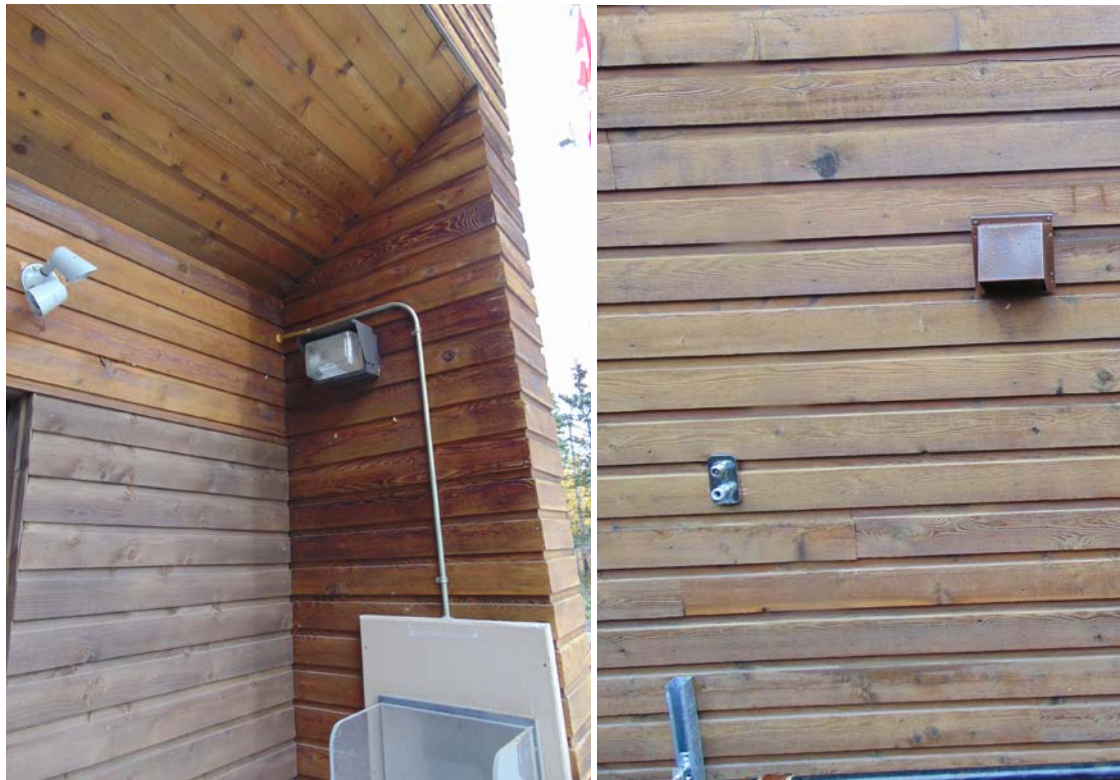
Photograph 16. A+B – Typical exterior luminaire, emergency lighting, hose bibb, and small hood