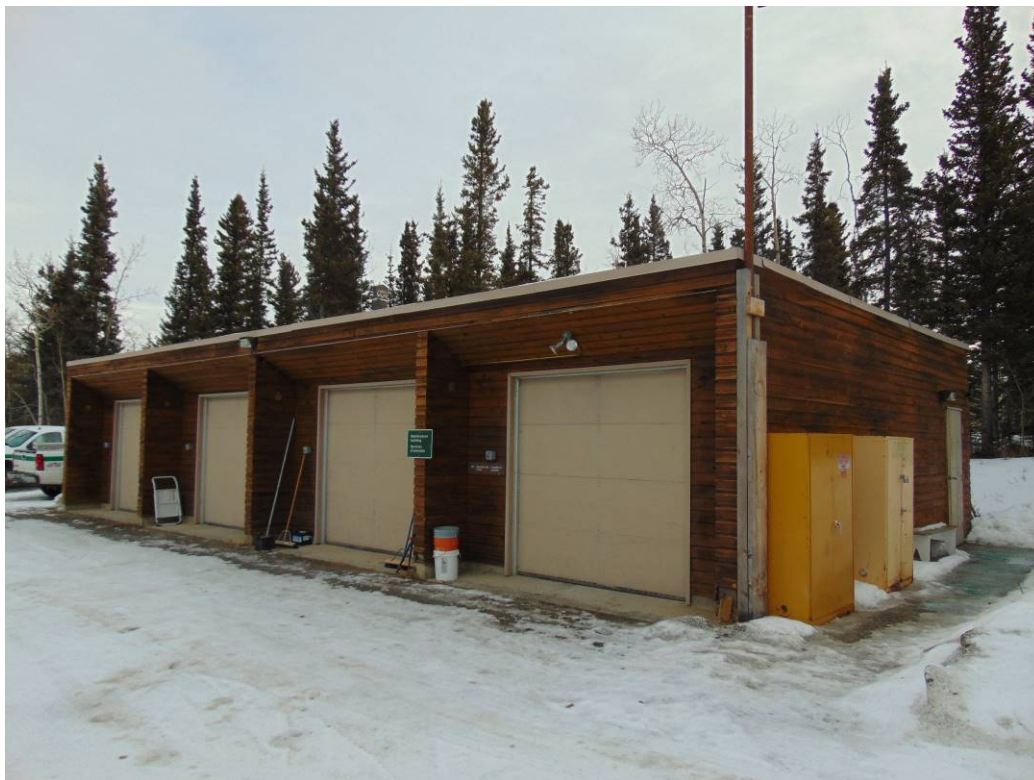
Photograph 28. - View of garage from southwest corner