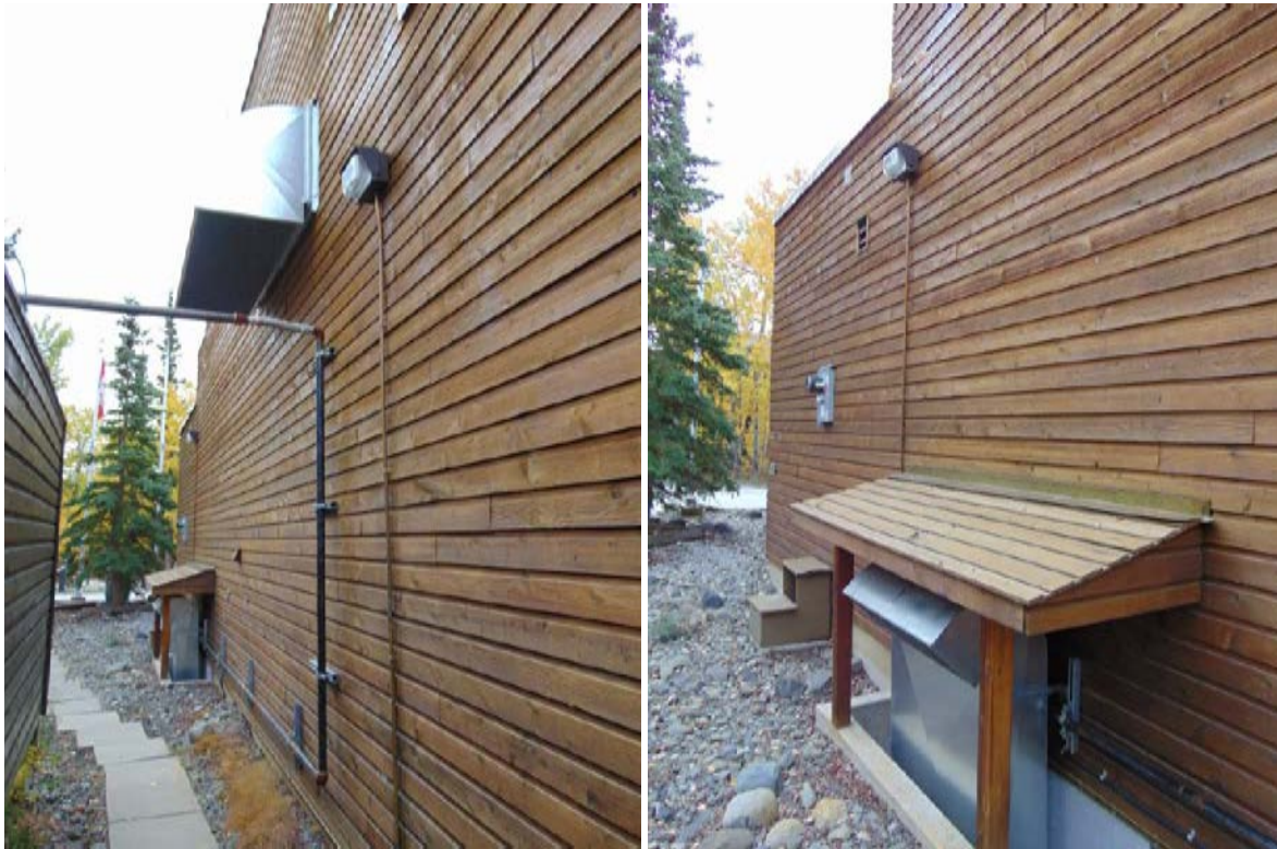
Photograph 3. A+B - Views of east wall of building. Note hood, conduit and fuel line.