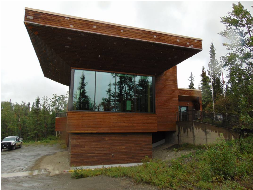
Photograph 12. – View of building from south