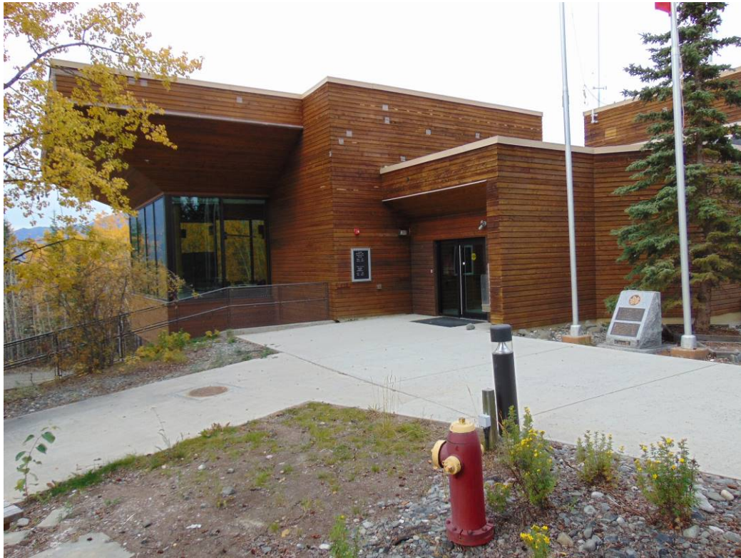
Photograph 1. – View of main entrance from southeast