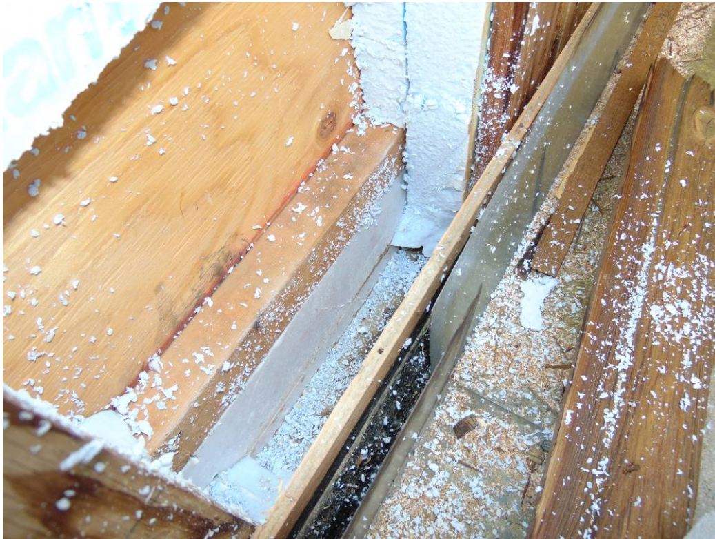
Photograph 21. – Cut test at base of wall at roof at GL K+5. On right is galvanized flashing support.