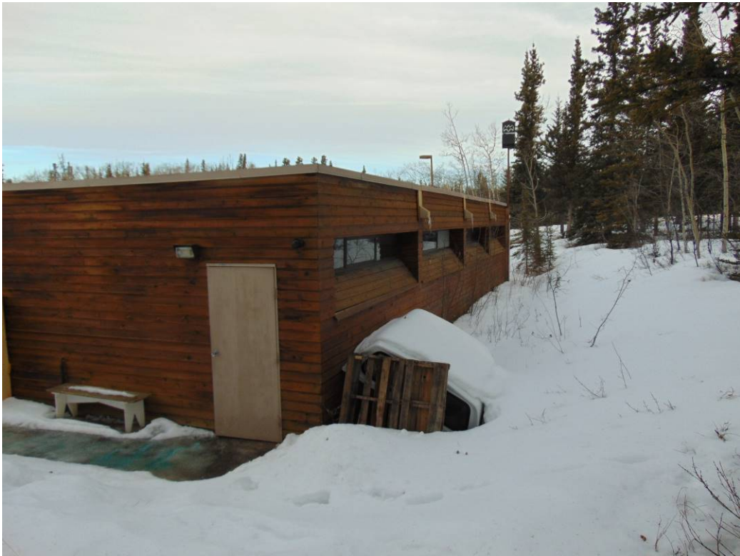
Photograph 29. - View of garage from southeast corner