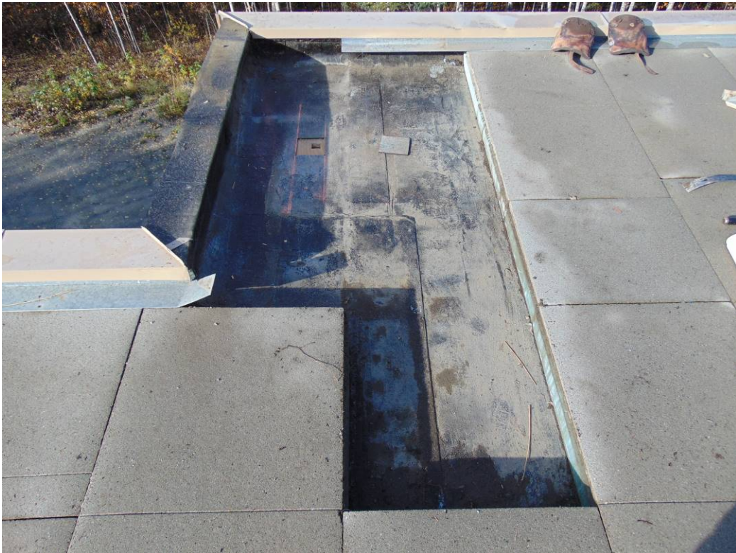
Photograph 19. – View of existing roof at cut test completed between GLs Q and R and 3 and 4.