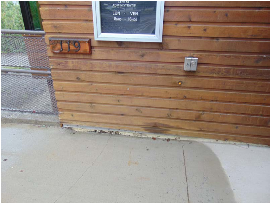
Photograph 17. – Existing barrier-free operator at main entrance