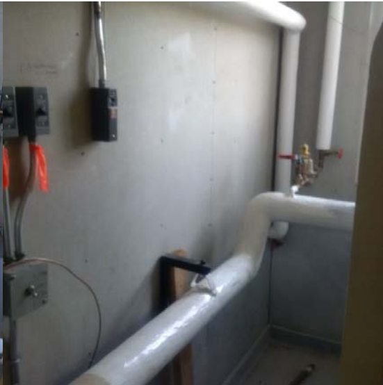
2. Insulated piping, misc. wiring