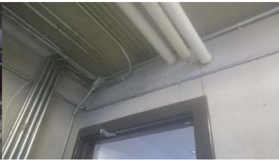
4. Miscellaneous wiring