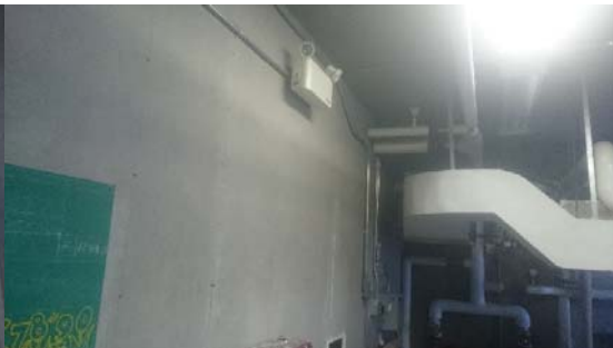
6. Emergency lighting