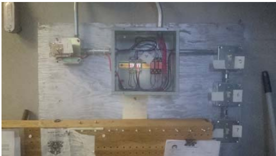
5. Electrical equipment