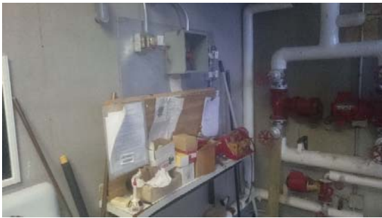
3. Insulated piping and valves