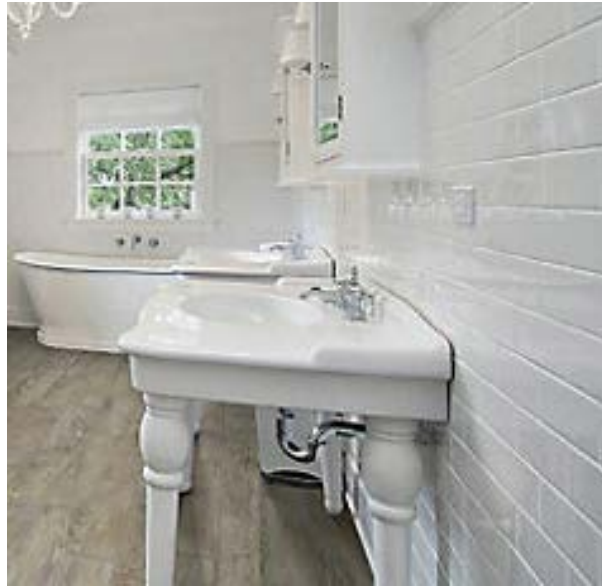
Picture 6 – White ceramic tile for 2 nd floor bathroom for reference