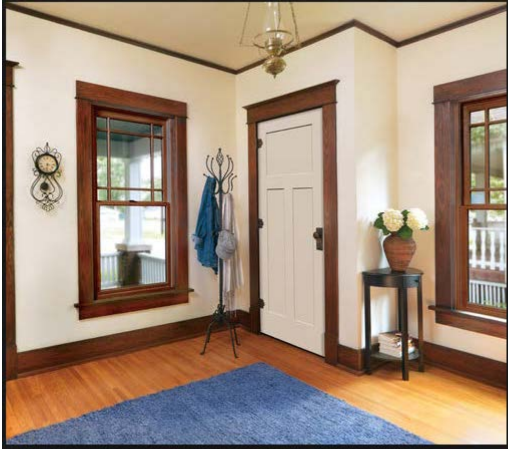
Picture 2 – Reference for the colour of the trims around the windows and doors