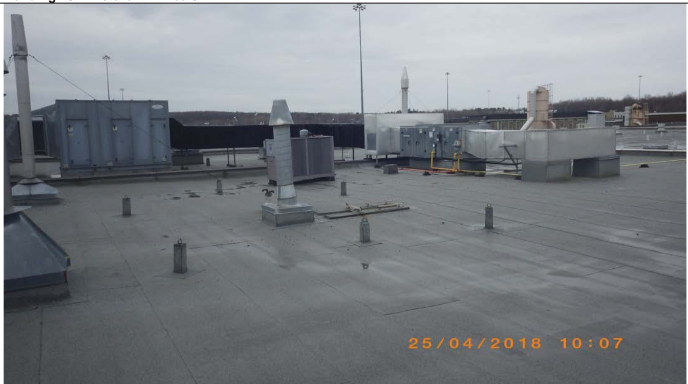
Building 18 – Picture 5 – Area 3