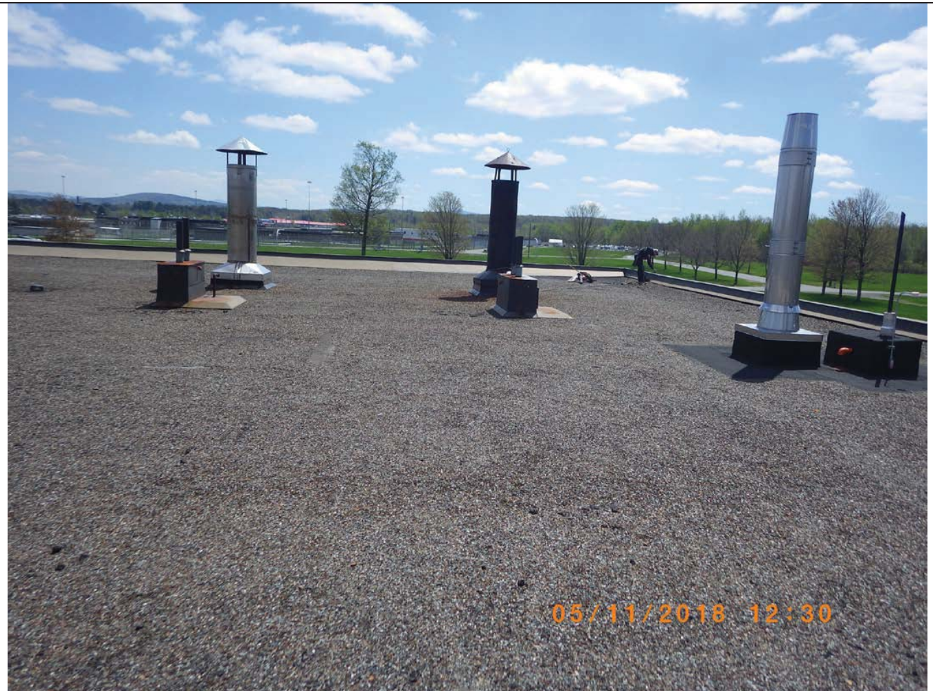
Building A5 – Picture 3