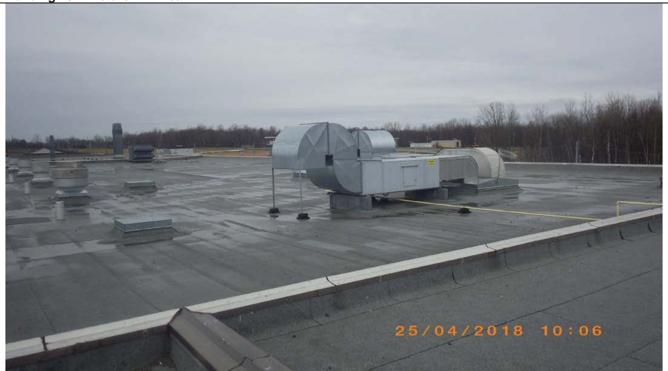
Building 18 – Picture 3 – Area 2