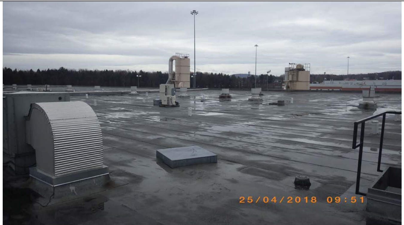
Building 18 – Picture 1 – Area 1