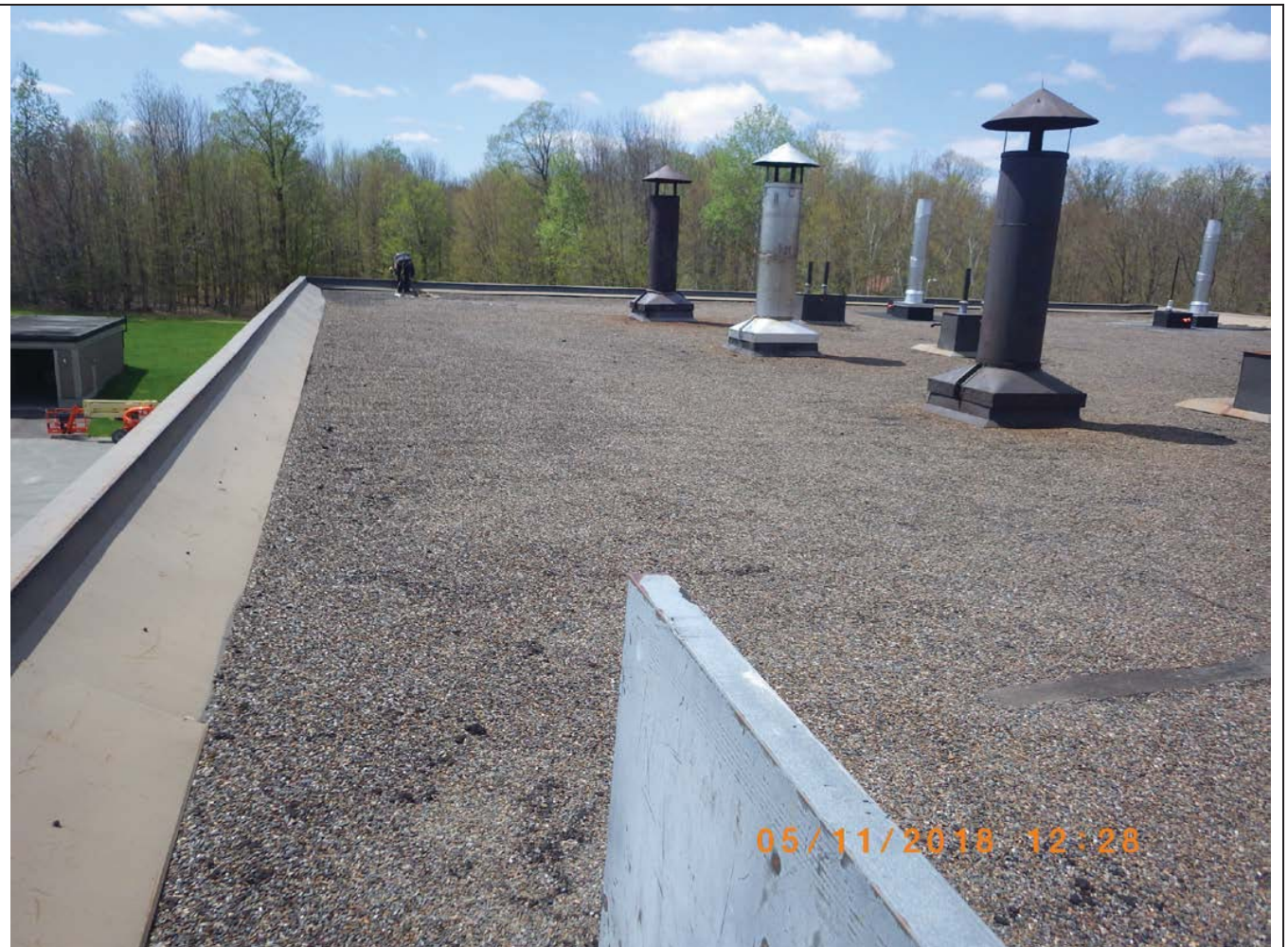
Building A5 – Picture 1

Building A1 : +/- 15'-0" (4,5 m) Building A5 : +/- 35'-0" (9,1 m) Building 3 : +/- 15'-0" (4,5 m) Building 15 : +/- 20'-0" (6,1 m) Building 17 : +/- 20'-0" (6,1 m) Building 18 : +/- 25'-0" (7,6 m)