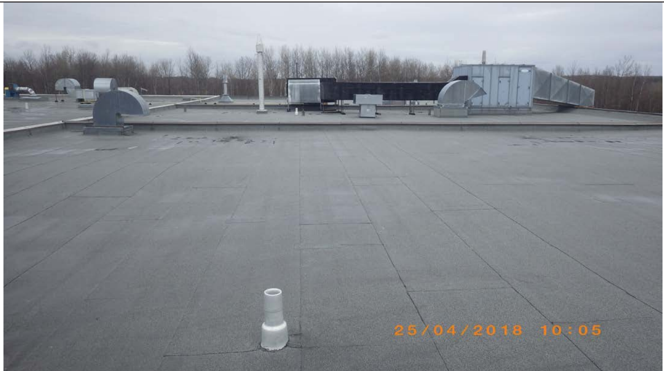
Building 18 – Picture 4 – Area 3