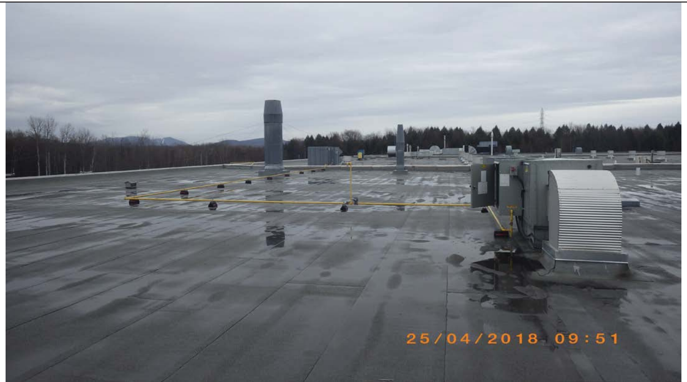
Building 18 – Picture 2 – Area 1