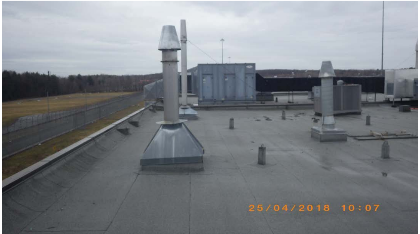
Building 18 – Picture 6 – Area 3