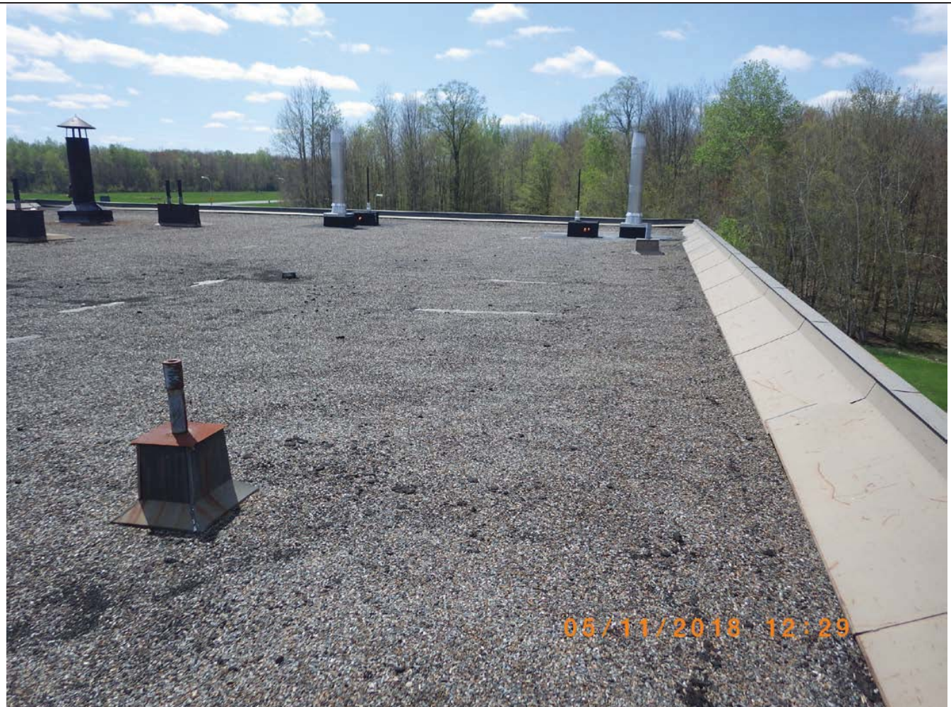
Building A5 – Picture 2