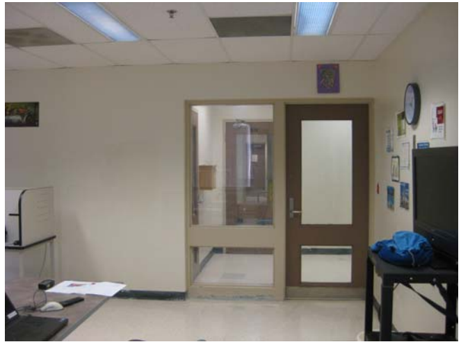
Photo #8 View inside program room E15 to be demolished for new cells