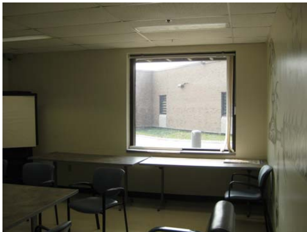
Photo # 7 View inside program room E16 to be demolished for new cells