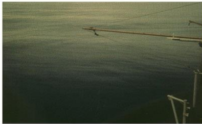
BEAUFORT FORCE 0 WIND SPEED: LESS THAN 1 KNOT SEA: SEA LIKE A MIRROR