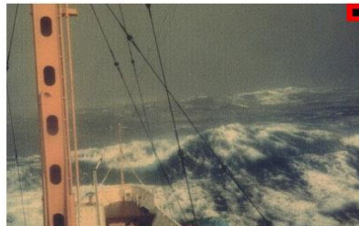
BEAUFORT FORCE 11 WIND SPEED: 56-63 KNOTS SEA: WAVE HEIGHT 11.5-16M (37-52FT), EXCEPTIONALLY HIGH WAVES, SMALL-MEDIUM SIZED SHIPS MAY BE LOST TO VIEW BEHIND THE WAVES, SEA COMPLETELY COVERED WITH LONG WHITE PATCHES OF FOAM LYING ALONG WIND DIRECTION, EVERYWHERE, THE EDGES OF WAVE CRESTS ARE BLOWN INTO FROTH.