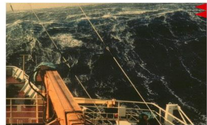
BEAUFORT FORCE 9 WIND SPEED: 41-47 KNOTS SEA: WAVE HEIGHT 7-10M (23-32FT), HIGH WAVES, DENSE STREAKS OF FOAM ALONG DIRECTION OF THE WIND, WAVE CRESTS BEGIN TO TOPPLE, TUMBLE, AND ROLL OVER, SPRAY MAY AFFECT VISIBILITY.