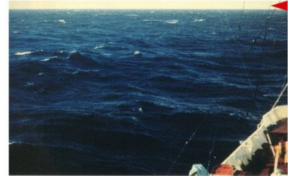
BEAUFORT FORCE 6 WIND SPEED: 22-27 KNOTS SEA: WAVE HEIGHT 3-4M (9.5-13 FT), LARGER WAVES BEGIN TO FORM, SPRAY IS PRESENT, WHITE FOAM CRESTS ARE EVERYWHERE