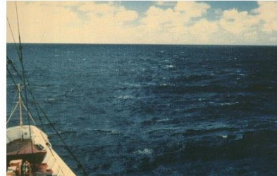
BEAUFORT FORCE 5 WIND SPEED: 17-21 KNOTS SEA: WAVE HEIGHT 2-2.5M (6-8FT), MODERATE WAVES TAKING MORE PRONOUNCED LONG FORM, MANY WHITE HORSES, CHANCE OF SOME SPRAY