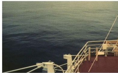
BEAUFORT FORCE 1 WIND SPEED: 1-3 KNOTS SEA: WAVE HEIGHT 1M (25FT), RIPPLES WITH THE APPEARANCE OF SCALES, BUT WITHOUT FOAM CRESTS