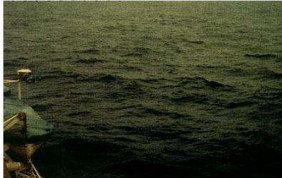
BEAUFORT FORCE 4 WIND SPEED: 11-16 KNOTS SEA: WAVE HEIGHT 1-1.5M (3.5-5FT), SMALL WAVES BECOMING LONGER, FAIRLY FREQUENT WHITE HORSES