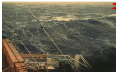
BEAUFORT FORCE 8 WIND SPEED: 34-40 KNOTS SEA: WAVE HEIGHT 5.5-7.5M (18-25FT), MODERATELY HIGH WAVES OF GREATER LENGTH, EDGES OF CREST BEGIN TO BREAK INTO THE SPINDRIFT, FOAM BLOWN IN WELL MARKED STREAKS ALONG WIND DIRECTION.