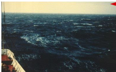
BEAUFORT FORCE 7 WIND SPEED: 28-33 KNOTS SEA: WAVE HEIGHT 4-5.5M (13.5-19 FT), SEA HEAPS UP, WHITE FOAM FROM BREAKING WAVES BEGINS TO BE BLOWN IN STREAKS ALONG THE WIND DIRECTION