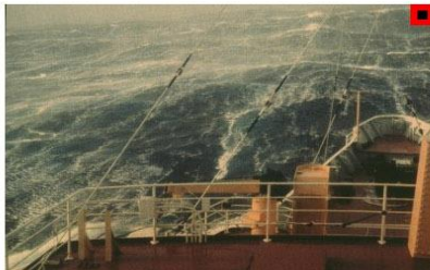
BEAUFORT FORCE 10 WIND SPEED: 48-55 KNOTS SEA: WAVE HEIGHT 9-12.5M (29-41FT), VERY HIGH WAVES WITH LONG OVERHANGING CRESTS, THE RESULTING FOAM, IN GREAT PATCHES, IS BLOWN IN DENSE WHITE STREAKS ALONG WIND DIRECTION, ON THE WHOLE, SEA SURFACE TAKES A WHITE APPEARANCE, TUMBLING OF THE SEA IS HEAVY AND SHOCK-LIKE, VISIBILITY AFFECTED.