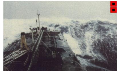
BEAUFORT FORCE 12 WIND SPEED: 64 KNOTS SEA: SEA COMPLETELY WHITE WITH DRIVING SPRAY, VISIBILITY VERY SERIOUSLY AFFECTED, THE AIR IS FILLED WITH FOAM AND SPRAY