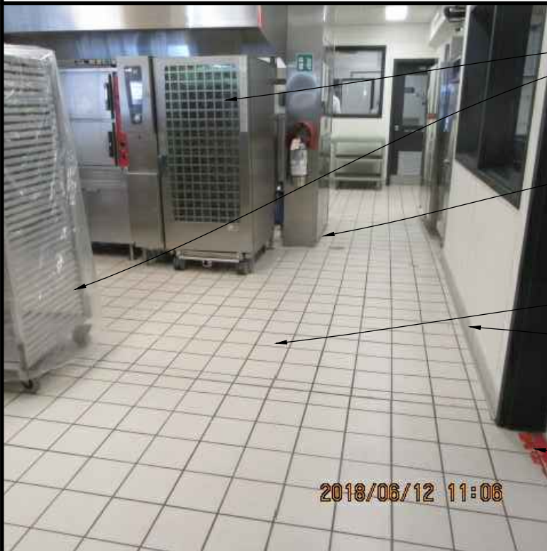
11 PHOTO OF EXISTING CONDITION