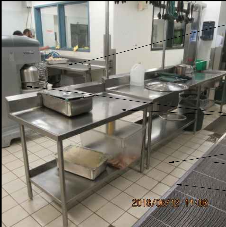
15 PHOTO OF EXISTING CONDITION