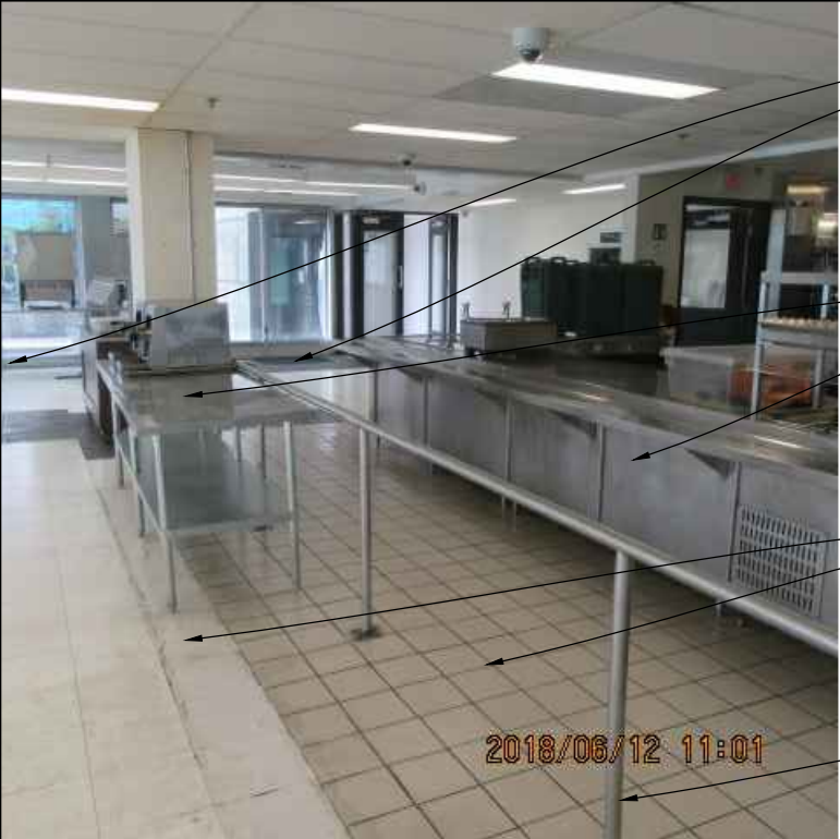
2 PHOTO OF EXISTING CONDITION