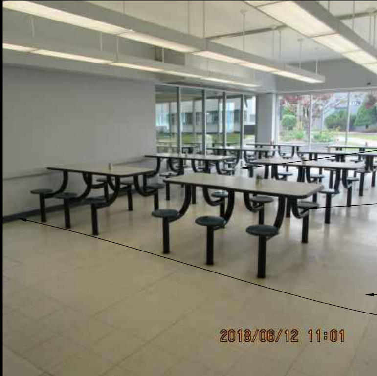
1 PHOTO OF EXISTING CONDITION