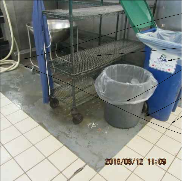
22 PHOTO OF EXISTING CONDITION