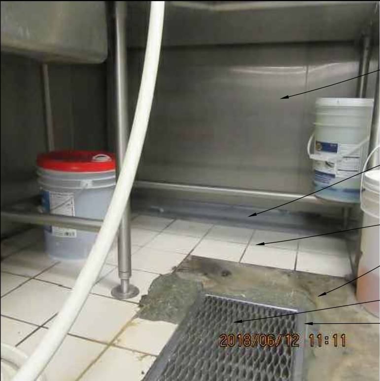
24 PHOTO OF EXISTING CONDITION