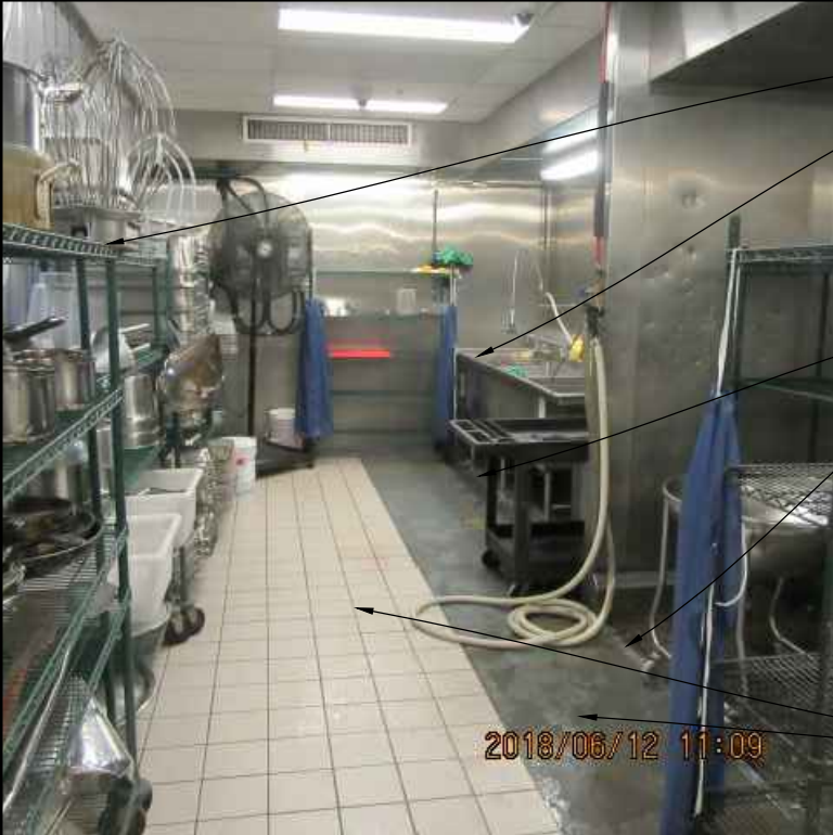
21 PHOTO OF EXISTING CONDITION