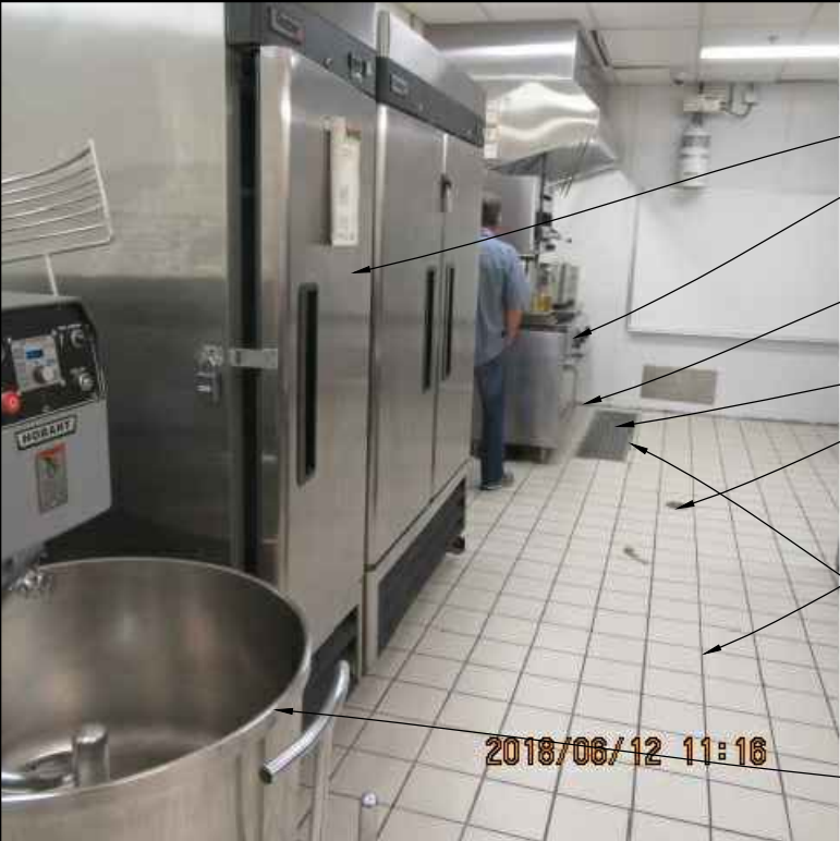
27 PHOTO OF EXISTING CONDITION