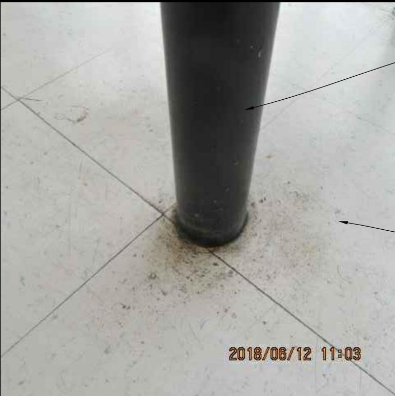
8 PHOTO OF EXISTING CONDITION