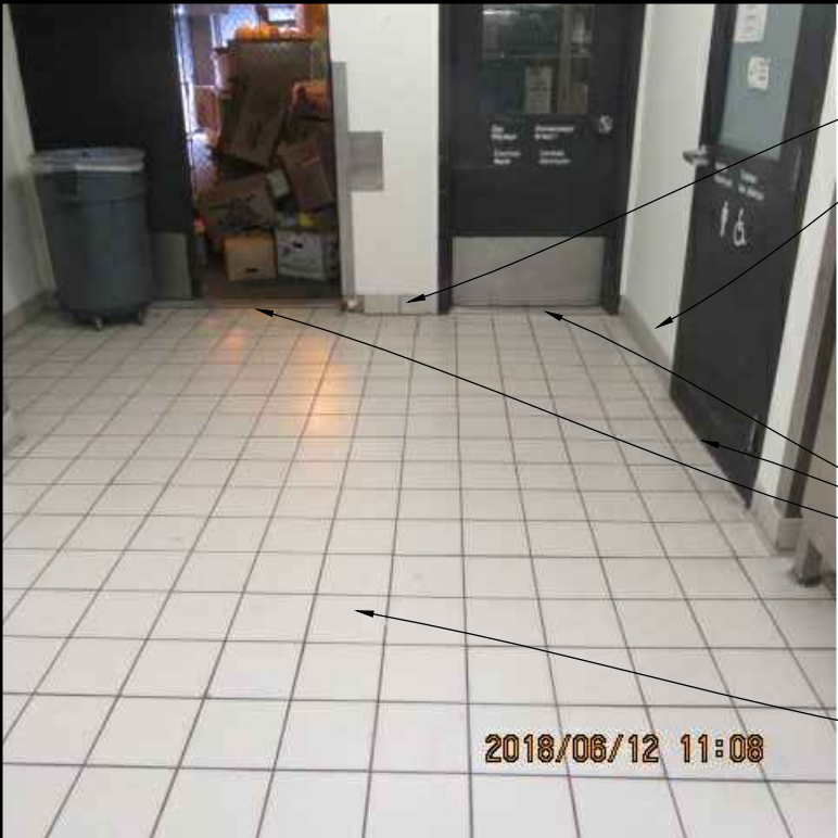
17 PHOTO OF EXISTING CONDITION