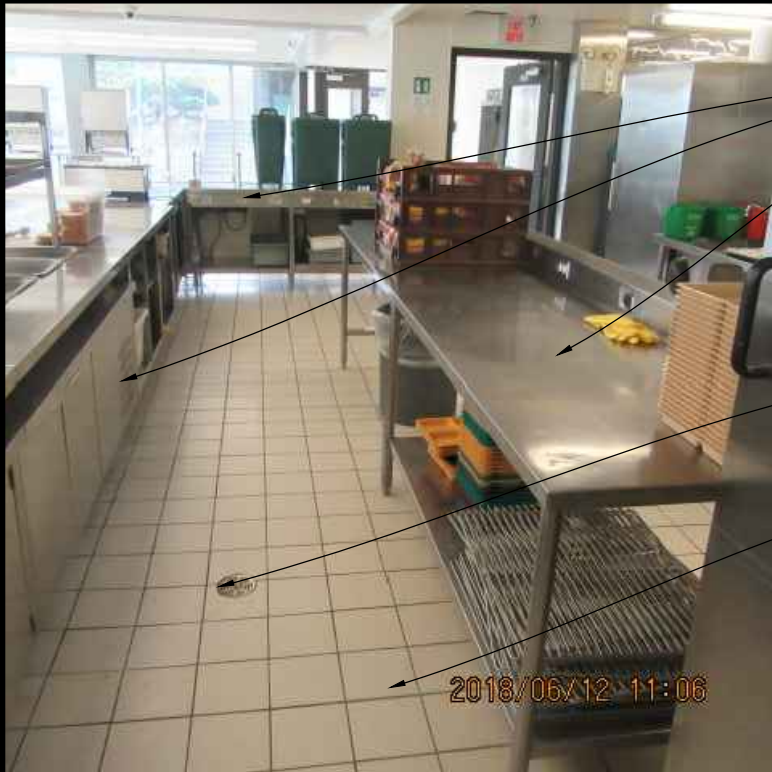
10 PHOTO OF EXISTING CONDITION