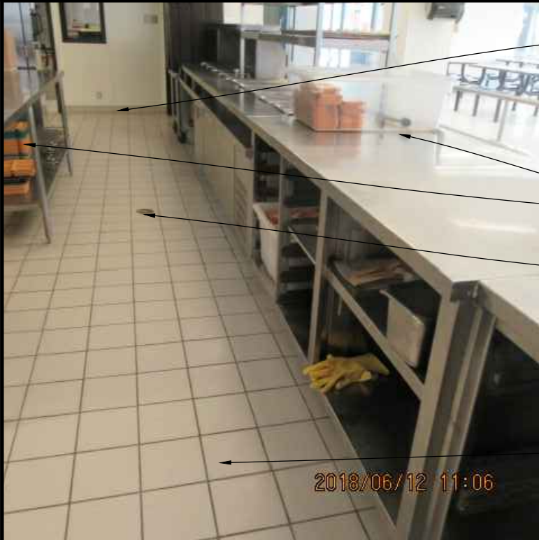
9 PHOTO OF EXISTING CONDITION