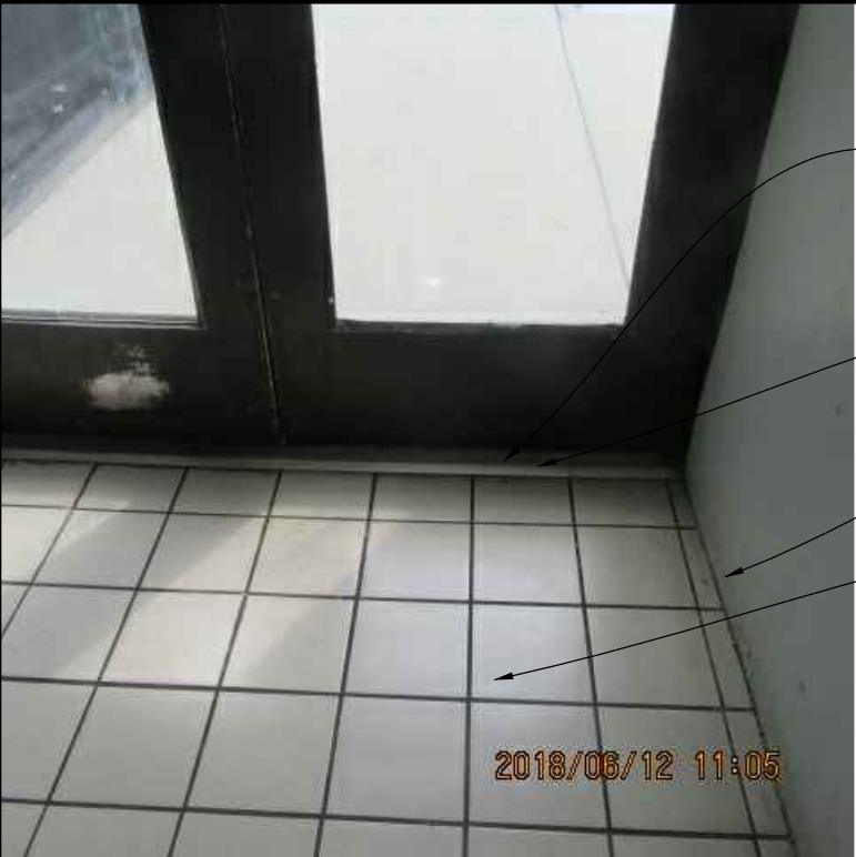
6 PHOTO OF EXISTING CONDITION