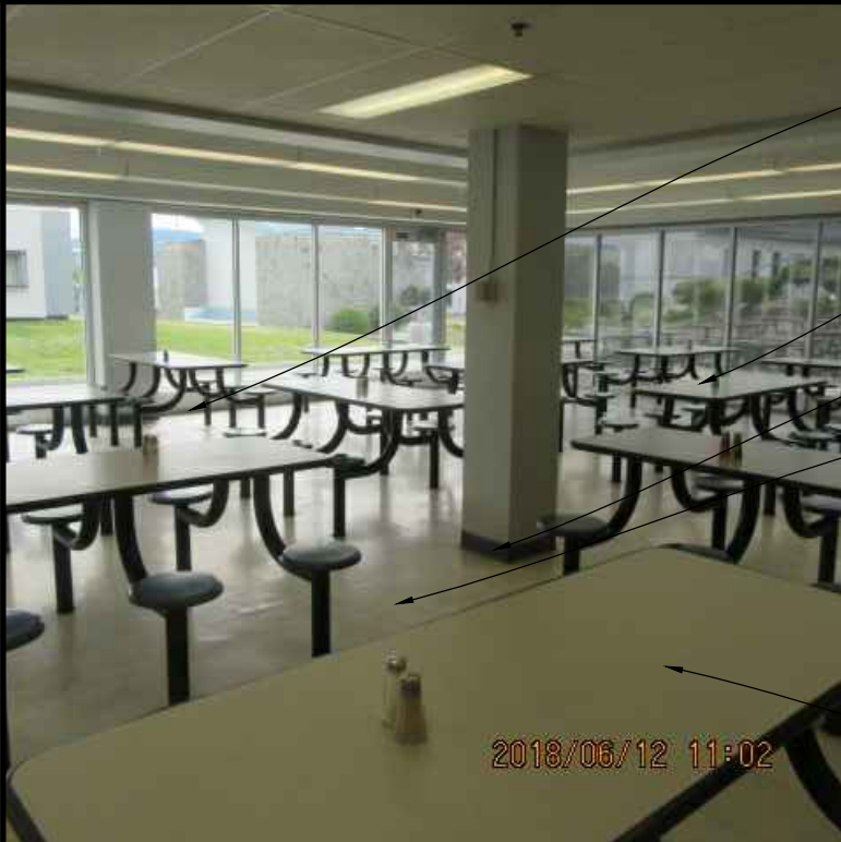
3 PHOTO OF EXISTING CONDITION