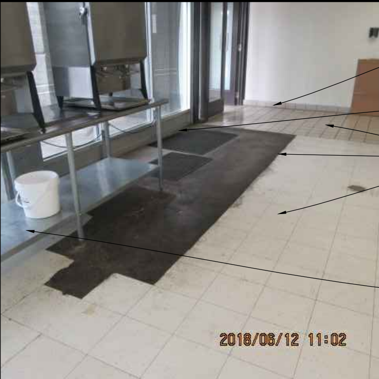
4 PHOTO OF EXISTING CONDITION