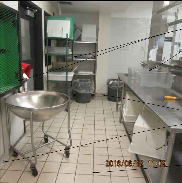
20 PHOTO OF EXISTING CONDITION