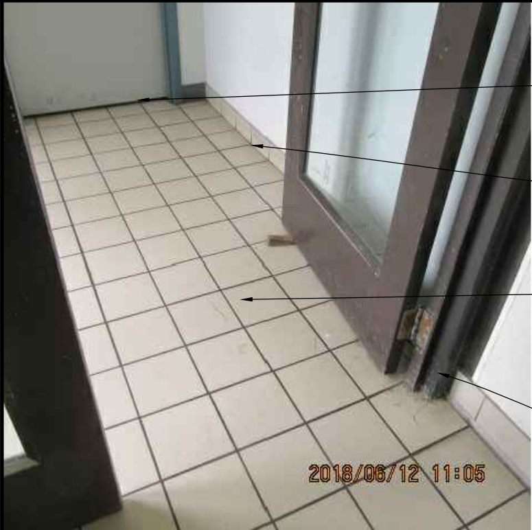
5 PHOTO OF EXISTING CONDITION