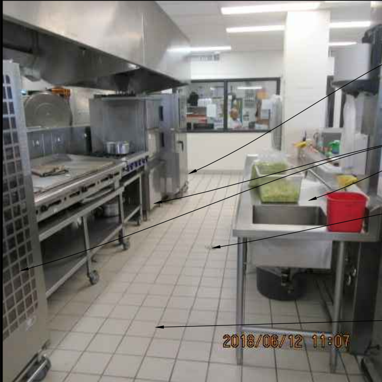
13 PHOTO OF EXISTING CONDITION