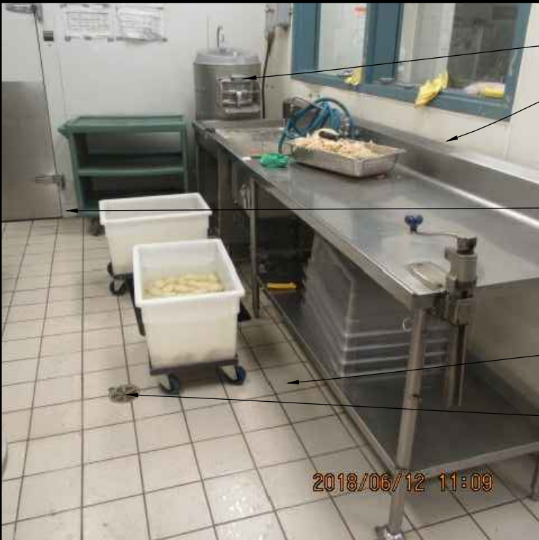
19 PHOTO OF EXISTING CONDITION