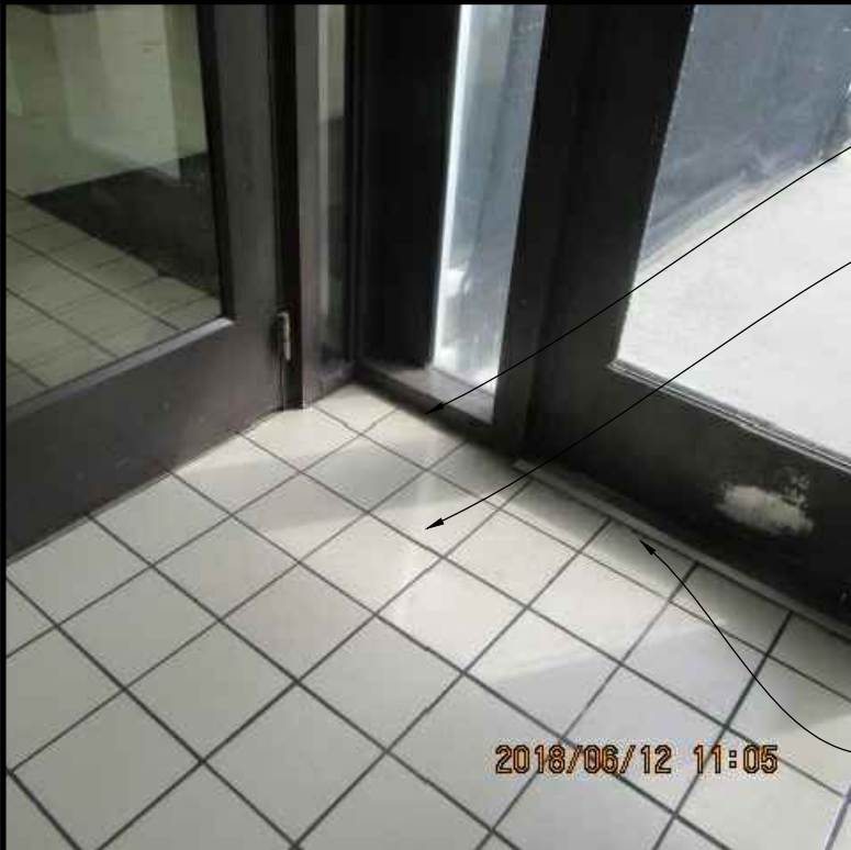
7 PHOTO OF EXISTING CONDITION