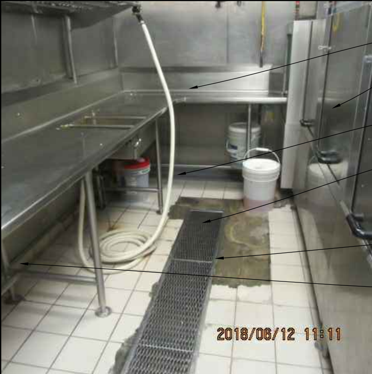
23 PHOTO OF EXISTING CONDITION