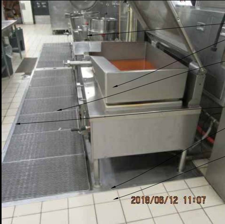
14 PHOTO OF EXISTING CONDITION