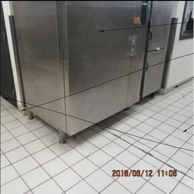
18 PHOTO OF EXISTING CONDITION