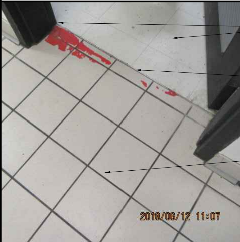
12 PHOTO OF EXISTING CONDITION