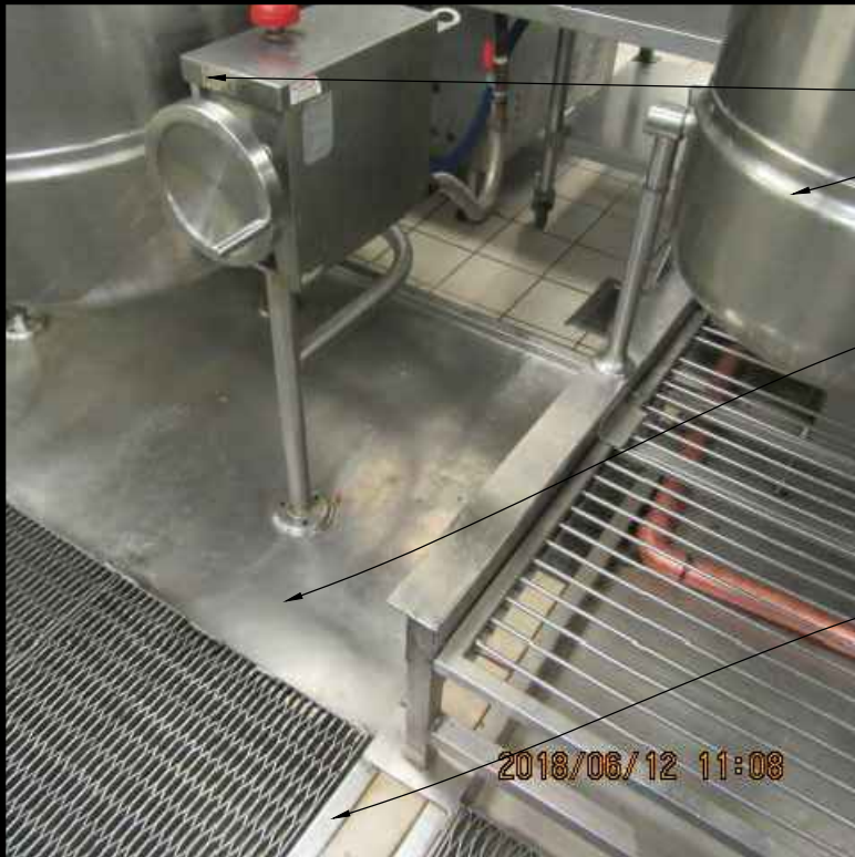
16 PHOTO OF EXISTING CONDITION