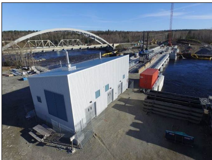
Figure 2: Service building at Latchford Dam. The generator is in the room closest to the foreground; the middle room is the main electrical room.